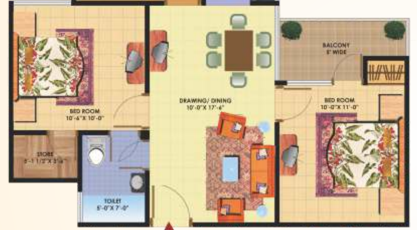
TYPE 5 2BHK+2 TOI.+STORE SUPER AREA : 1015 sq. ft. (94.30 mtr.) BUILT-UP AREA : 736.37 sq. ft. (68.46 mtr.)