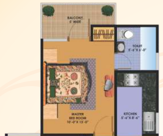
TYPE 4 3BHK+2 TOI.+STORE SUPER AREA : 1225 sq. ft. (113.81 mtr.) BUILT-UP AREA : 877.73 sq. ft. (81.54 mtr.)