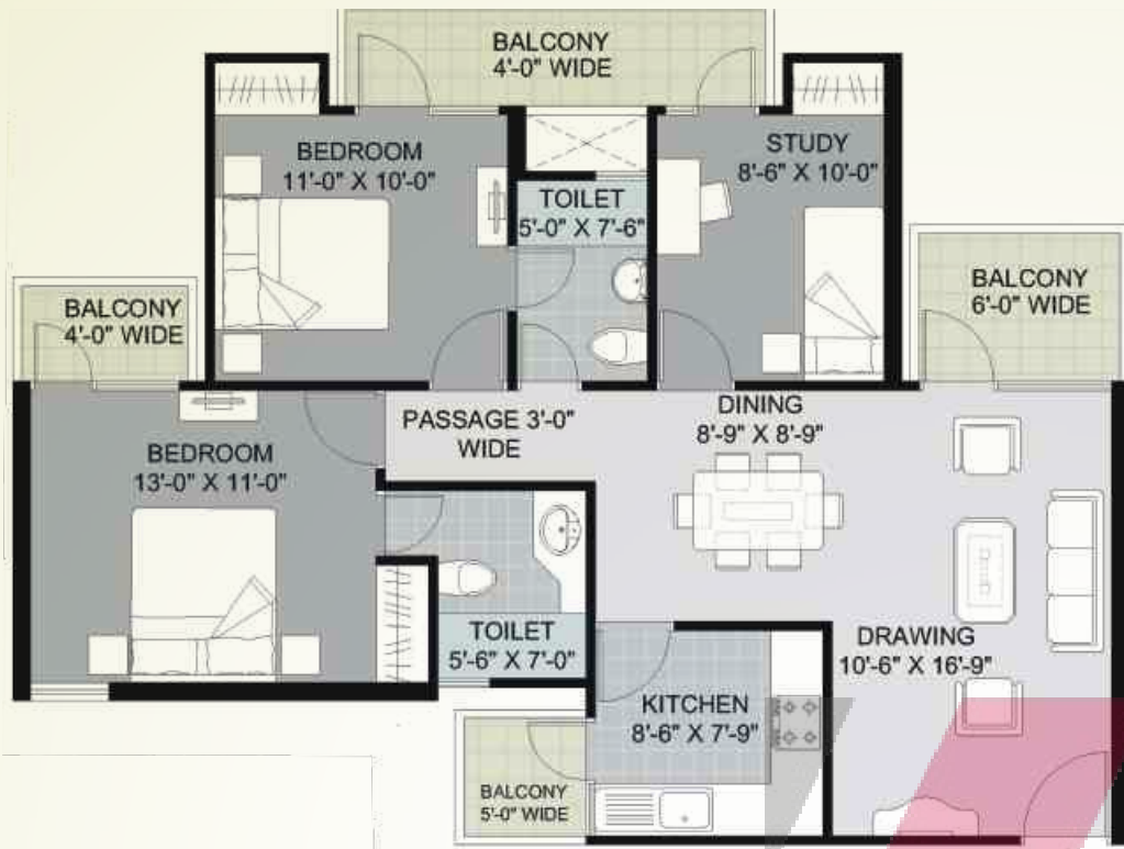
Typical unit – Type A 2 Bedroom + Study 1200 sqft Block A & F