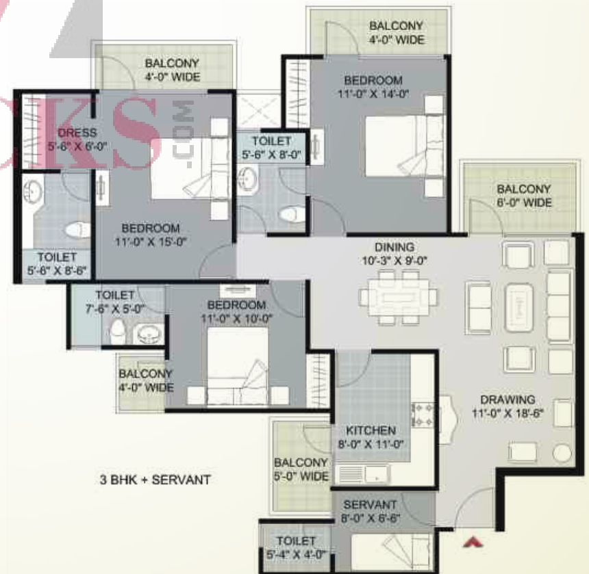
Typical unit - Type D 3 Bedroom + Servant room 1685 sq.ft. Block D