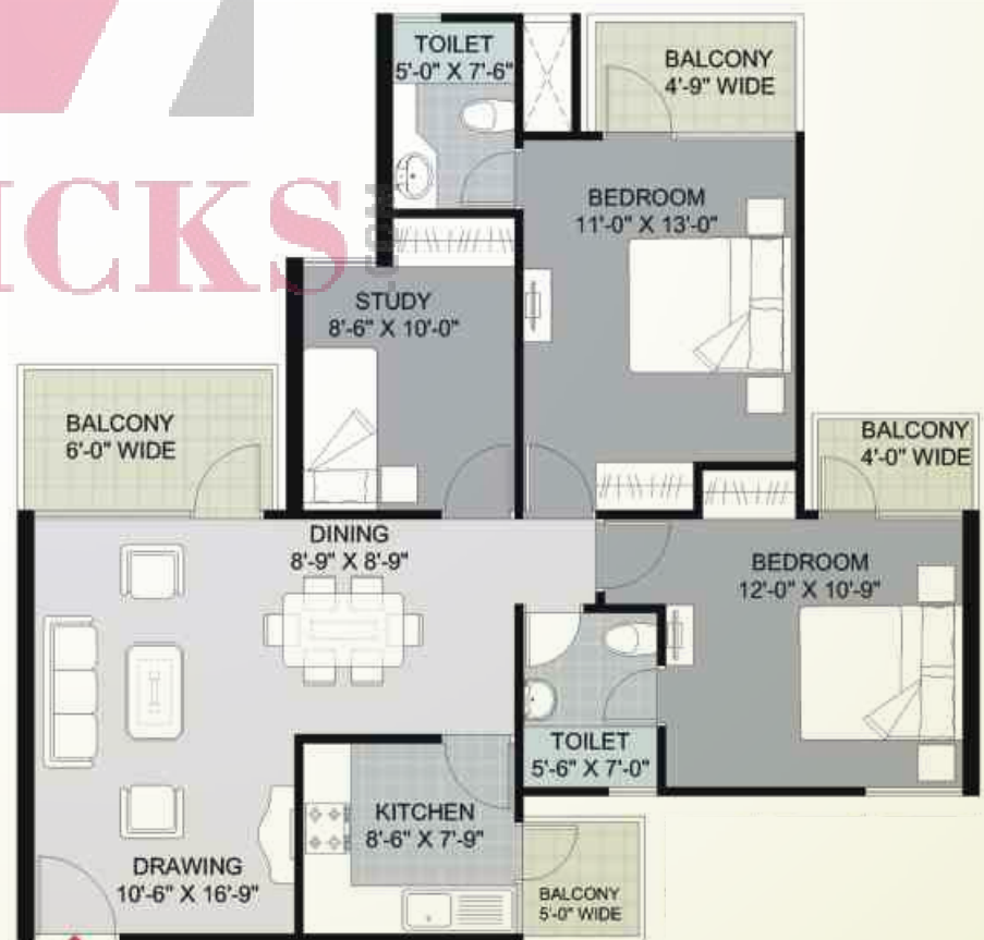
Typical unit – Type B 2 Bedroom + Study 1200 sqft Block B & F