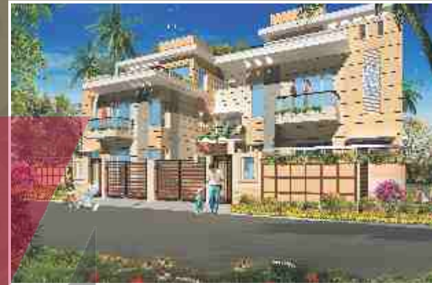
Optus Boutique Villas, Gurgaon