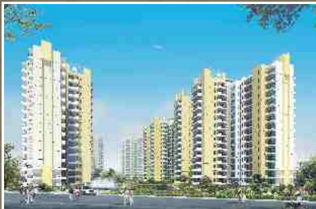
Corona Optus, 37C, Gurgaon