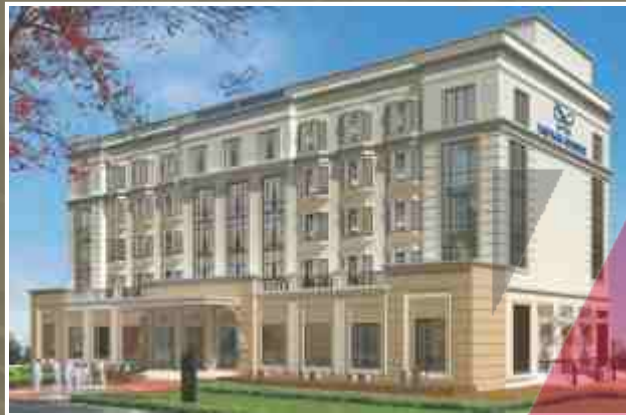
Optus Sarovar Premiere, Sec. 29, Gurgaon