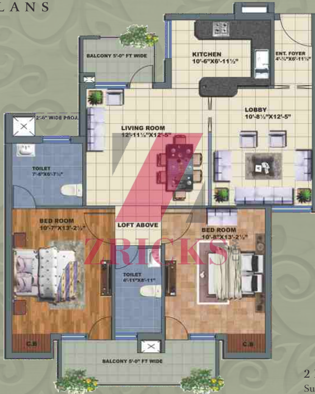
2 Bedroom Apartment Super Area : 1386.53 sq. ft.