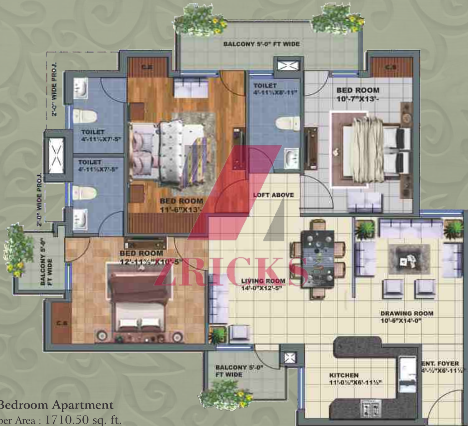
3 Bedroom Apartment Super Area : 1710.50 sq. ft.