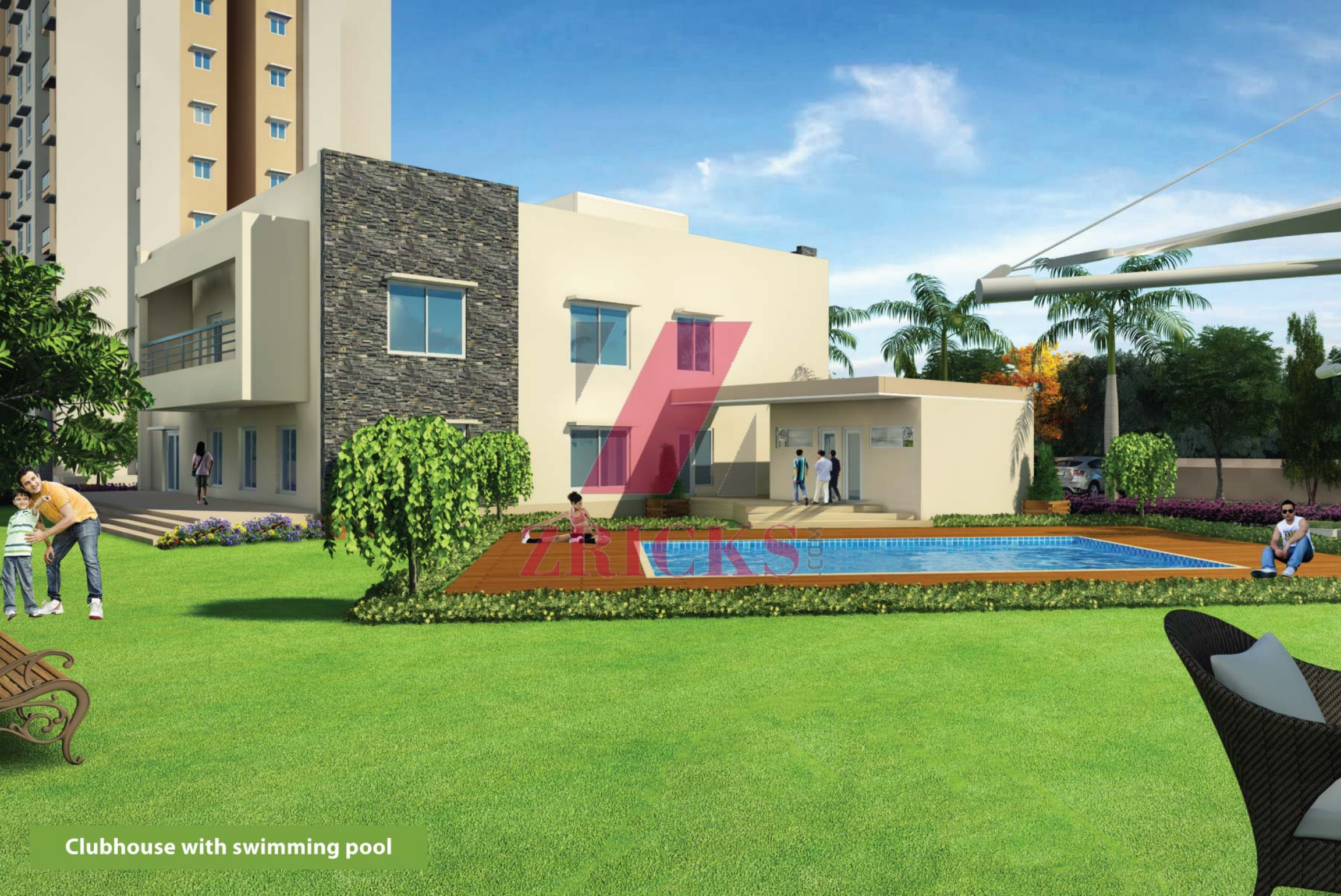
Clubhouse with swimming pool