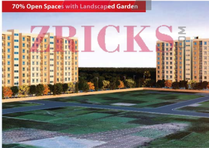
70% Open Spaces with Landscaped Garden