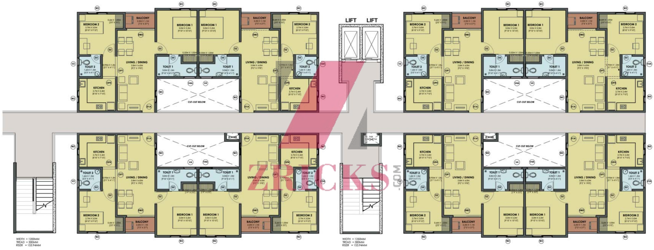
Typical Block Layout