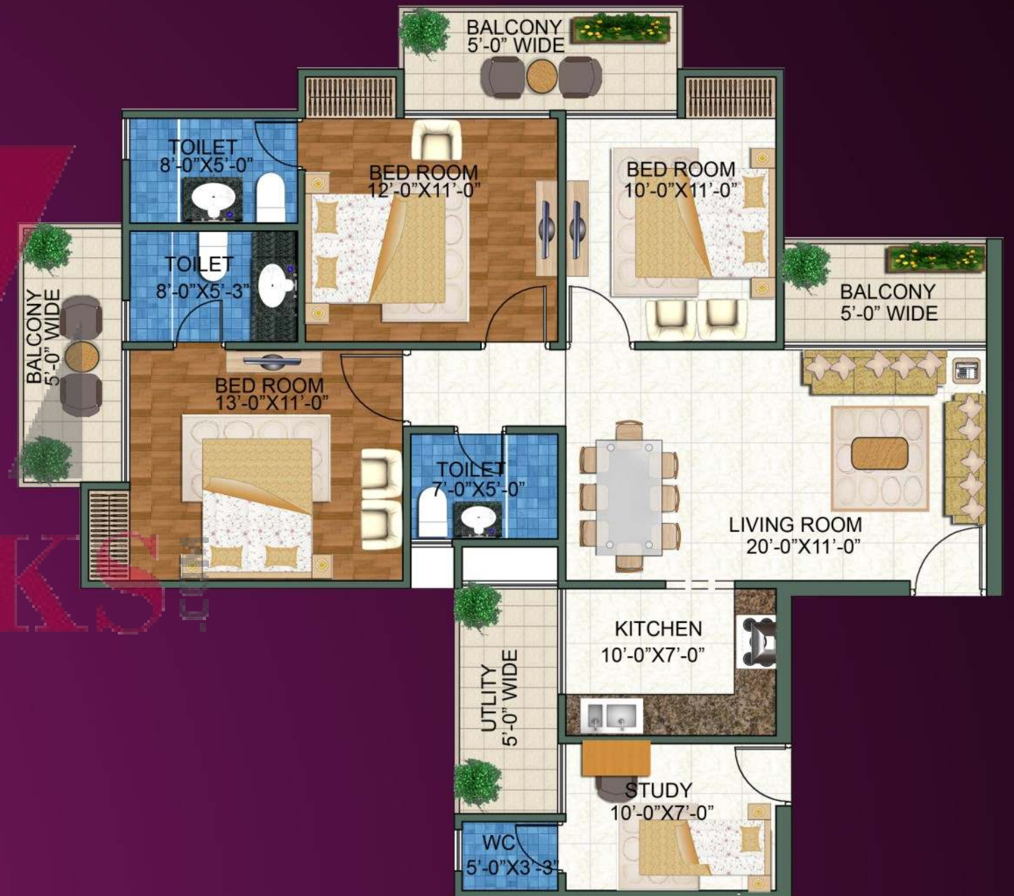
3 BEDROOMS + SERVANT (PLATINUM-3) SUPER AREA = 1656 SQ. FT.