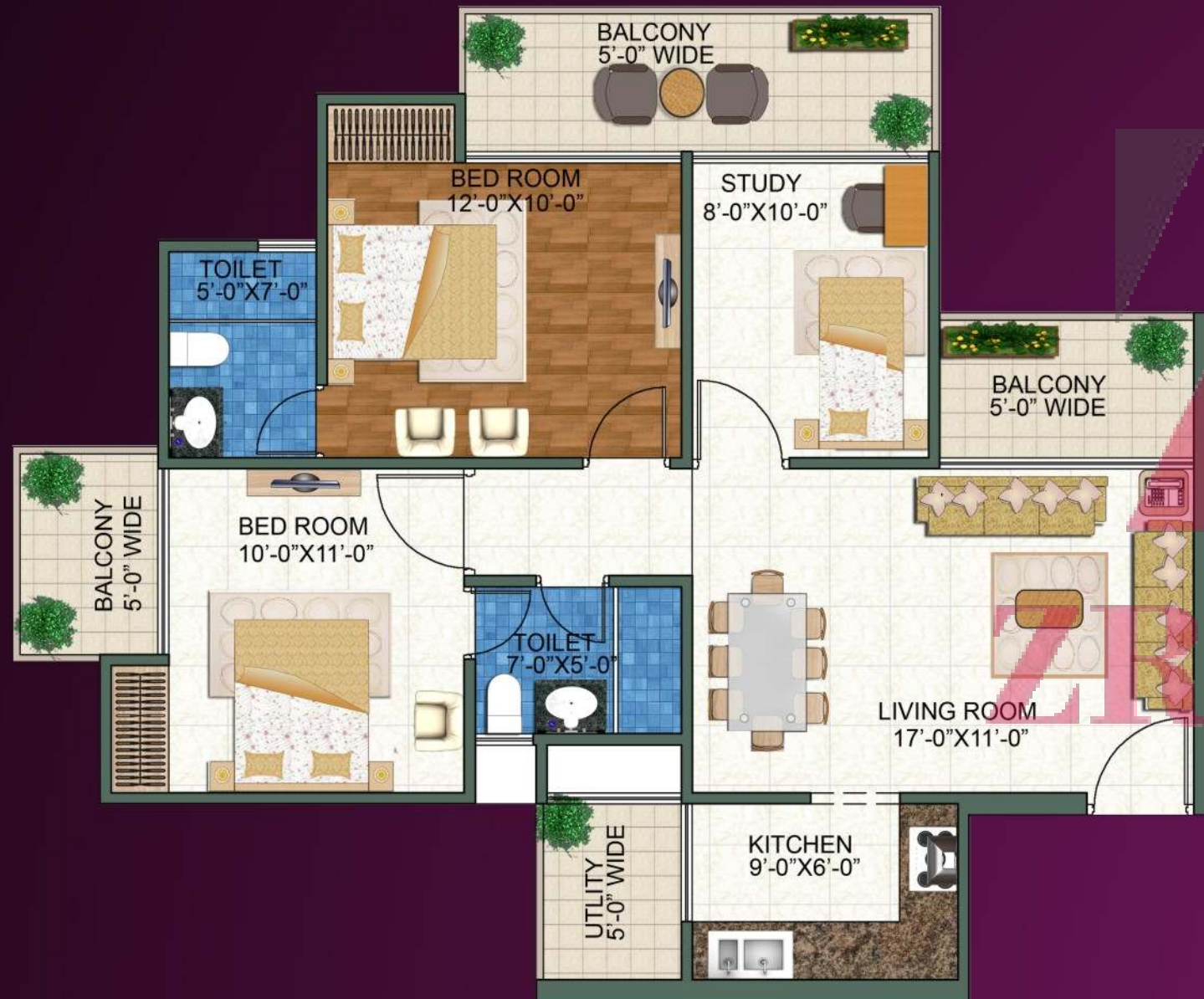
2 BEDROOM (GOLD-3) SUPER AREA = 1225 SQ. FT.