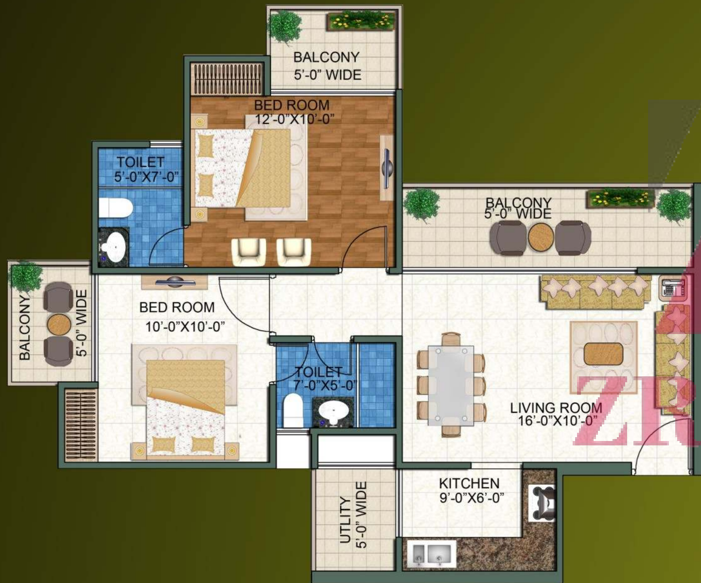
2 BEDROOM (GOLD-1) SUPER AREA = 1050 SQ. FT.