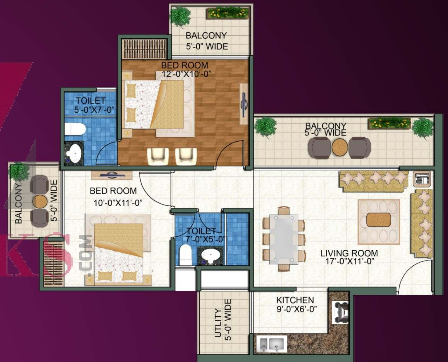
2 BEDROOM (GOLD-2) SUPER AREA = 1115 SQ. FT.