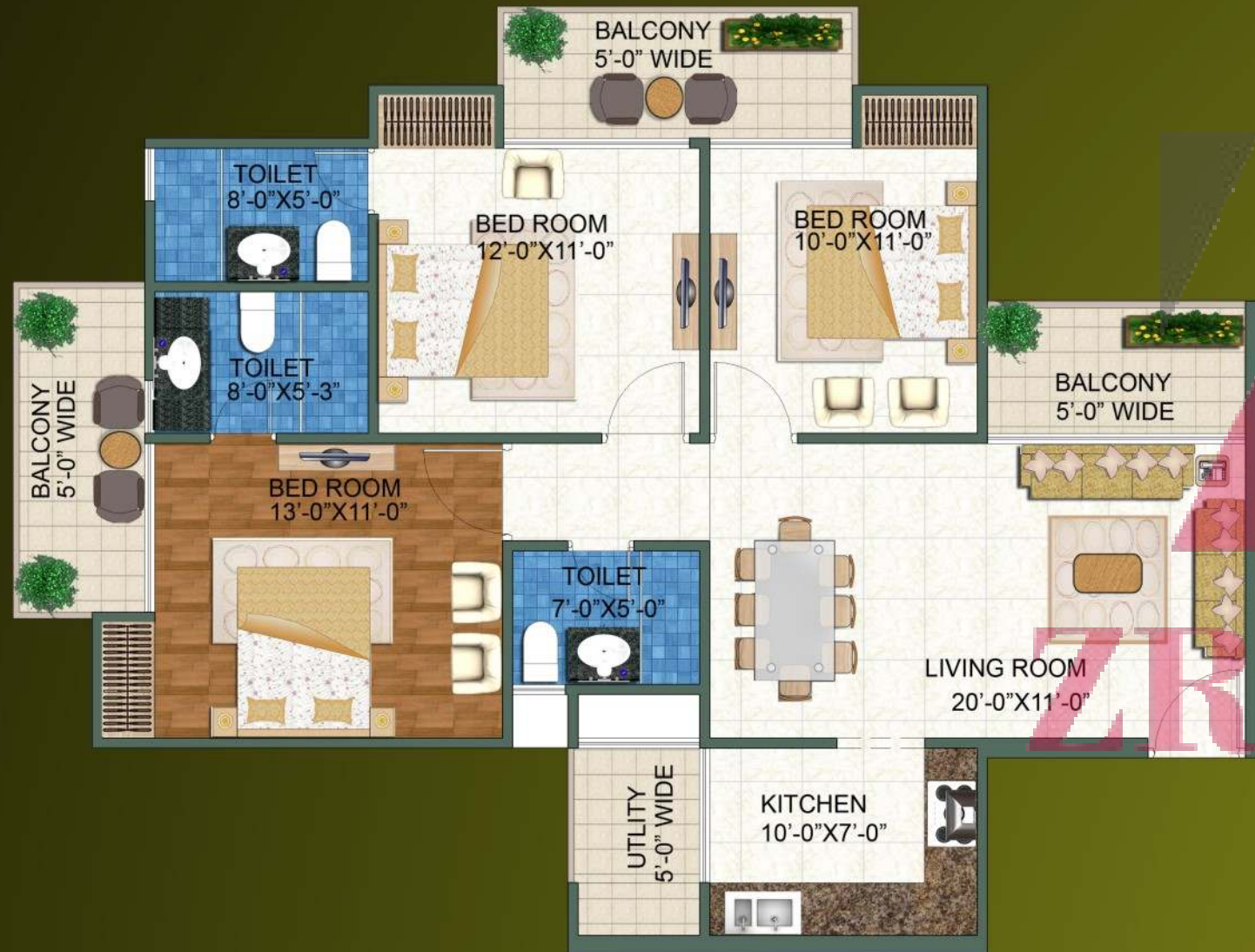
3 BEDROOMS (PLATINUM-2) SUPER AREA = 1500 SQ. FT.