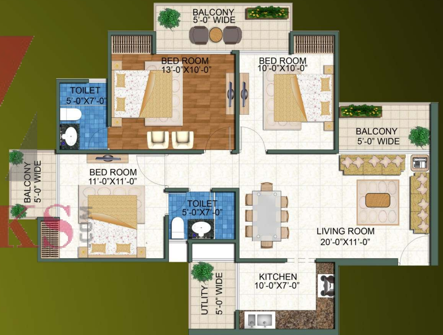
3 BEDROOM (PLATINUM-1) SUPER AREA = 1355 SQ. FT.