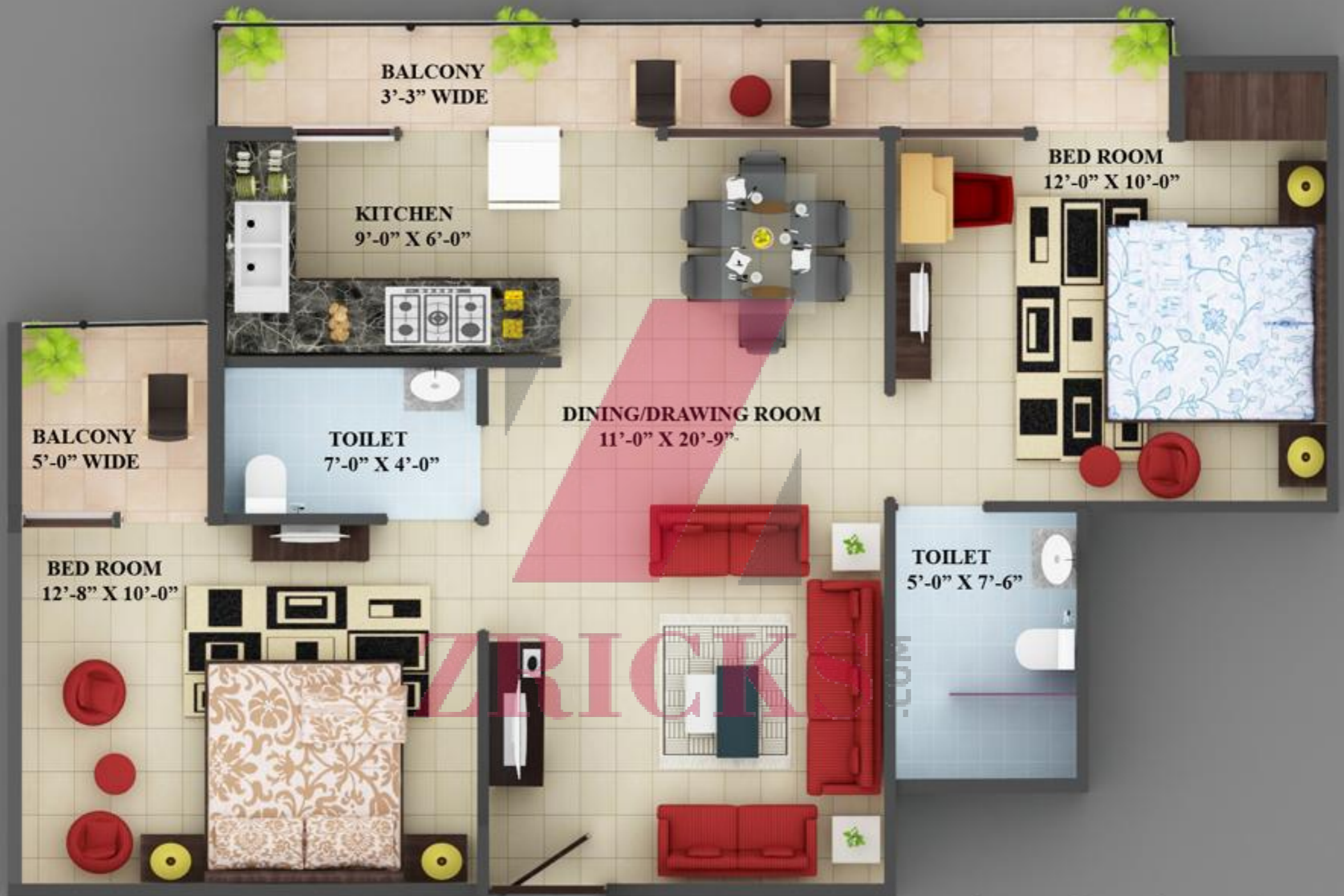
Armelle -The Princess Super Area:1030 Sq.Ft. 2 BHK