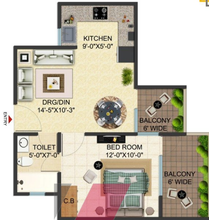
Flat No. 7 • Super Area : 640 sq. ft. 1 Bedroom • Drawing & Dining • 1 Kitchen • 1 Toilet • 2 Balconies