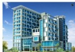
SG Trade Center, Vasundhara, Gzb.