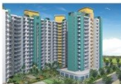
SG Homes, Vasundhara, Gzb.