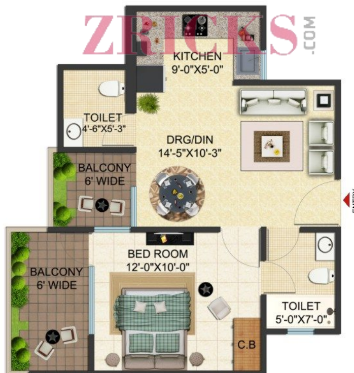
Flat No. 10 : Super Area- 680 sq. ft. 1 Bedroom • Drawing & Dining • 1 Kitchen • 2 Toilets • 2 Balconies