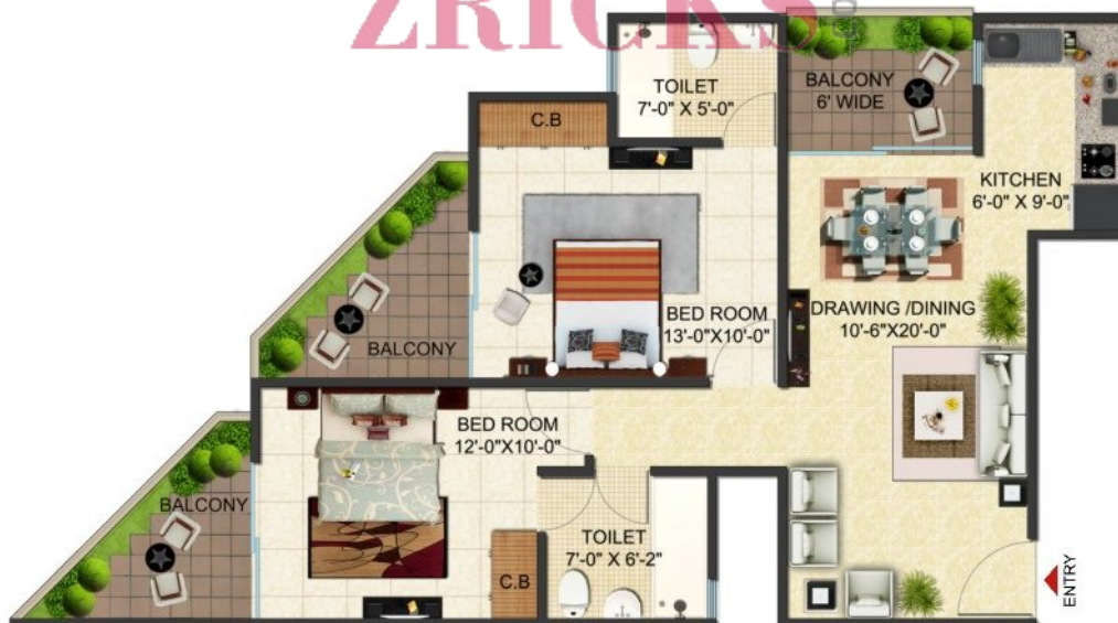
Flat No. 1, 4, 5, 12 • Super Area : 1135 sq. ft. 2 Bedrooms • Drawing & Dining room • 1 Kitchen • 2 Toilets • 3 Balconies