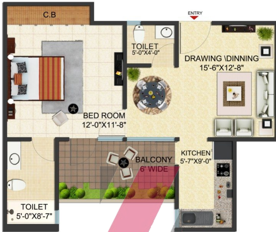
Flat No. 6 • Super Area : 732 sq. ft. 1 Bedroom • Drawing & Dining • 1 Kitchen • 2 Toilets • 1 Balcony