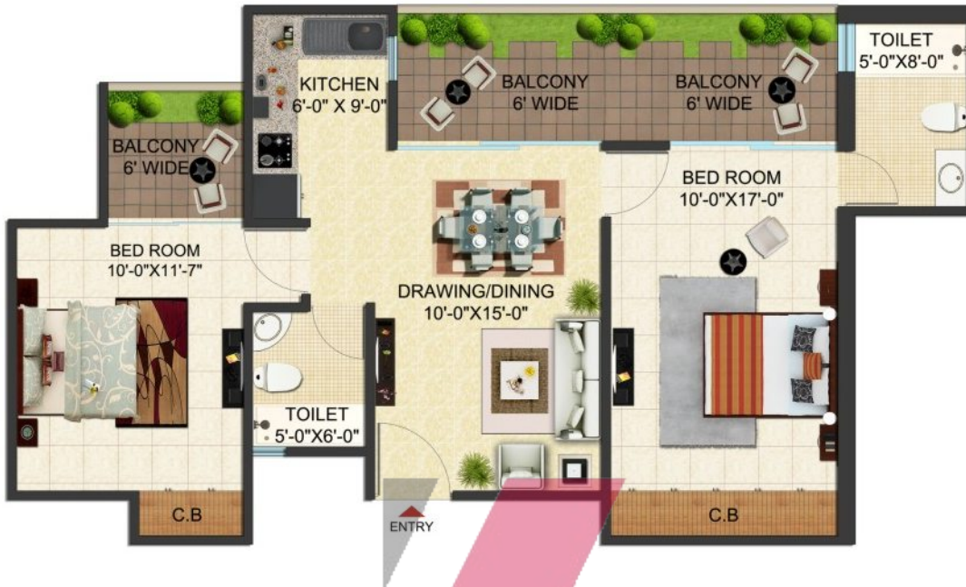
Flat No. 2 • Super Area : 1072 sq. ft. 2 Bedrooms • Drawing & Dining • 1 Kitchen • 2 Toilets • 2 Balconies