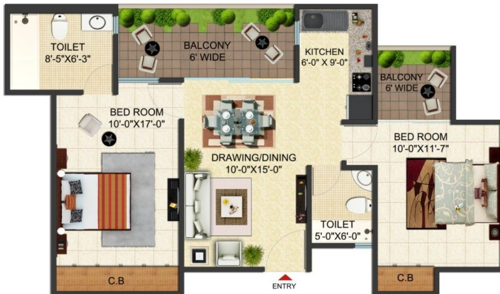
Flat No. 3 • Super Area : 1032 sq. ft. 2 Bedrooms • Drawing & Dining • 1 Kitchen • 2 Toilets • 2 Balconies