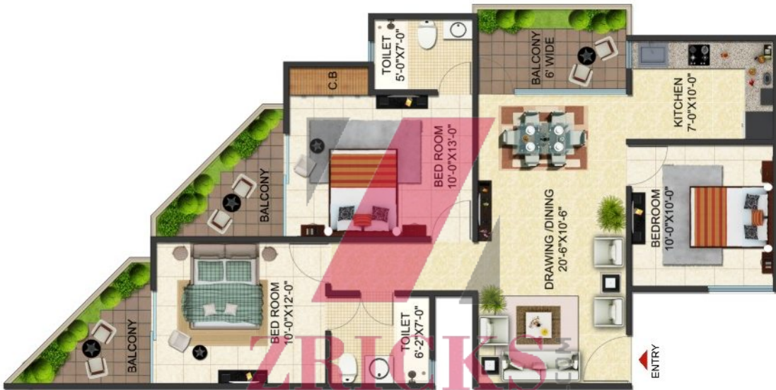
Flat No. 8, 9 • Super Area : 1335 sq. ft. 3 Bedrooms • Drawing & Dining • 1 Kitchen • 2 Toilets • 3 Balconies