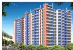
Indigo & Ivory Tower, Rajnagar Extn., Gzb.