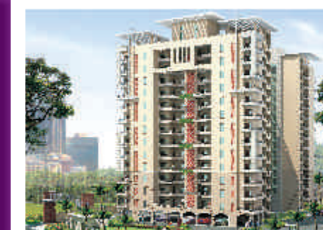
ImpressionsPlus, Rajnagar Extn., Ghaziabad (Under Construction)