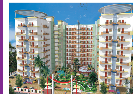
Impressions Vasundhara, Ghaziabad Possession Handed Over (Recently)