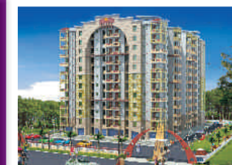
Impressions58, Rajnagar Extn., Ghaziabad (Under Construction)