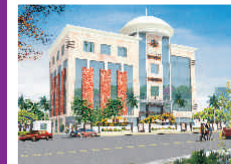
Alpha Corporate Tower, Vasundhara Possession Handed Over (Recently)