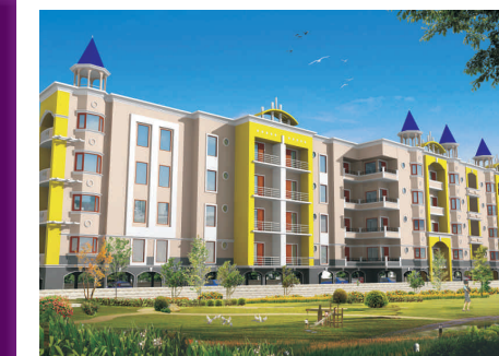
Impressions, Dehradun Possession Handed Over (Recently)