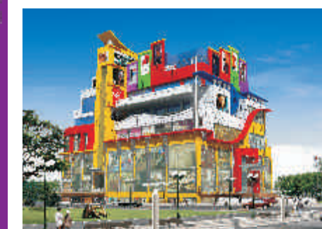
Beta Tower, Vasundhara Possession Handed Over (Recently)