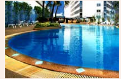
Open Air Swimming Pool