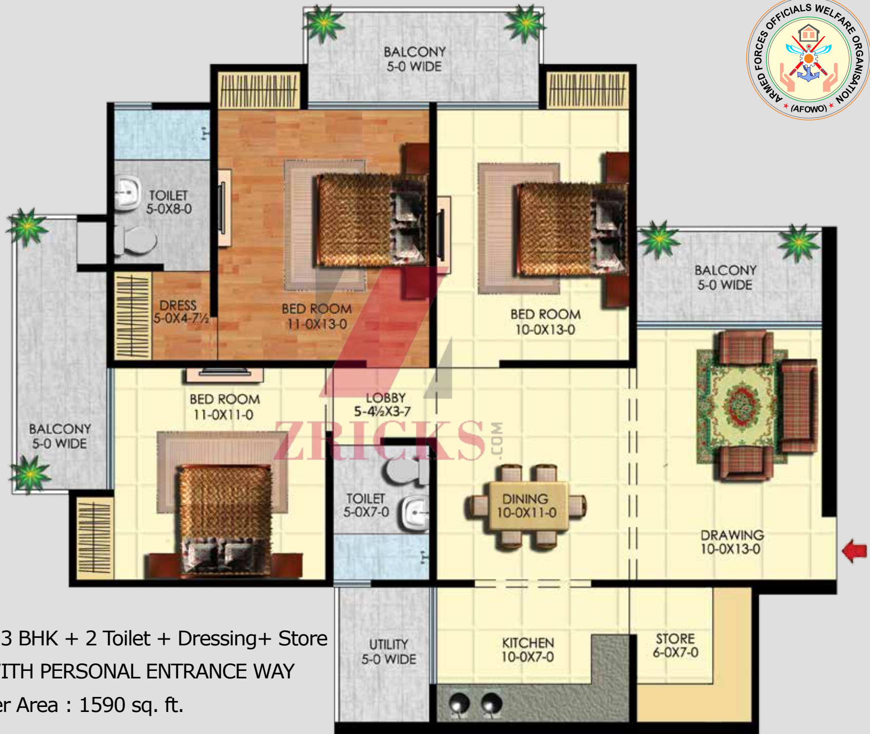
Type 3A : 3 BHK + 2 Toilet + Dressing+ Store HOMES WITH PERSONAL ENTRANCE WAY Total Super Area : 1590 sq. ft.