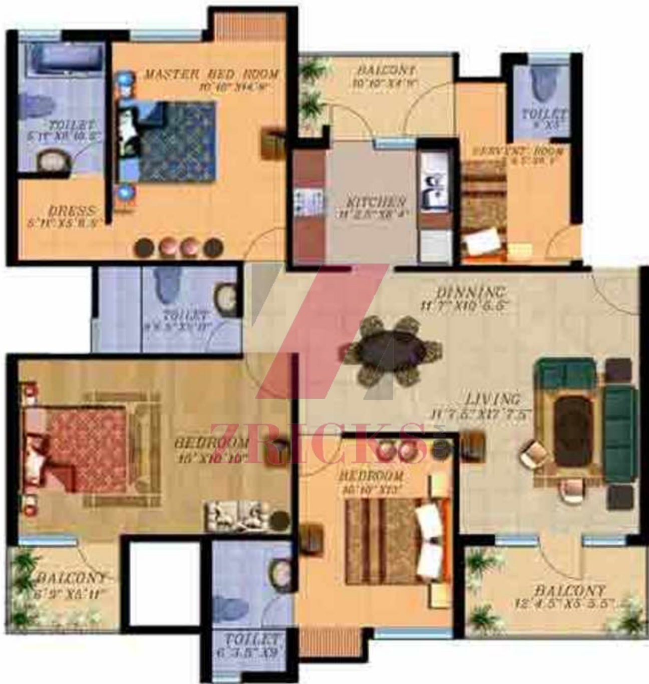
Floor Plan 2055 SQFT