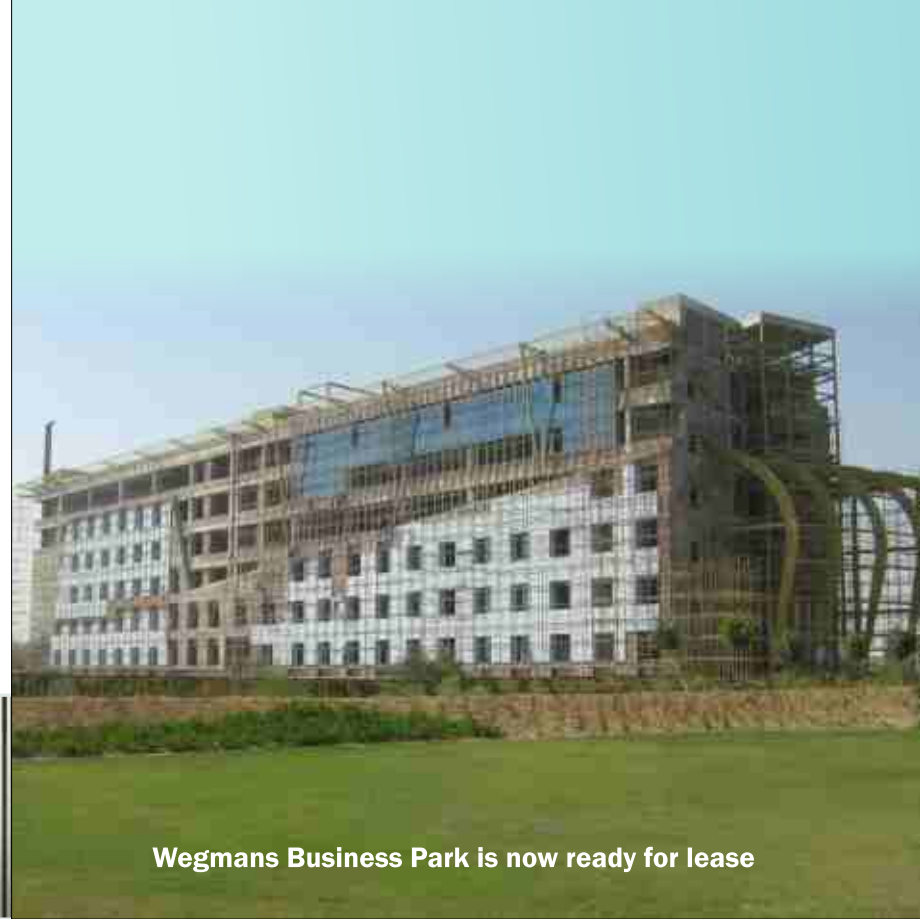
Wegmans Business Park is now ready for lease

3 Lacs sqft. business space available for lease to IT/ITES