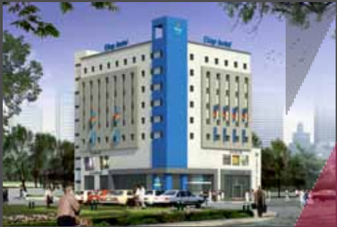
Accor Hotels Plot No-3, Sector Knowledge Park-III, Surajpur Kasna Main Road, Greater Noida City (Opening November 2011)