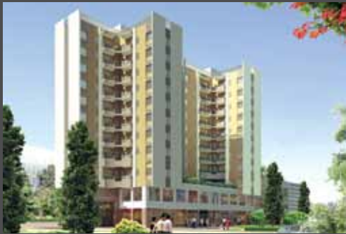
Hi-End Residential Units in posh localities of Delhi (Saket, Shivalik, South Extension etc.)