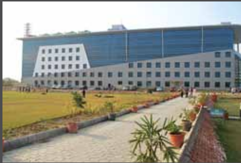
Wegmans Business Park Plot No-3, Sector Knowledge Park-III, Surajpur Kasna Main Road, Greater Noida City