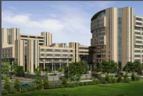
TrustoneCity - SEZ Plot-21, Tech Zone-IV, Greater Noida(Noida Extension)