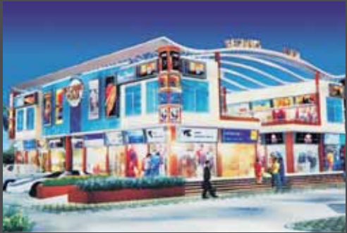
Wegmans Princeton Plaza Plot CSC/OCF, Pocket-H, Sector-18, Rohini, Delhi

TrustoneCity Plot No. – 21, TechZone – IV, Noida Ext Technical Specifications - IT Tower 1