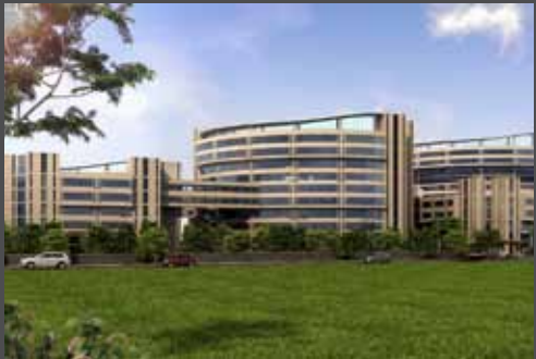
TrustoneCity - SEZ Plot-21, Tech Zone-IV, Greater Noida(Noida Extension)