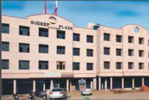
Sudeep Plaza Plot No.3, Pocket-IV, Sector-11, Dwarka, Delhi