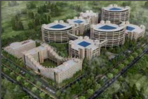
TrustoneCity - SEZ Plot-21, Tech Zone-IV, Greater Noida(Noida Extension)