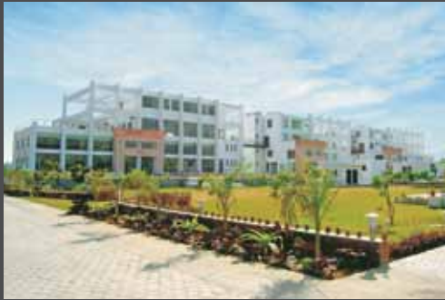
Tivoli Habitat Centre R-1, Sector- 20, Recreational Sector Greater Noida(Opp.J.P.Greens Golf Course)