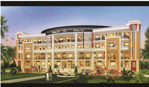
Nimai Arcade (Bhiwadi)