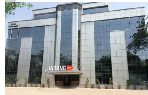
Nimai Panchvati (Gurgaon)