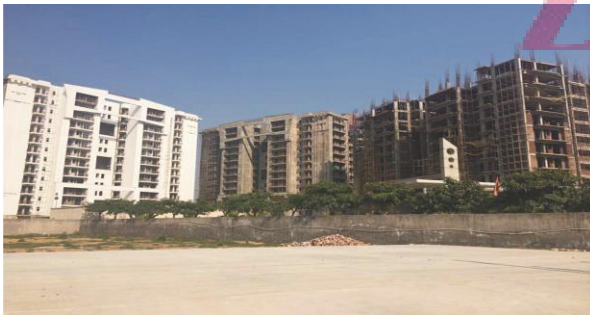
Nimai Greens (Bhiwadi)