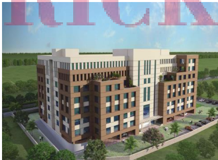
Nimai Tower (Gurgaon)