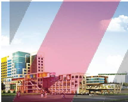
Nimai Place (Gurgaon)