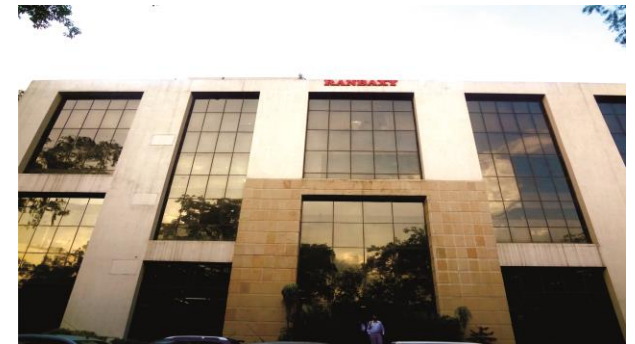
Nimai CRS (Gurgaon)