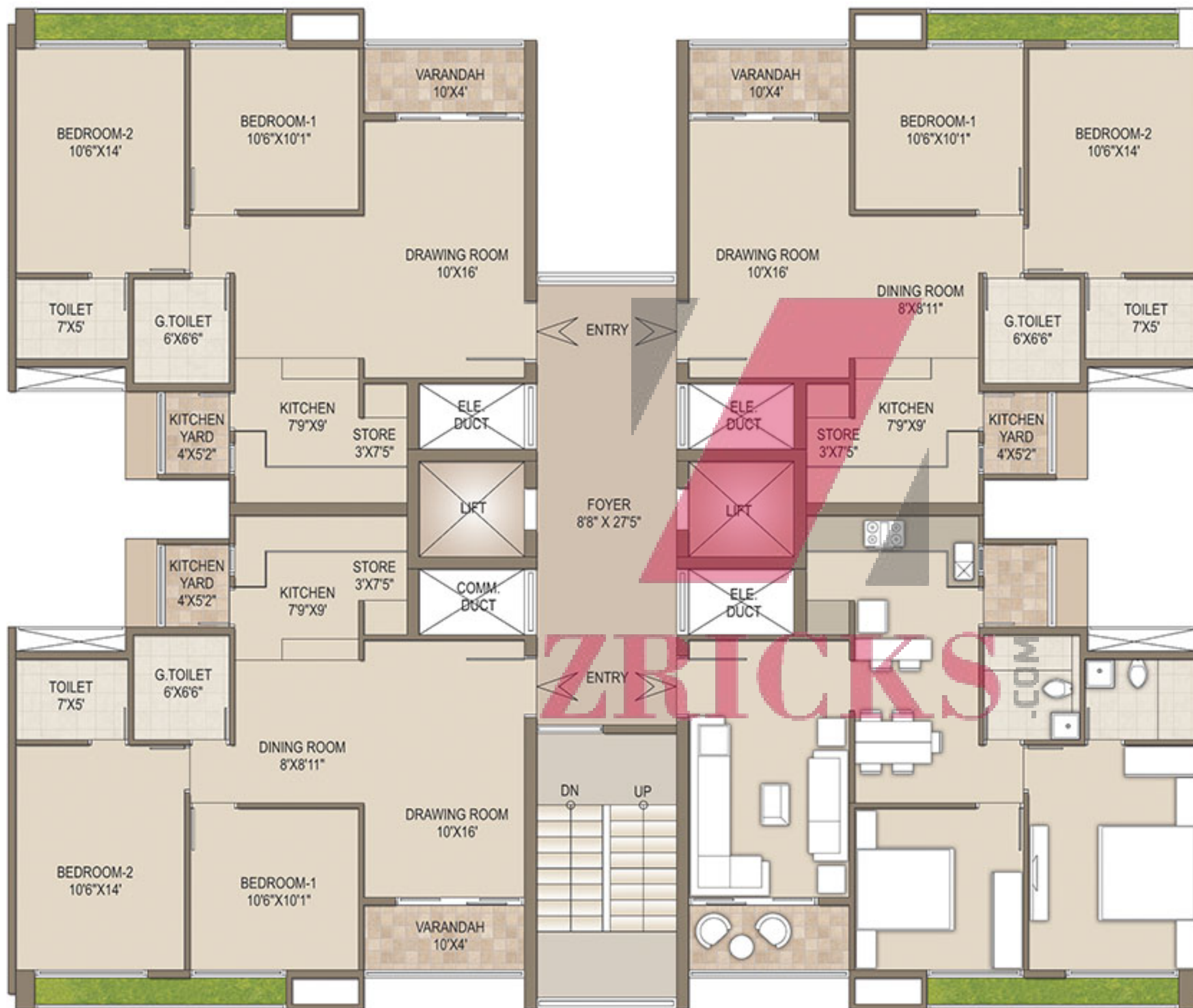
2 BHK TYPICAL UNIT PLAN