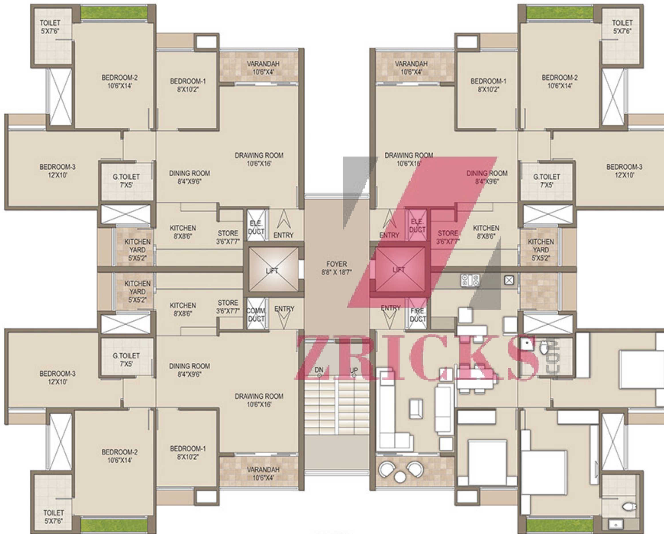
2.5 BHK TYPICAL UNIT PLAN