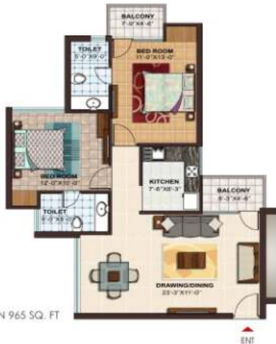
2 BEDROOM UNIT PLAN 965 SQ. FT