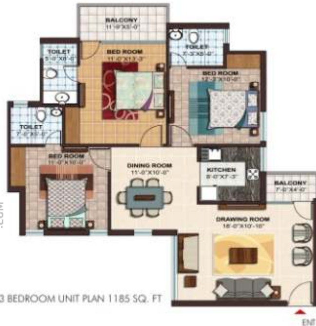
3 BEDROOM UNIT PLAN 1185 SQ. FT