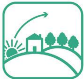
CLIMATICALLY CONSCIOUS ORIENTATION