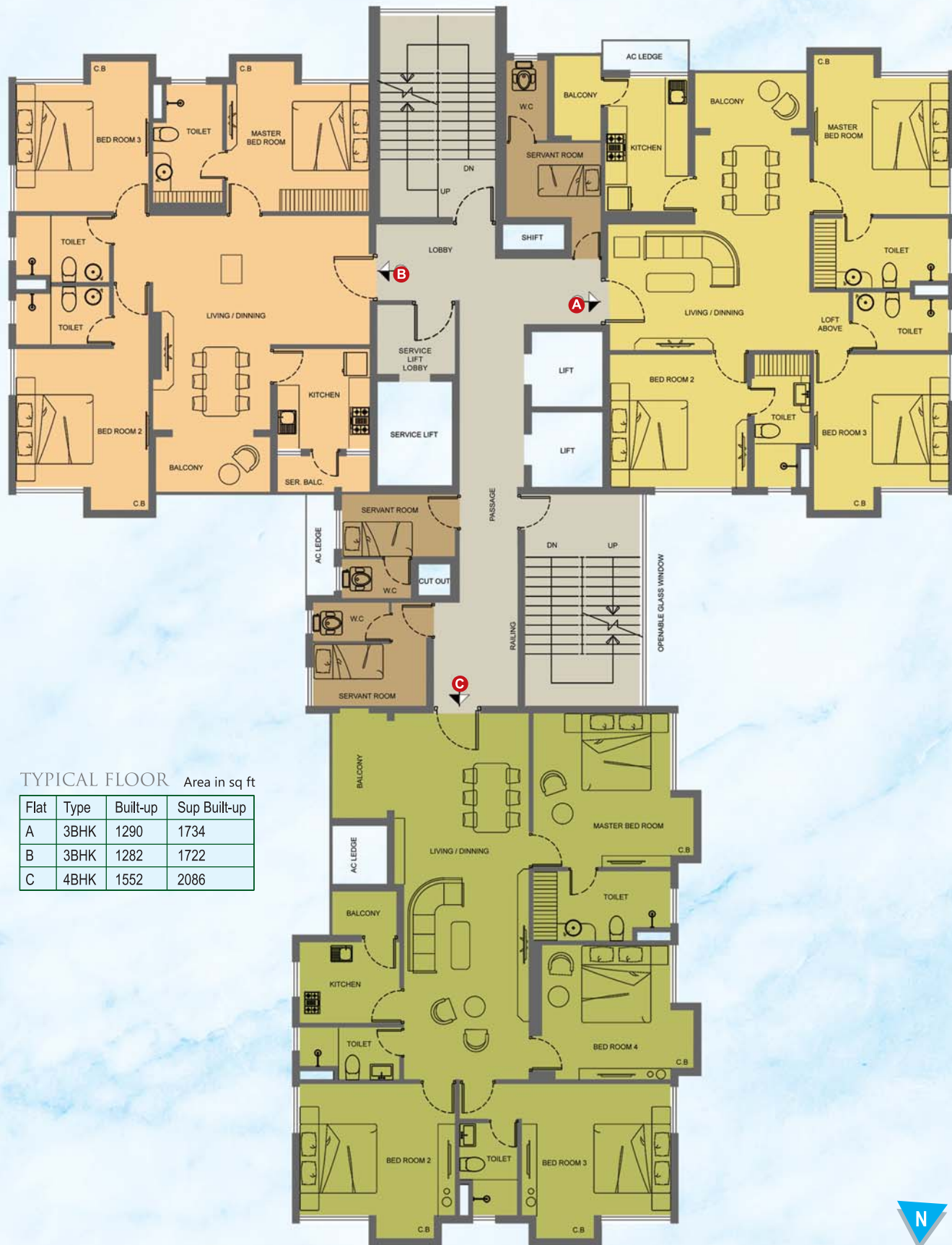
TYPICAL FLOOR Area in sq ft