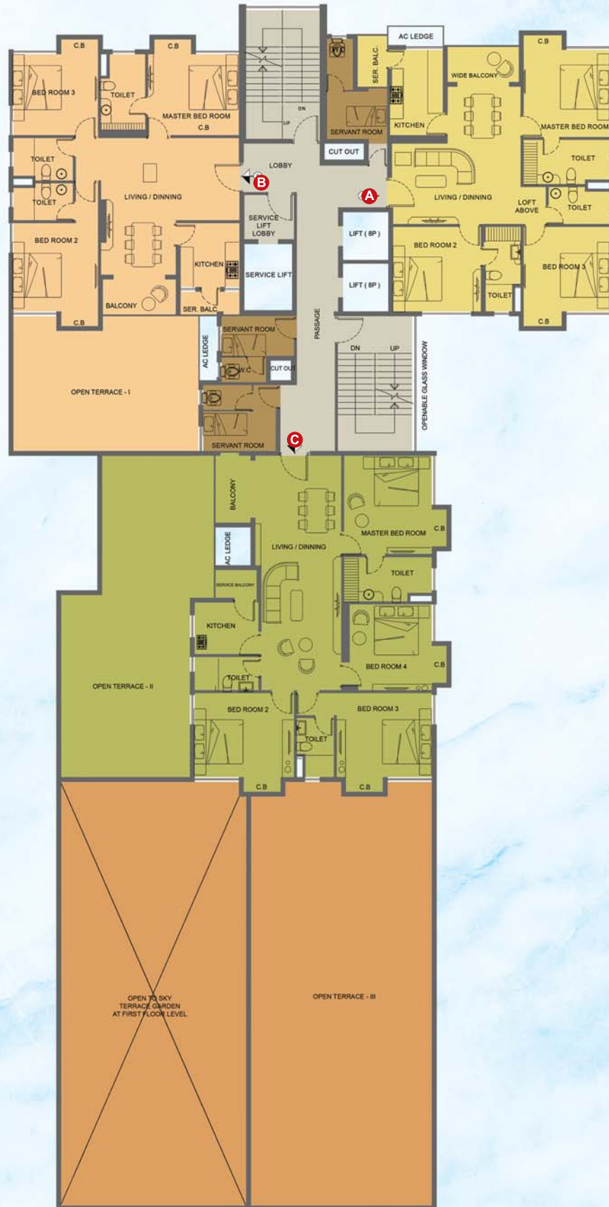
SECOND FLOOR Area in sq ft