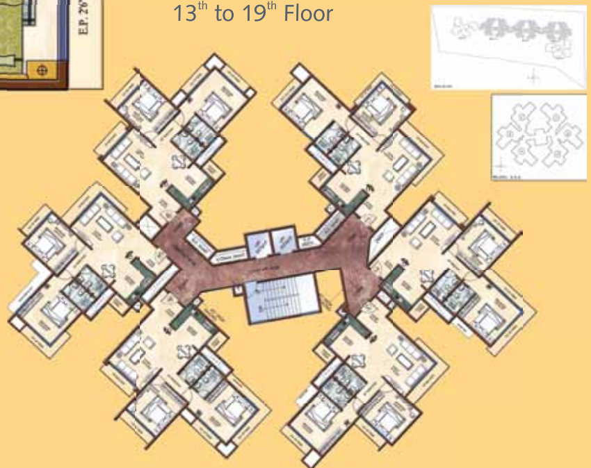
Typical Floor plan of 2 BHK - Tower 2, 3 & 4 1 st to 5 th Floor 13 th to 19 th Floor