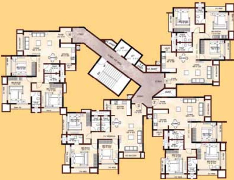
Typical Floor plan of 3 BHK - Tower 1&5