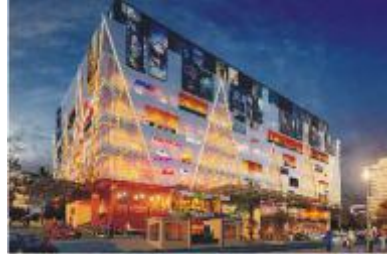
SMR VINAY METRO MALL & MULTIPLEX, MIYAPUR