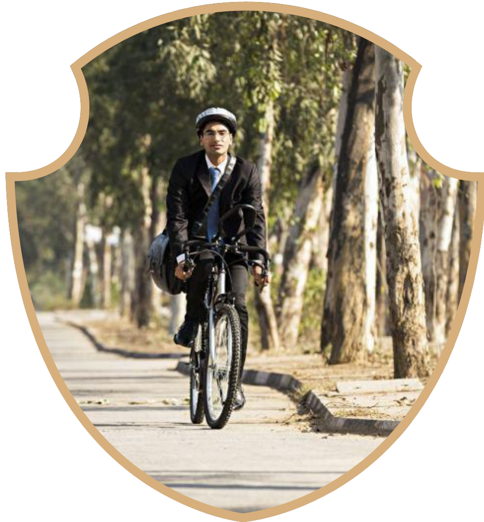
Tranquil as an Oasis. CENTRAL AS HAPPENING.