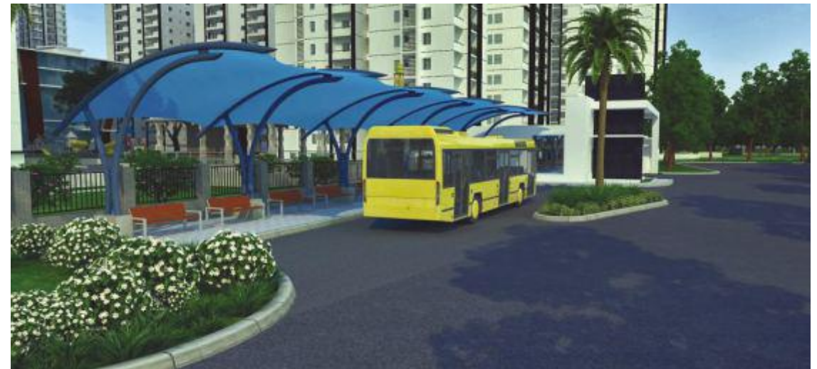
The Bus Bay in Premises