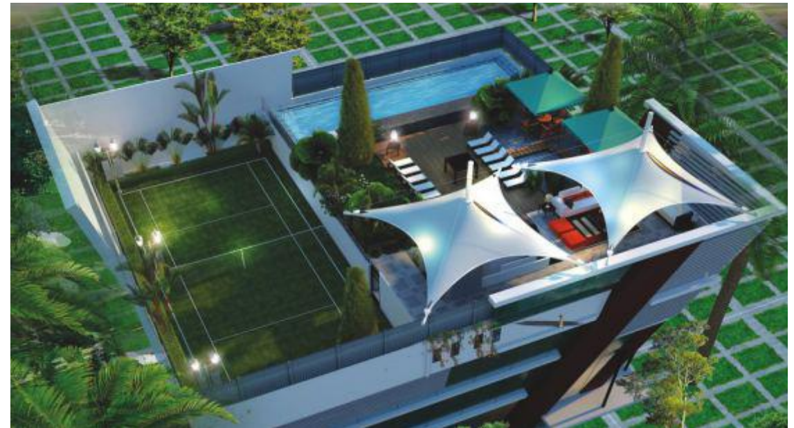
Rooftop Tennis Court