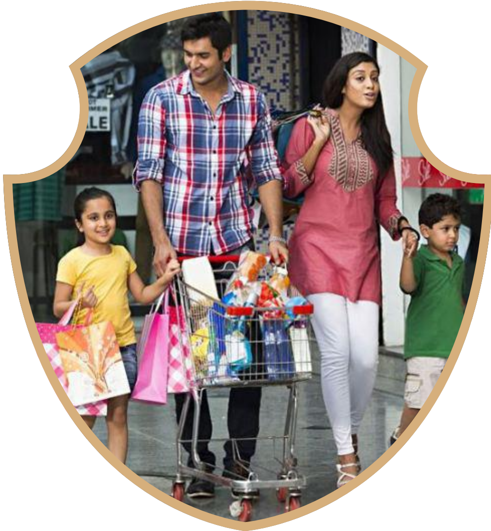
Walk to shop. FREEDOM UNVEILED.