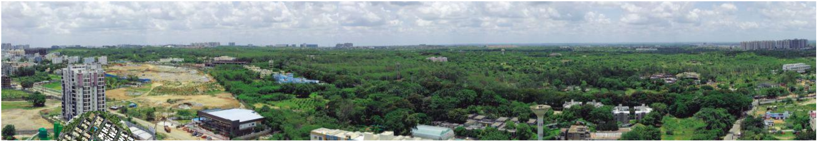
Over 4000 acres of green lung space, as viewed from SMR Vinay Iconia