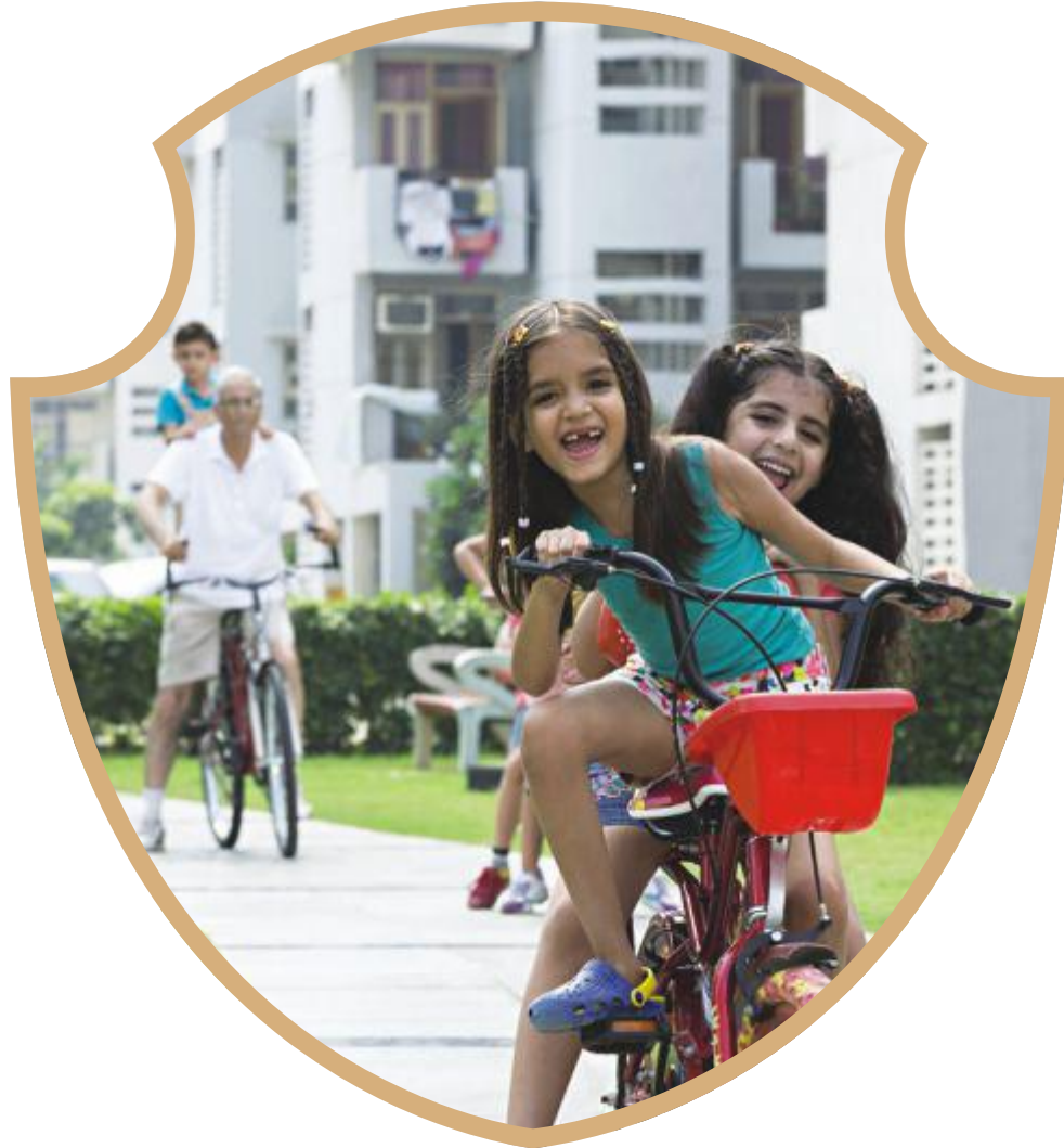
Secure, Serene. FULL OF LIFE.