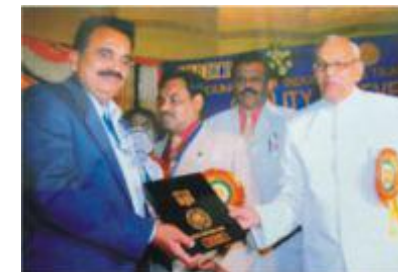
Receiving Quality Award for excellent & Innovative construction from H.E. Shri Rameshwar Thakur, Governor of A.P. in 2007