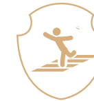
JOGGING & CYCLING TRACK