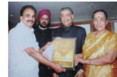
Receiving award from the Governor of Assam