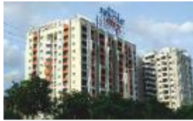
SMR VINAY CITY AT MIYAPUR