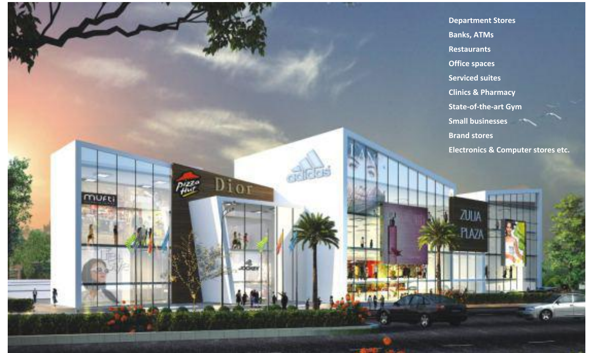
The Mall for Convenient Shopping

Zulia Plaza is one swanky shopping center attached to SMR Vinay Iconia for its resident's convenience. The plush building offers over one lakh Sft quality spaces for the shopping and business needs of Iconia residents and others. It is the perfect setting for residents of Iconia to have a business office/studio and enjoy a modern walk to work culture. Flexible and glittering floor spaces, top-of-the-line amenities, professional maintenance attract lakhs of footfalls enabling brisk business for entrepreneurs.