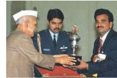
Receiving award for Best Architectural Performance from His Excellency Shri Shankar Dayal Sharma, President of India