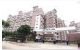
SMR VINAY HILANDS AT MIYAPUR