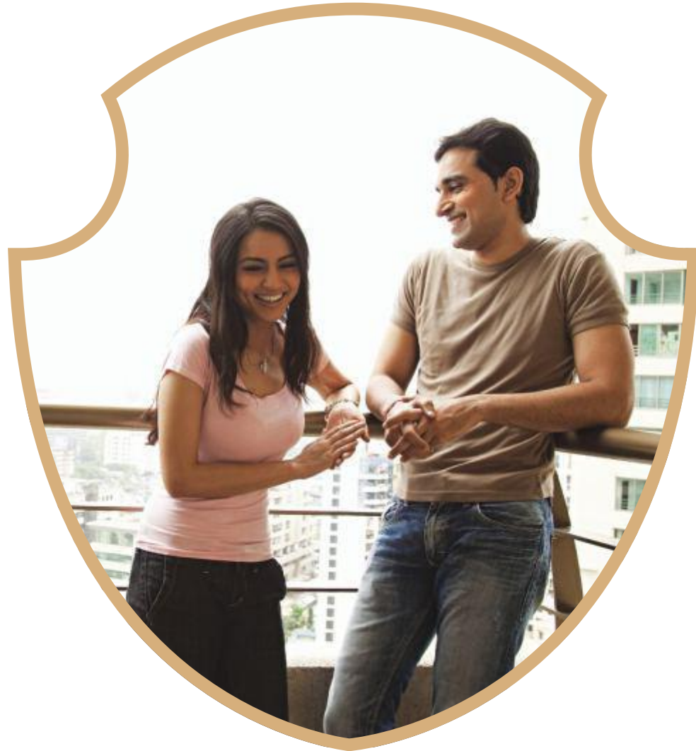
Elegant Interiors. WARM RELATIONSHIPS.