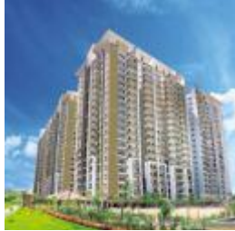
SMR VINAY FOUNTAINHEAD HYDERNAGAR