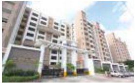
SMR VINAY SYMPHONY AT GACHIBOWLI