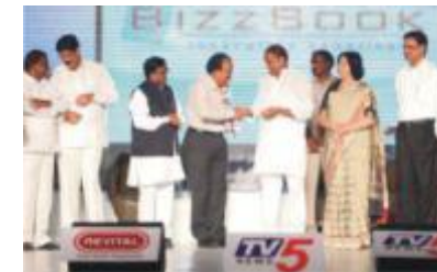
TV 5 Business Leader 2012 Award in Mid-Segment by the Chief Minister of Andhra Pradesh