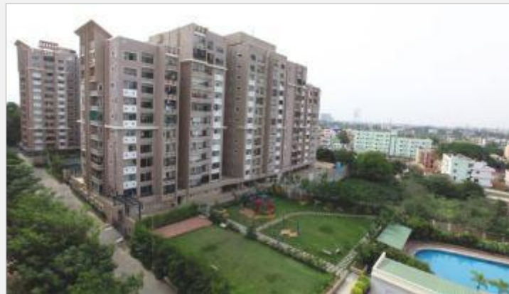
SMR VINAY GALAXY, HOODI JUNCTION, WHITEFIELD