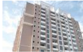
SMR VINAY SKY CITY AT RAMANTHAPUR