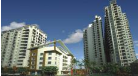
SMR VINAY HARMONY COUNTY APPA JUNCTION, BANDLAGUDA