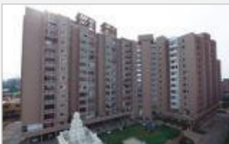
SMR VINAY ENDEAVOUR, HOODI JUNCTION