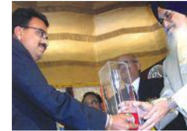
Receiving quality award for excellent & innovative construction from His Excellency Shri Surjeet Singh Barnala, Governor of A.P.