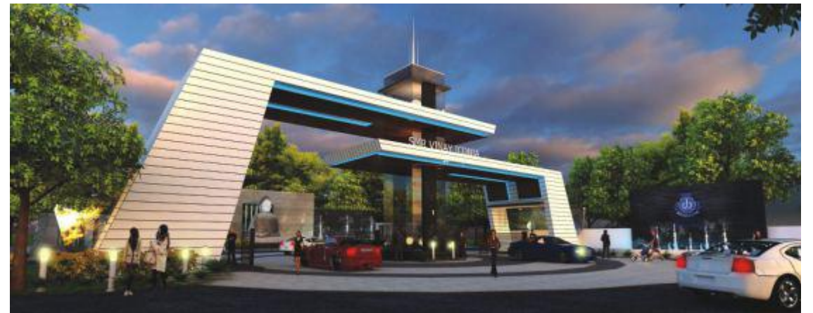
The Magnificent Entrance Gate

When 2009 to 2014 was a turbulent phase in Realty in Hyderabad, SMR emerged stronger on delivering customer aspirations. SMR is a mega company driven by long-term goals, values and resources. The company has mastered the art and science of construction and built to give more value to customers even during the toughest recession times.