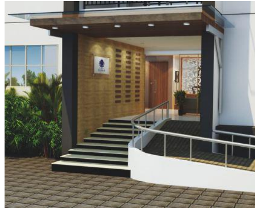
Friendly Design for the Physically Challenged

SMR Vinay Iconia has a stately element about it. Each tower invites the visitors into the glittering reception lobby in style. The design provides ramps for the physically challenged. The 24-hr security ensures your good times are uninterrupted. CC TVs are fixed in strategic places. Traffic Management System monitors the entry and exit of vehicles. Each tower is secured by Access Control.