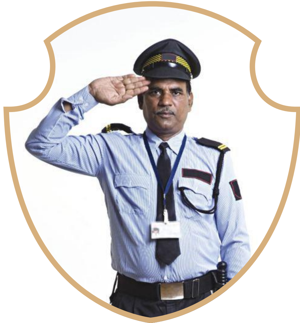
Graceful Spaces. FOOLPROOF SECURITY.