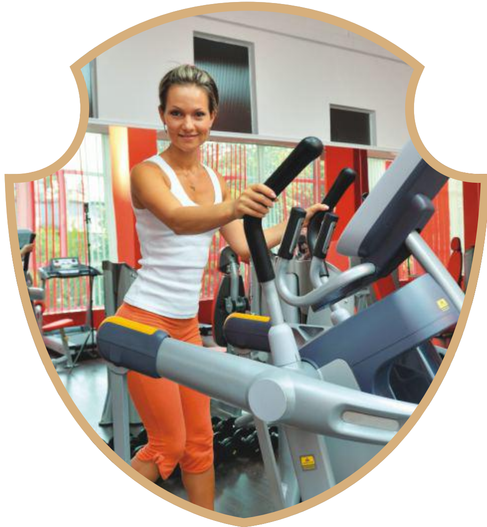
Freeze every joy. FRAME EVERY MOMENT.