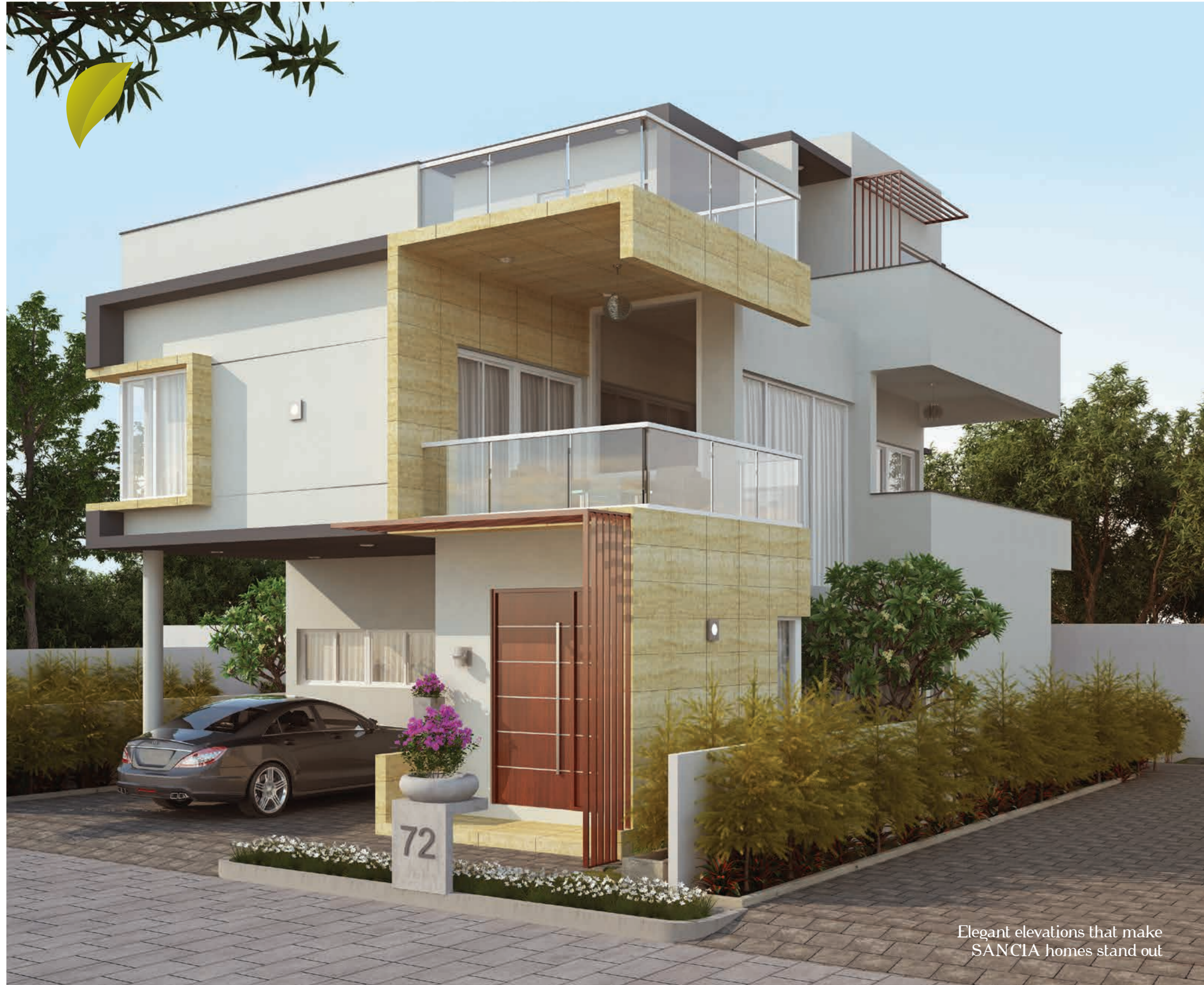
Elegant elevations that make SANCIA homes stand out