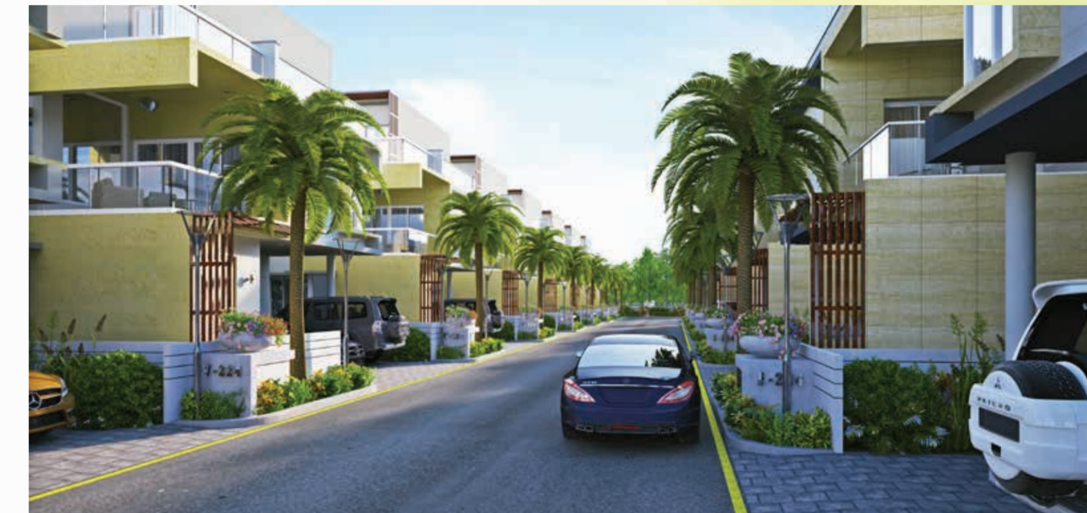
Wide and smooth centre drive

A theme that's made to make you feel at peace and feel more alive each day. We call the theme Serenity.