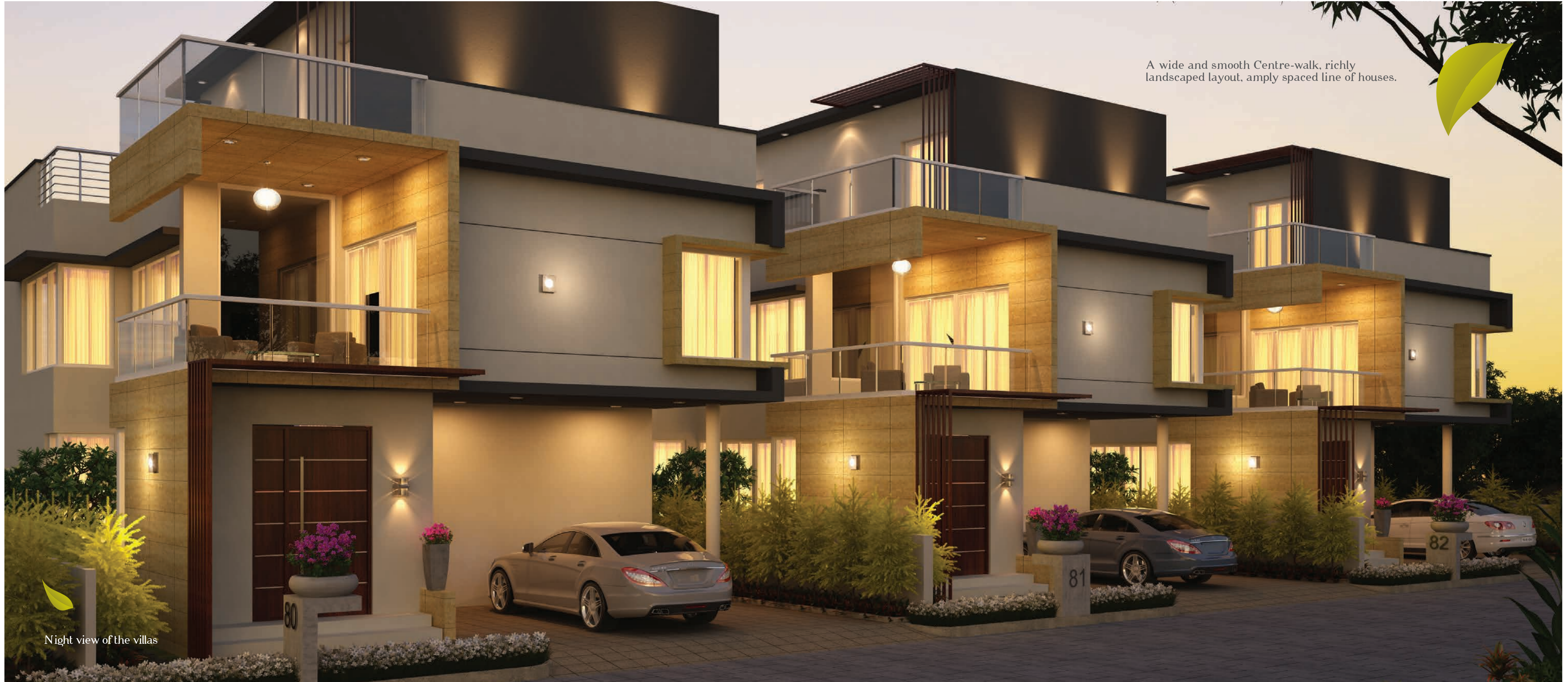
Night view of the villas

A wide and smooth Centre-walk, richly landscaped layout, amply spaced line of houses.