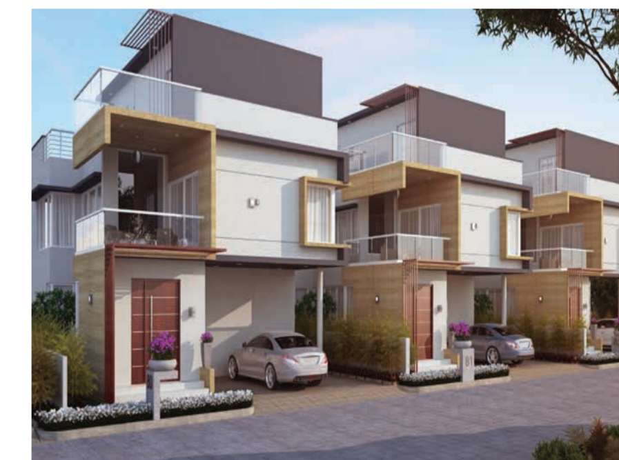
Street view in daytime

A project planned with much care and unfailing attention to the detail, to present you a living habitat decked up with modern amenities and dressed up in lavish greens. The spaciouly placed villas and the open world design of the premises come together in harmony to soothe your senses like nowhere else. After all, it's home.