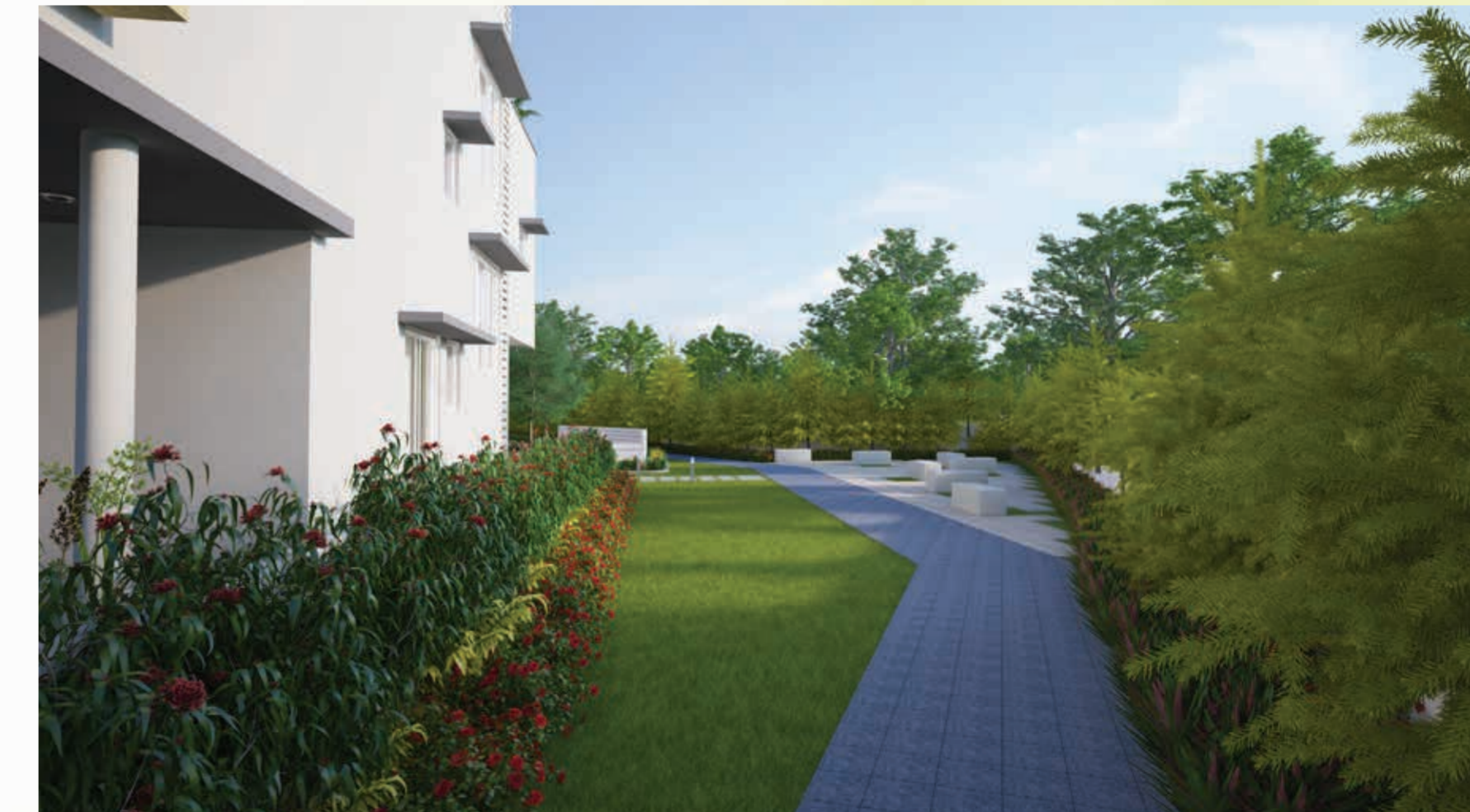
Jogging track with foliage fencing

Detailed planning goes hand in hand with wide open space at Sancia, and you feel the comfort and creativity at every step.