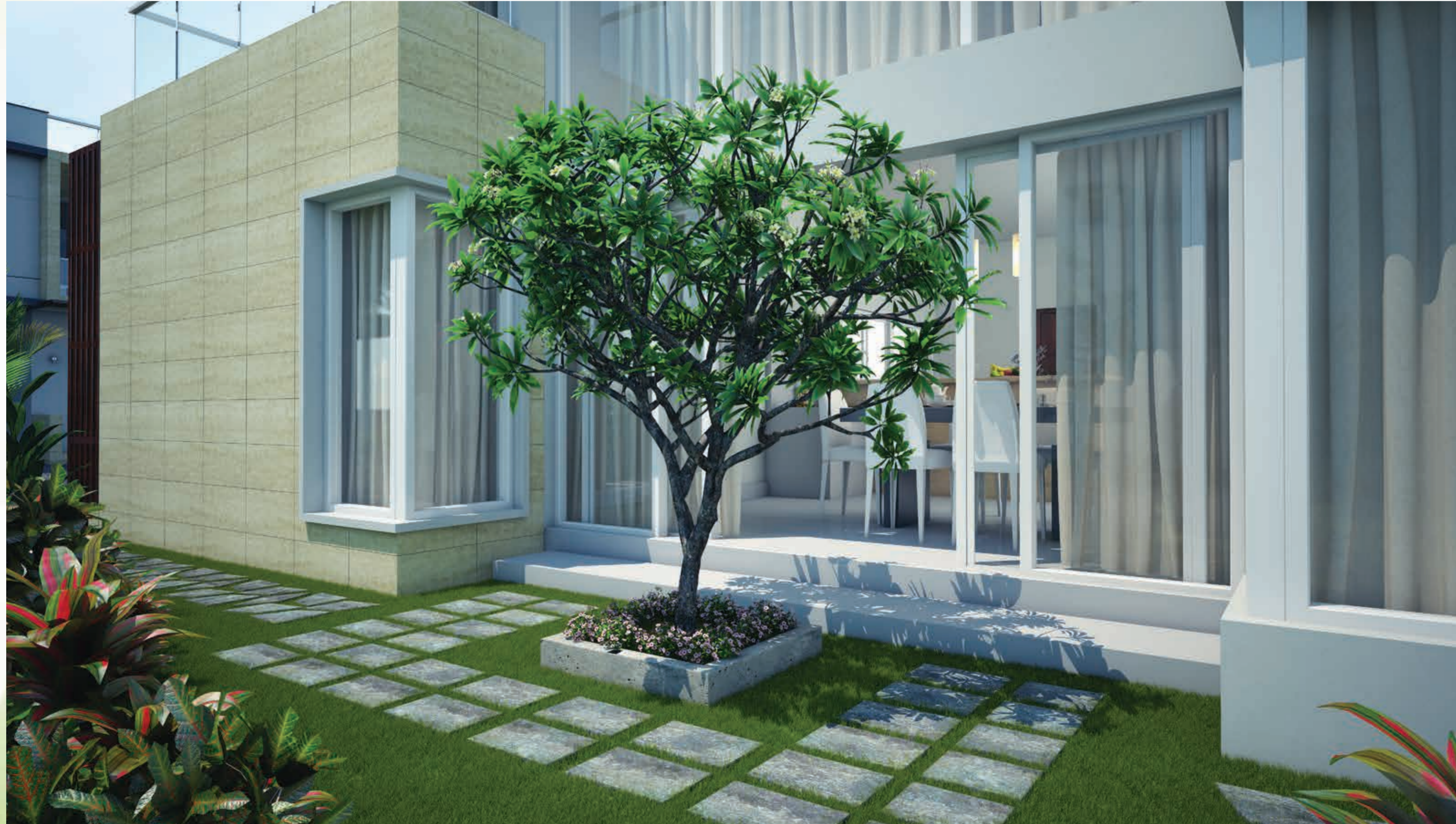
Double height dining area with adjacent landscaped courtyard