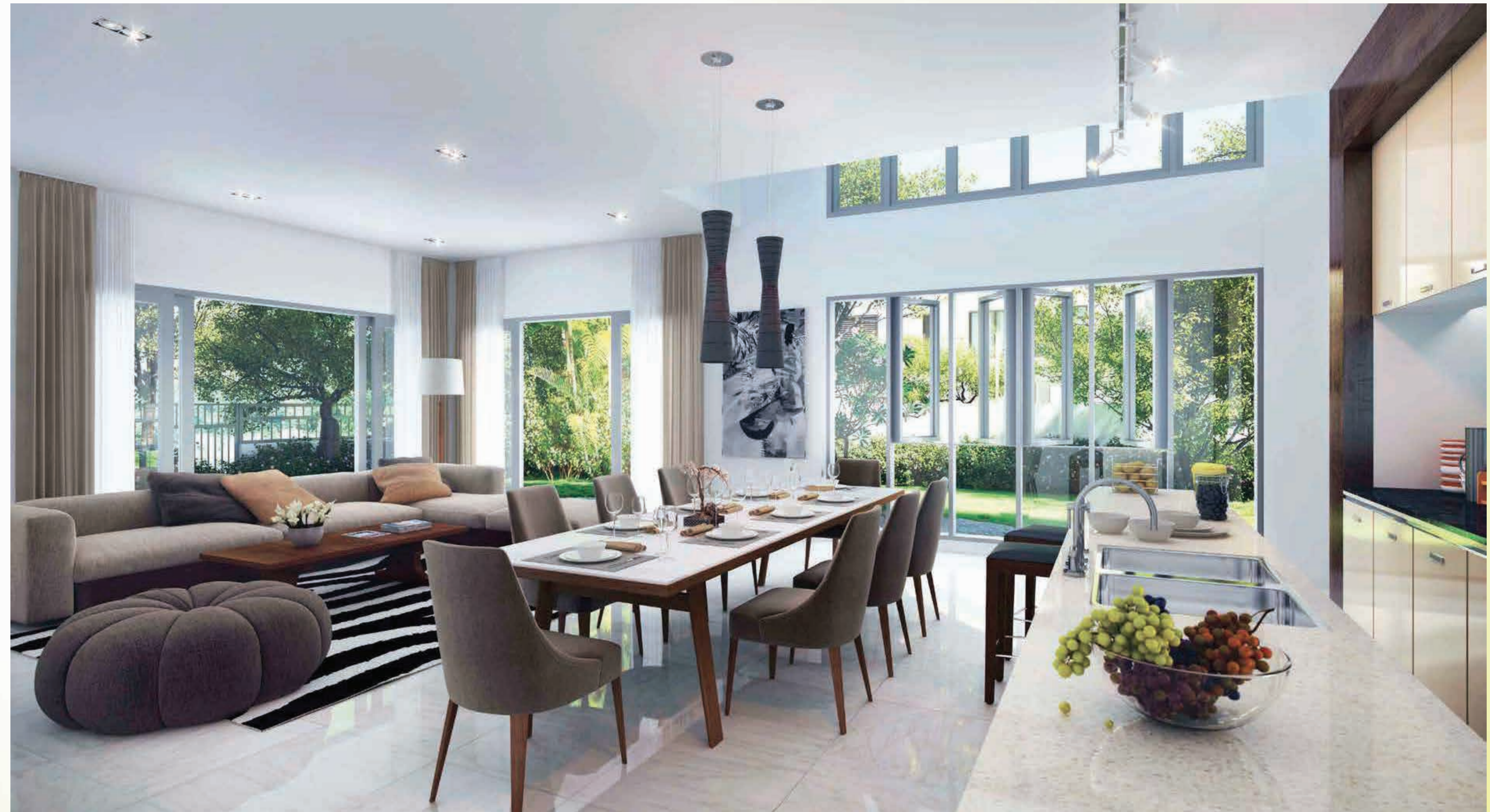
Plush and roomy double-height interiors

After all, your time at home is the best part of your whole day, where you spend quality time with your family. It should feel the best.