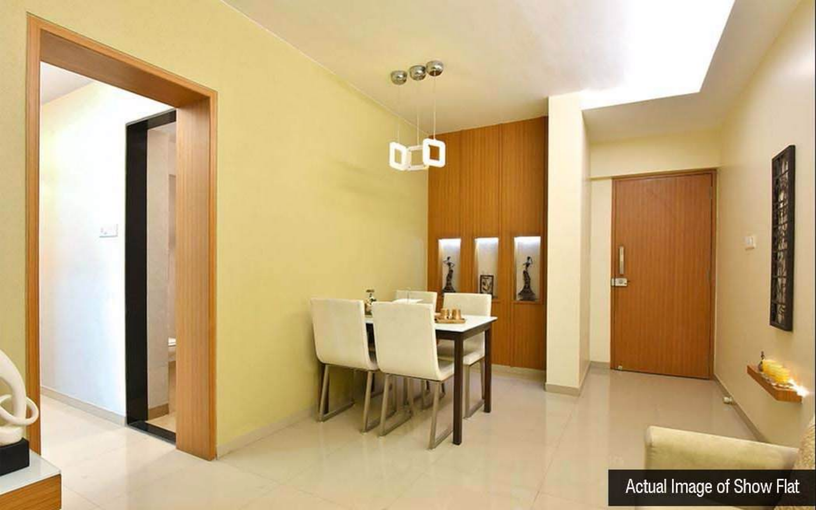
Actual Image of Show Flat