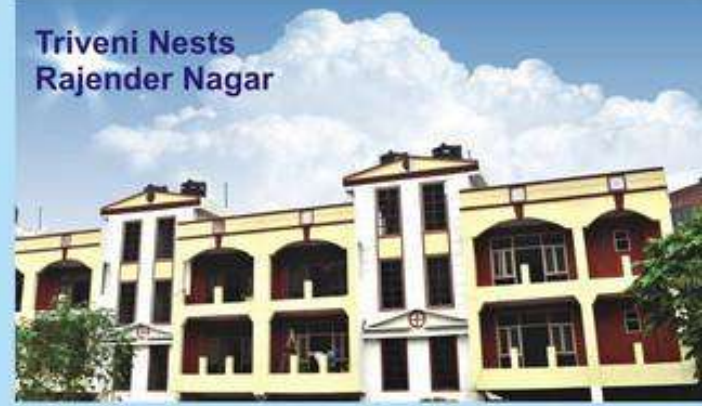
Triveni Nests Rajender Nagar