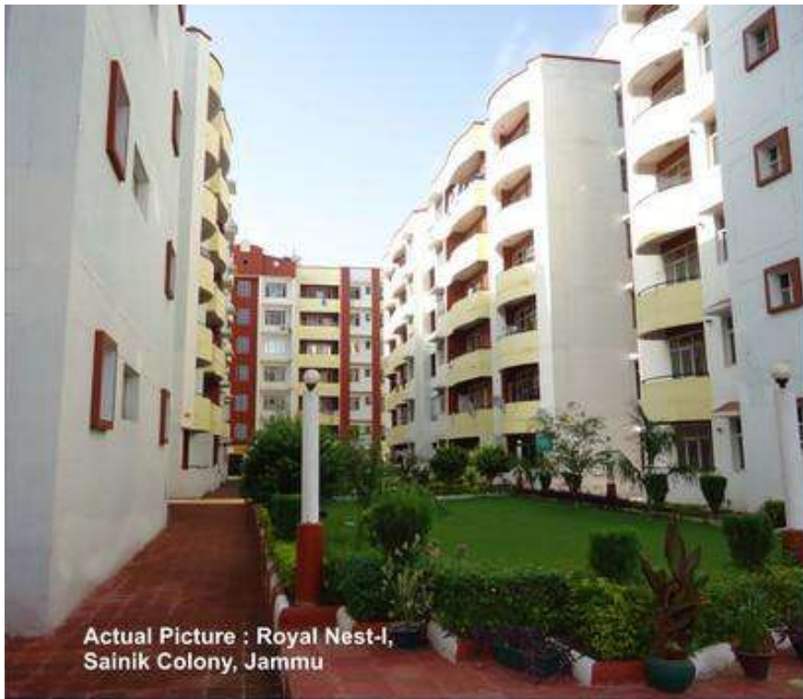
Actual Picture : Royal Nest-I, Sainik Colony, Jammu