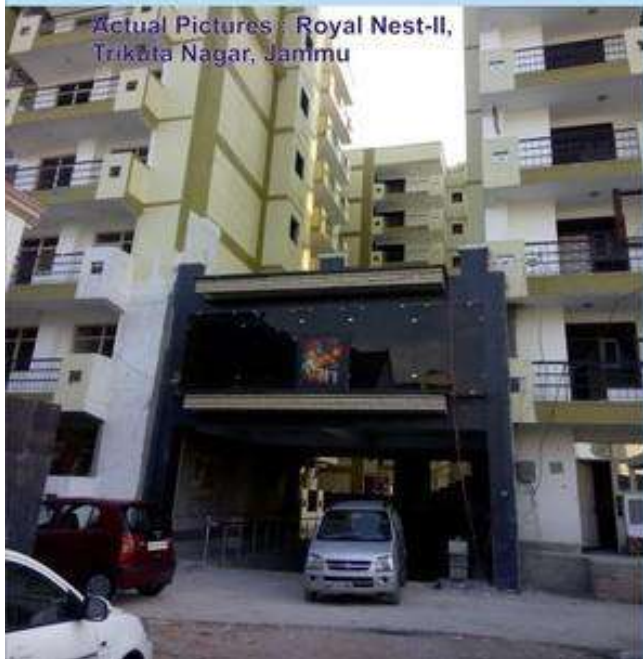
Actual Pictures : Royal Nest-II, Triketa Nagar, Jammu