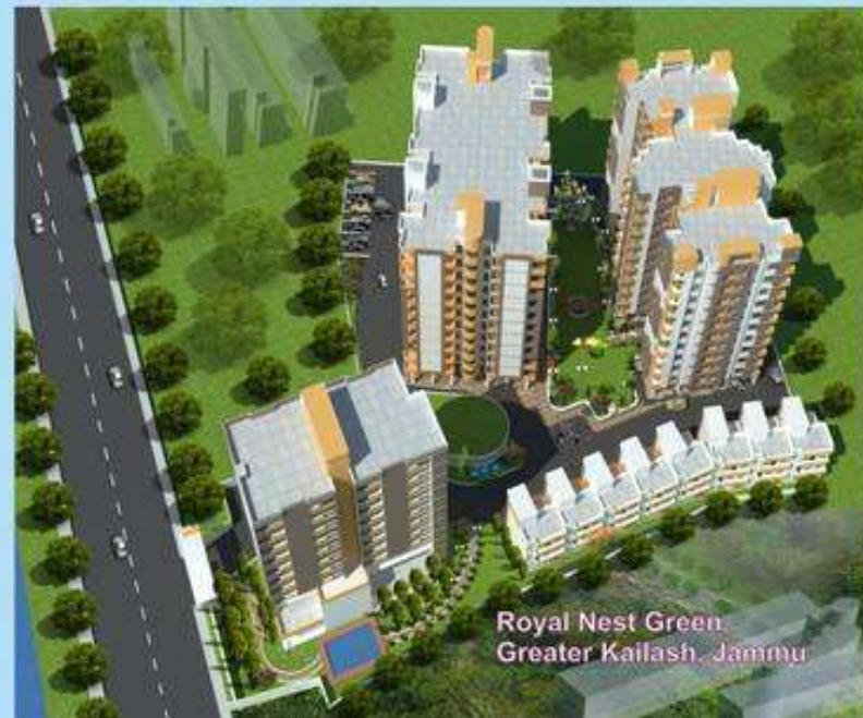
Royal Nest Green, Greater Kailash, Jammu