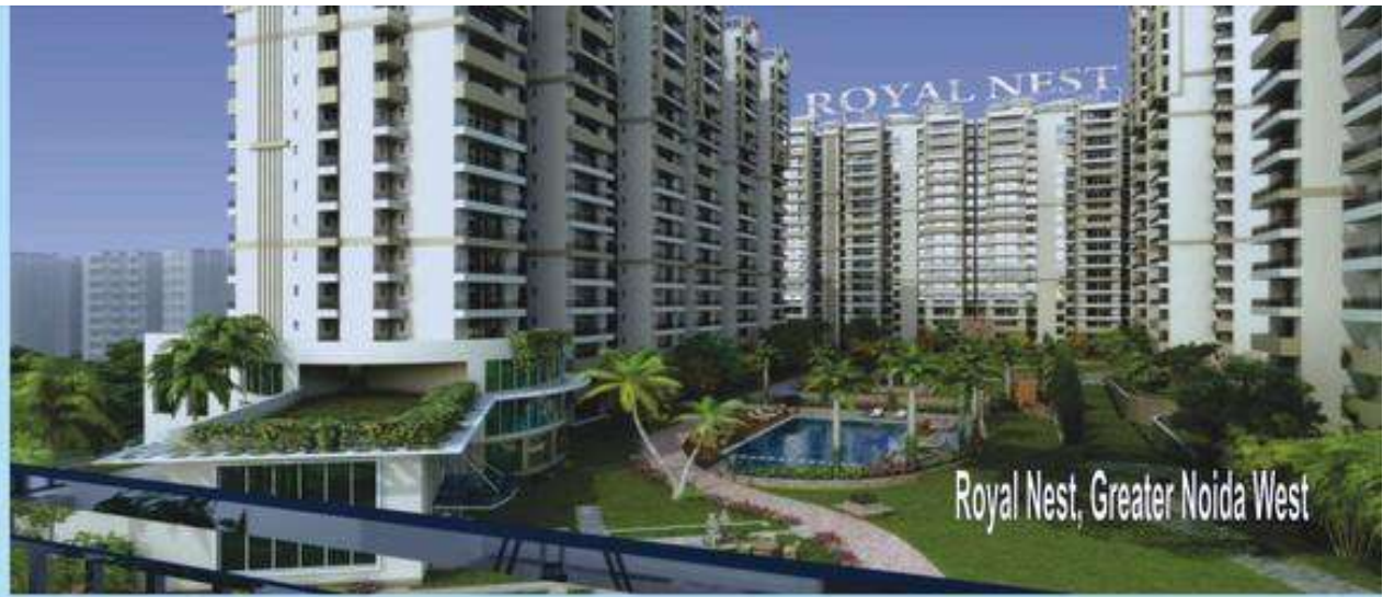
Royal Nest, Greater Noida West