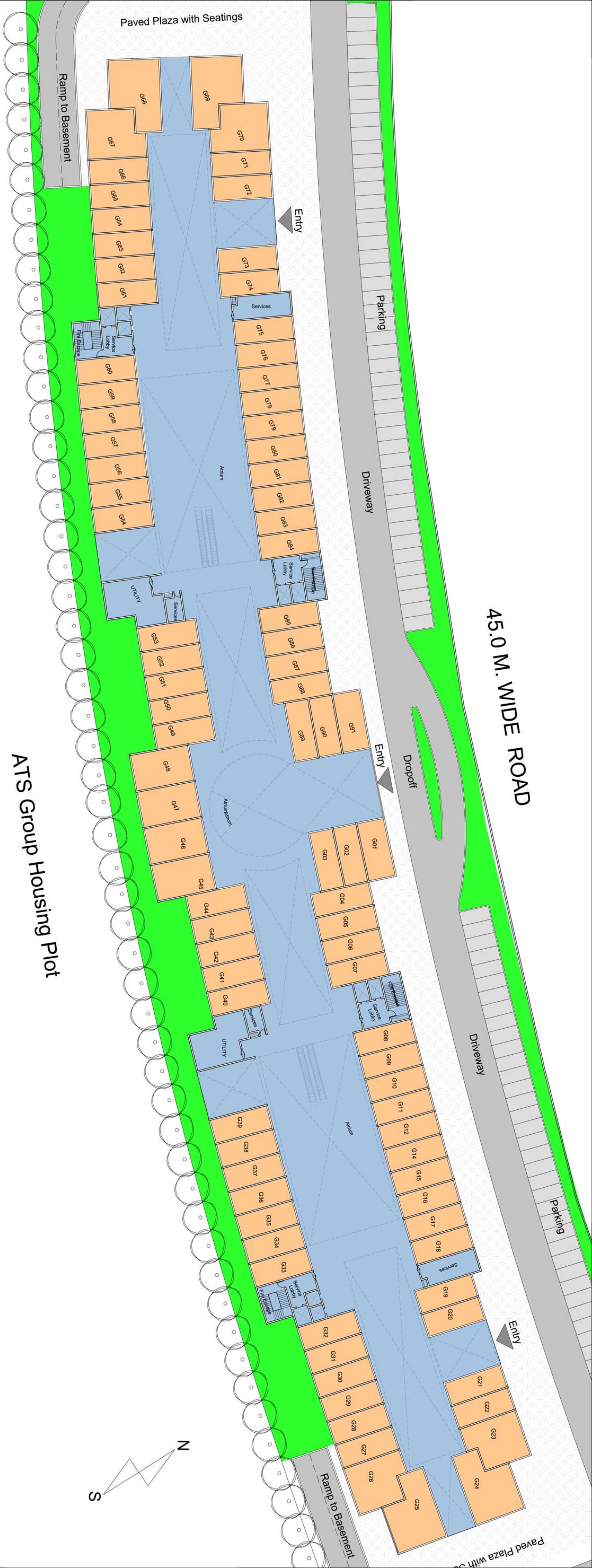
ATS Group Housing Plot