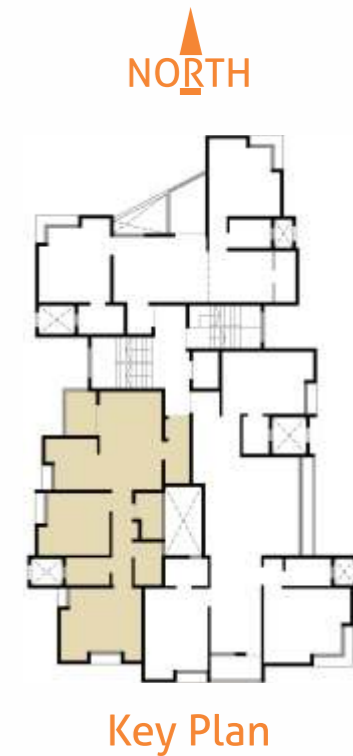
6th Floor Plan