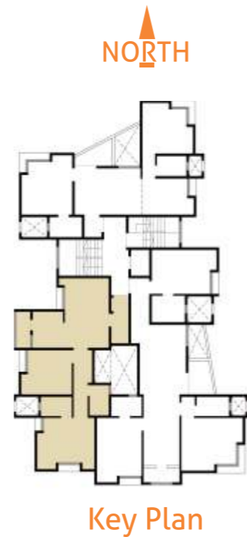
5th Floor Plan