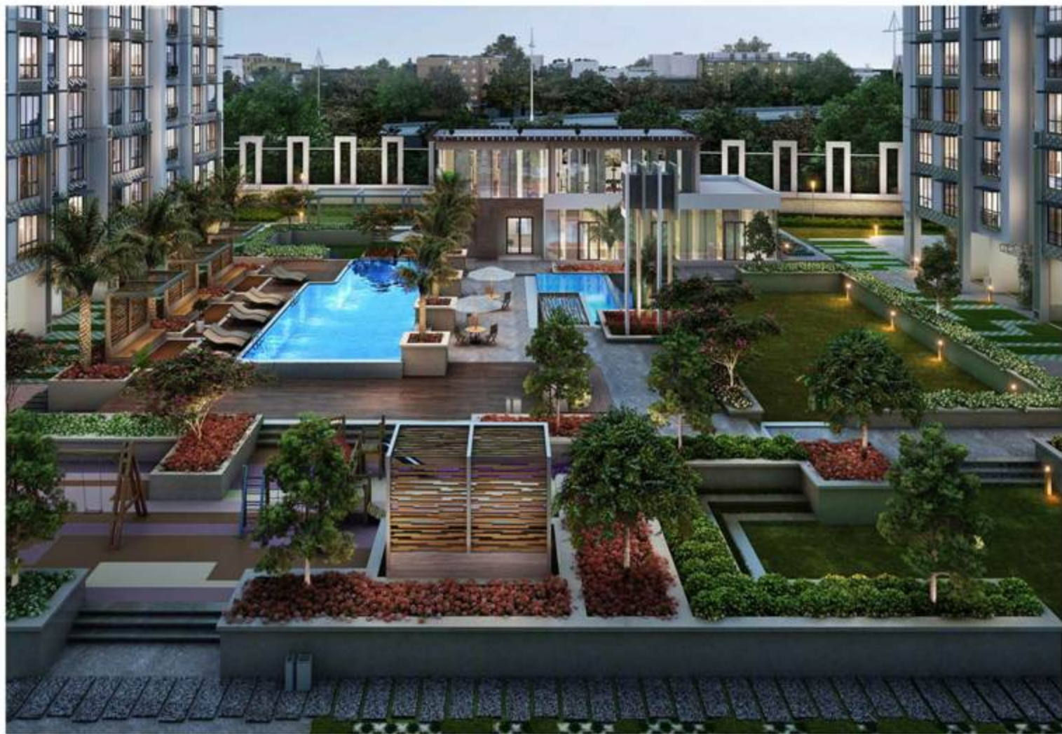
One acre of open green space