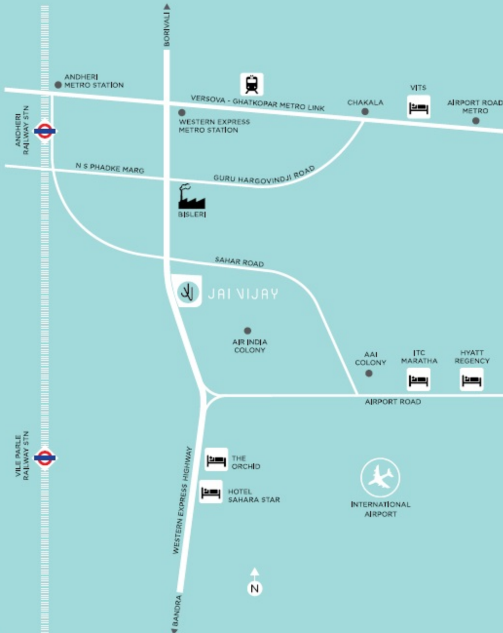
Location Map: Jai Vijay, Vile Parle East