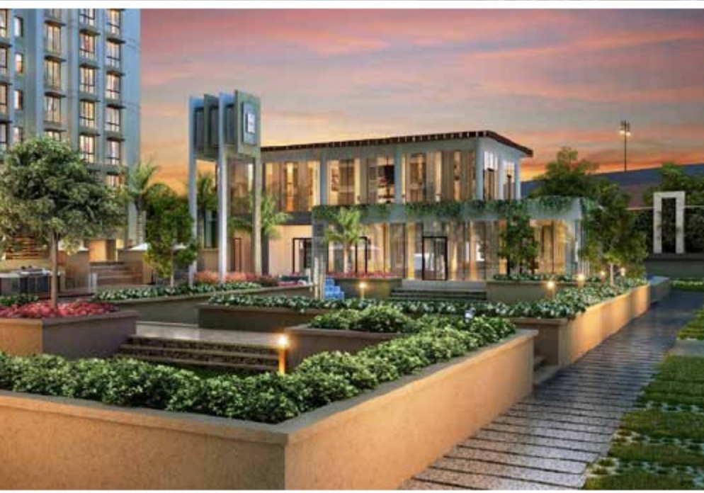
Clubhouse and multi purpose activity zone