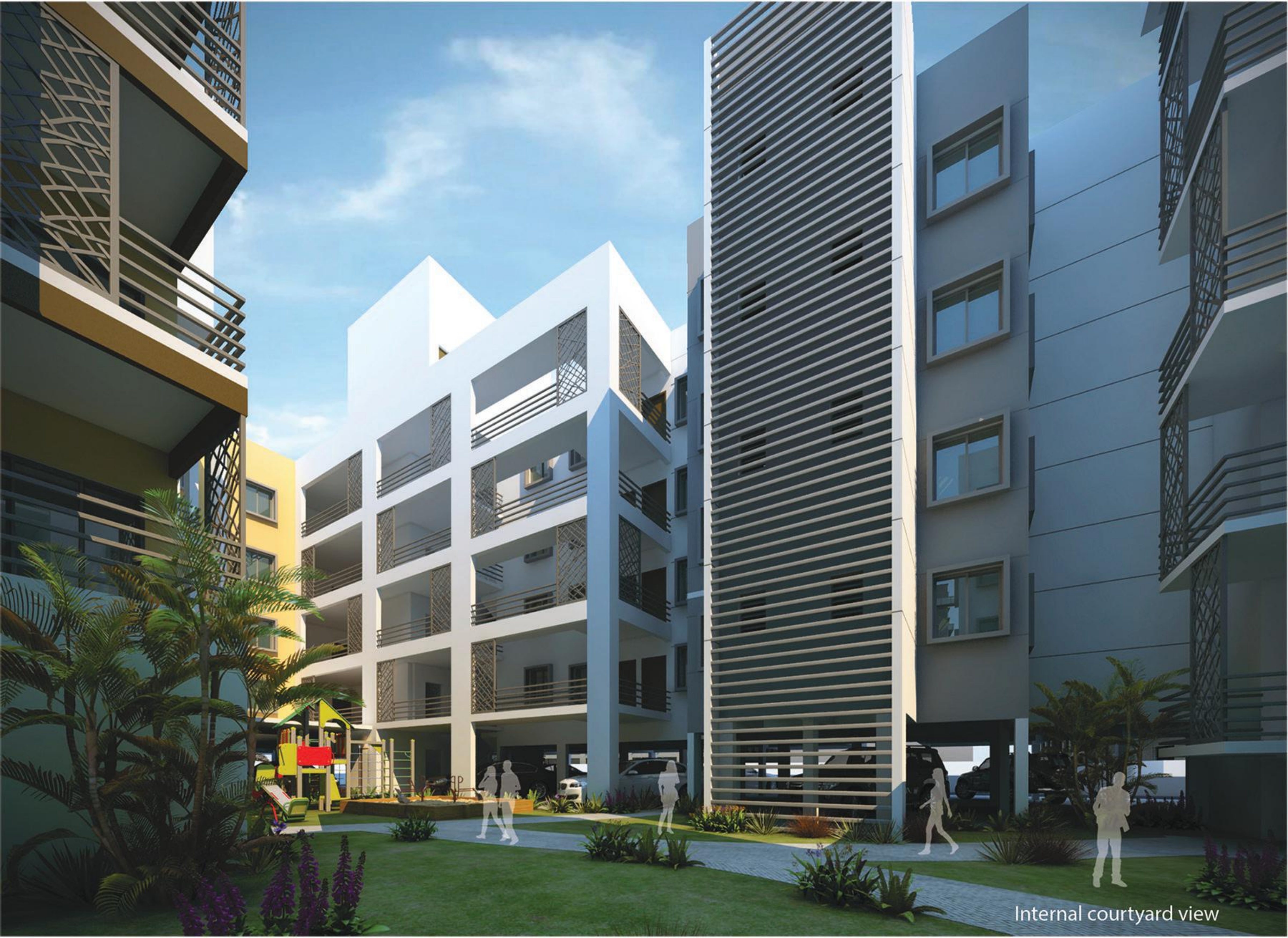
Internal courtyard view