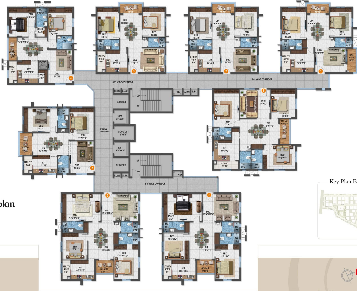
Typical floor plan Block - F