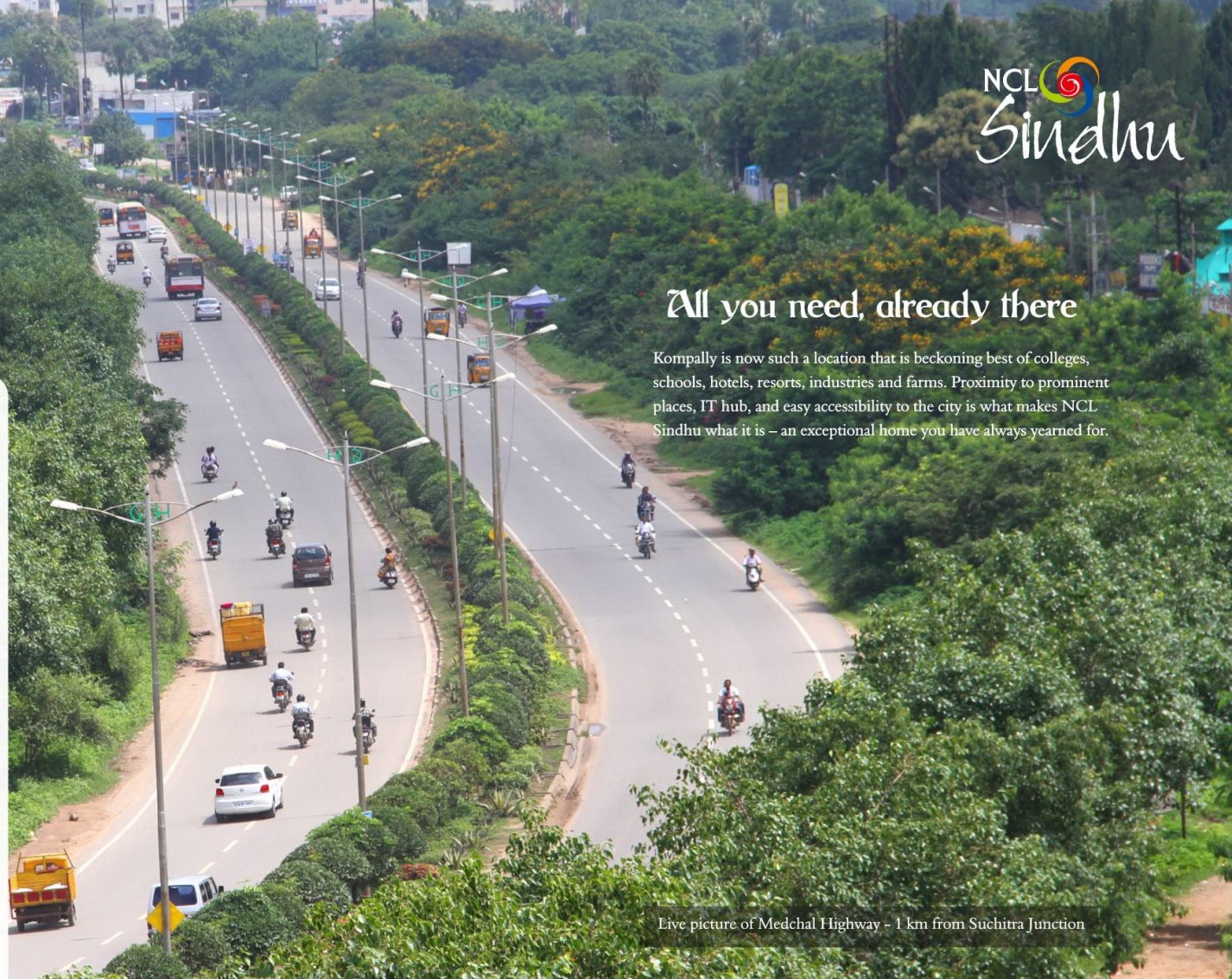
Live picture of Medchal Highway - 1 km from Suchitra Junction

Kompally is now such a location that is beckoning best of colleges, schools, hotels, resorts, industries and farms. Proximity to prominent places, IT hub, and easy accessibility to the city is what makes NCL Sindhu what it is – an exceptional home you have always yearned for.