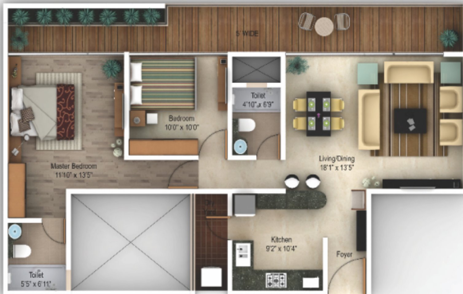
2 BHK Floor Plan SALEABLE: 1451 sq. ft.