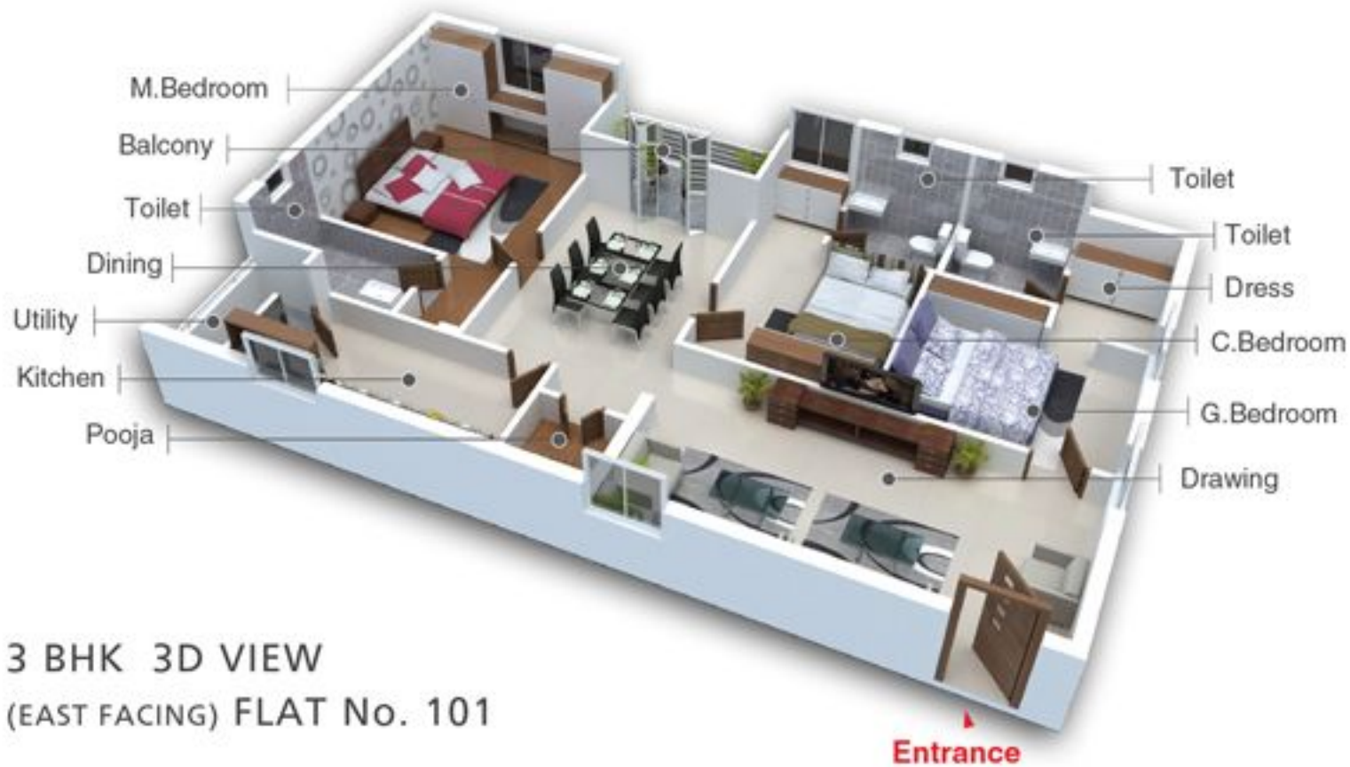
3 BHK 3D VIEW (EAST FACING) FLAT No. 101