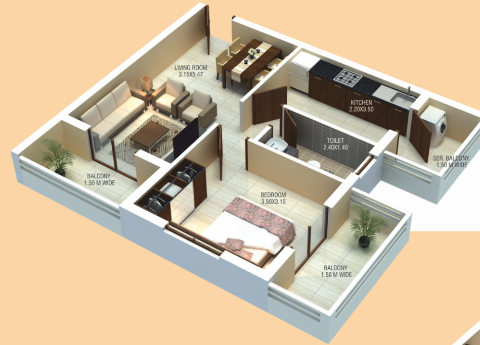
TYPICAL ONE BEDROOM APARTMENT LAYOUT (70.55 Sq.Mtrs.)