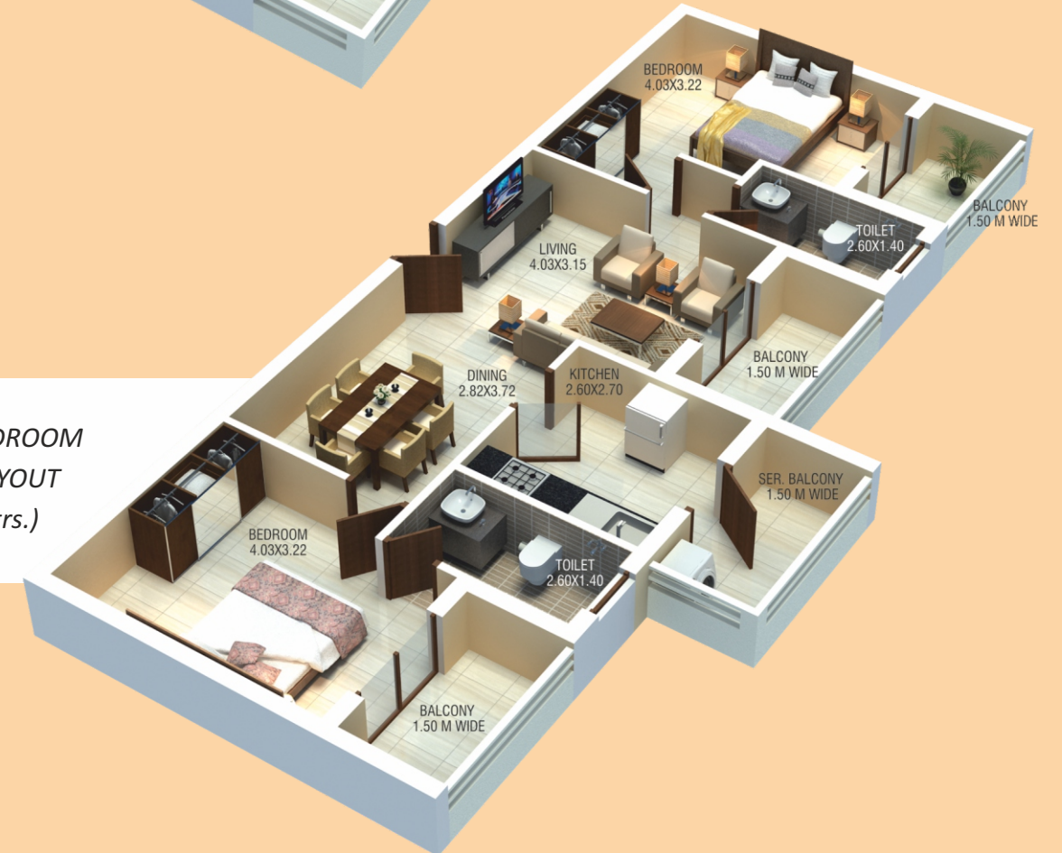
TYPICAL TWO BEDROOM APARTMENT LAYOUT (107.44 Sq.Mtrs.)