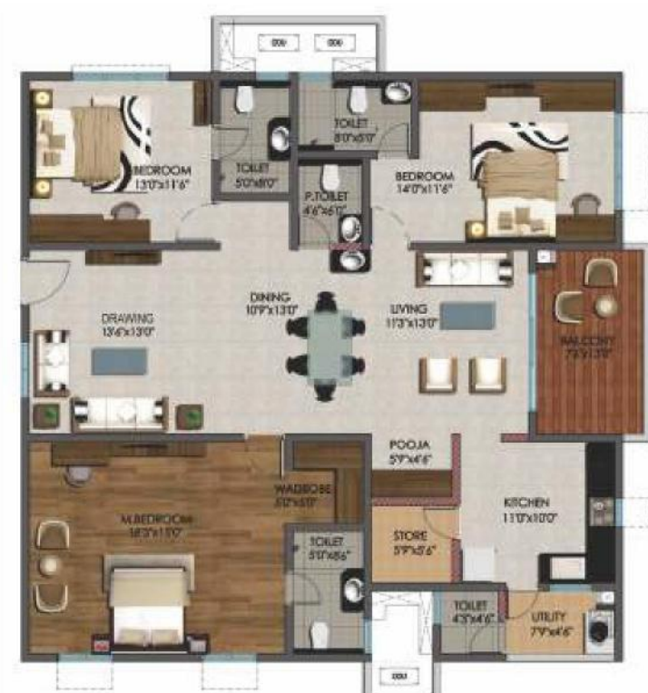
3 BHK, 2220 sft - West