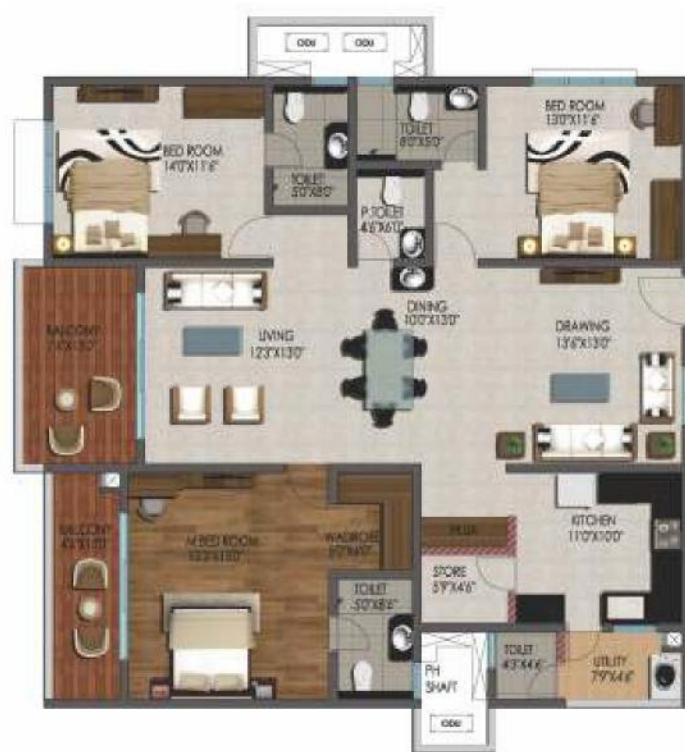
3 BHK, 2230 sft - East