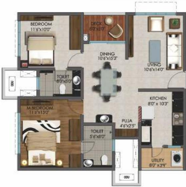
2 BHK, 1160 sft - East