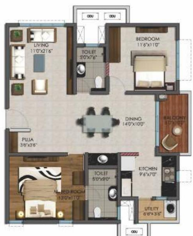
2 BHK, 1250 sft - West