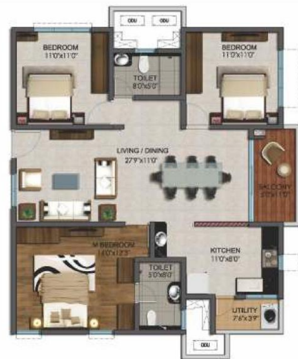
3 BHK, 1450 sft - West