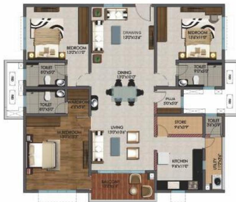
3 BHK, 2000 sft - North