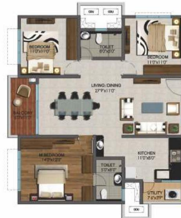
3 BHK, 1450 sft - East