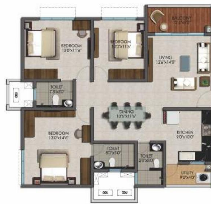
3 BHK, 1550 sft - East