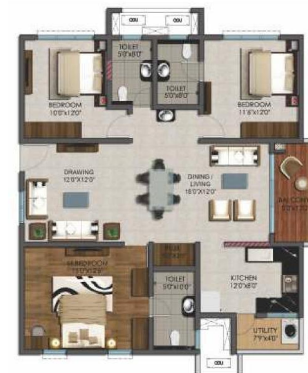
3 BHK, 1650 sft - West