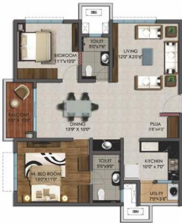
2 BHK, 1250 sft - East