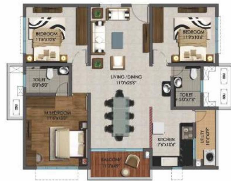
3 BHK, 1400 sft - North