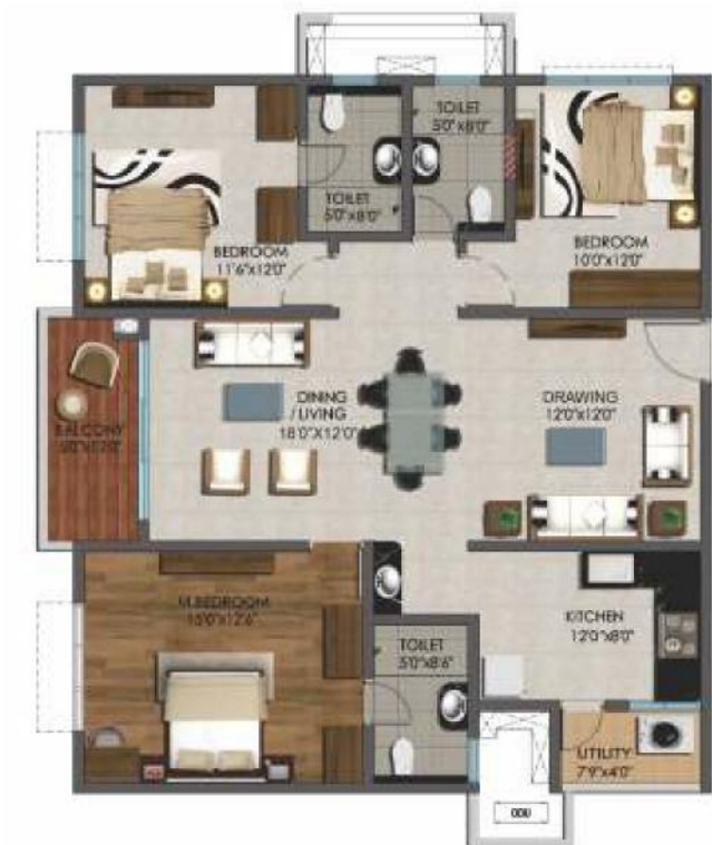
3 BHK, 1650 sft - East