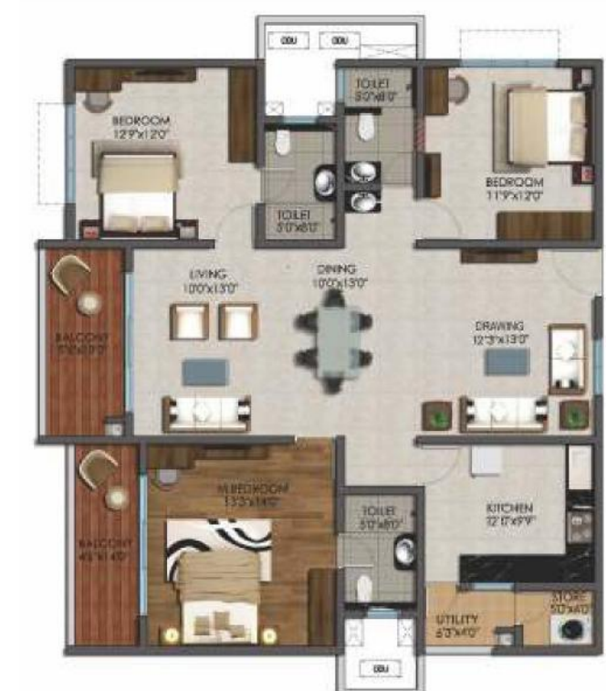
3 BHK, 1900 sft - East