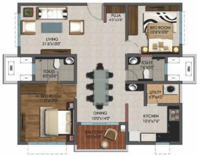
2 BHK, 1210 sft - North