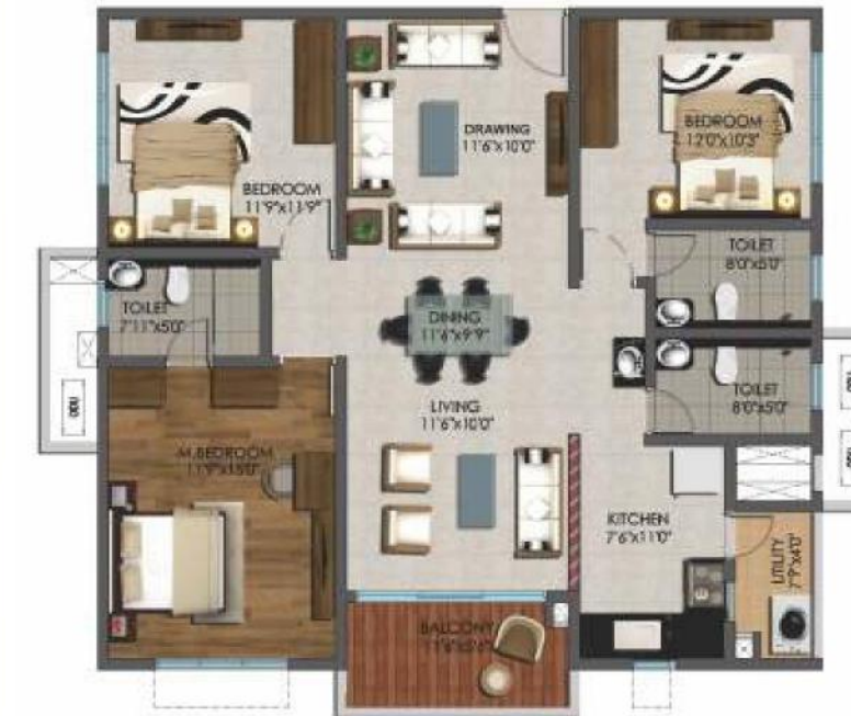
3 BHK, 1600 sft - North