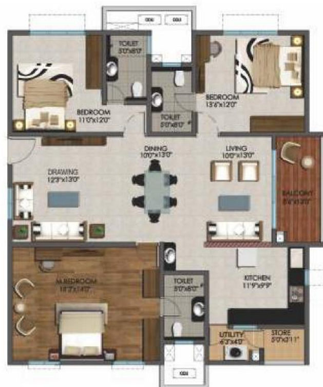
3 BHK, 1900 sft - West