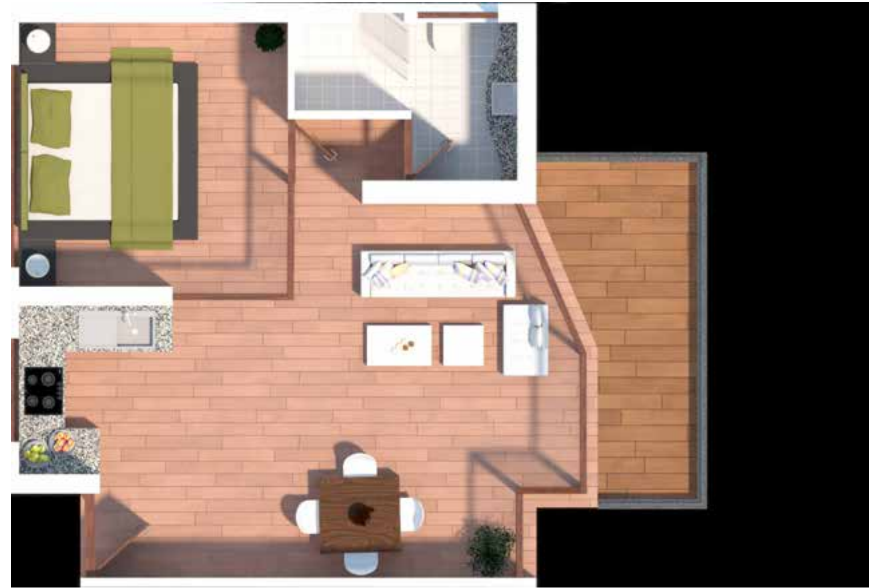
FIRST & SECOND FLOOR