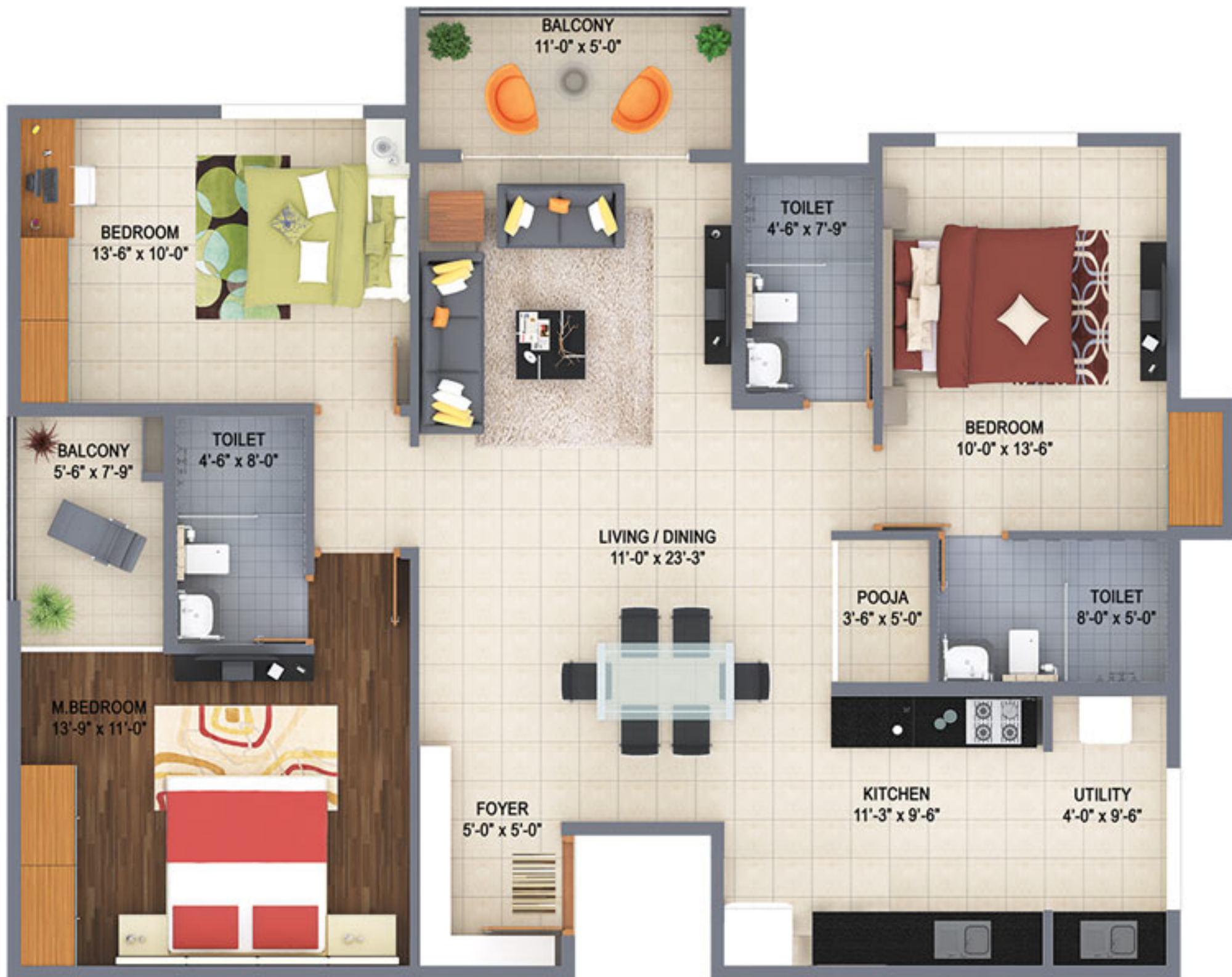
FLAT-4 FLOOR PLAN