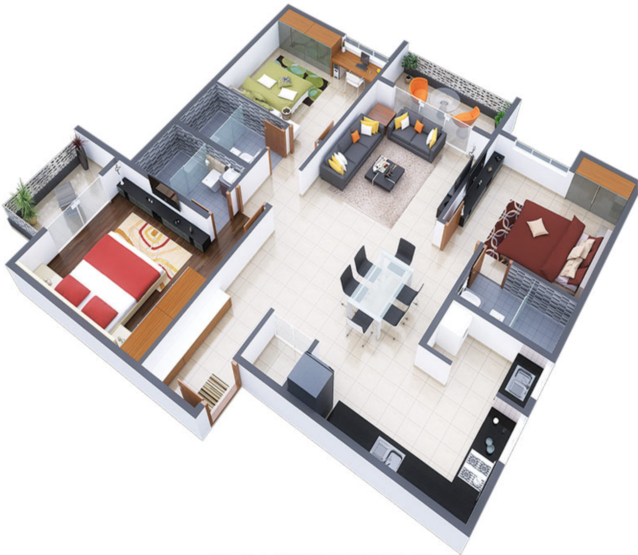
FLAT-1 ISOMETRIC VIEW