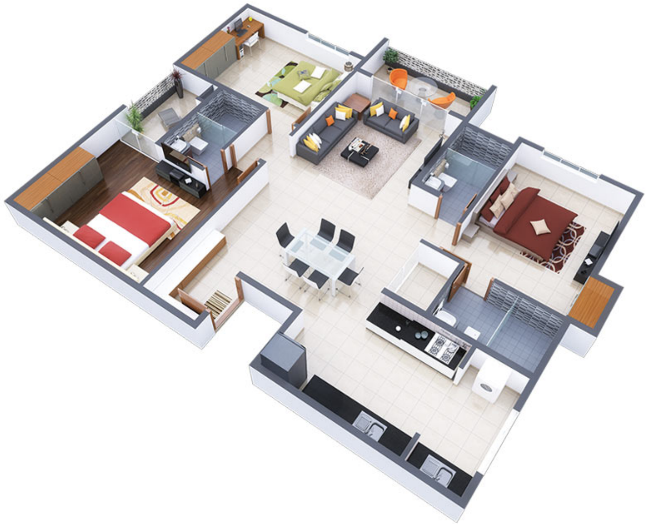
FLAT-4 ISOMETRIC VIEW