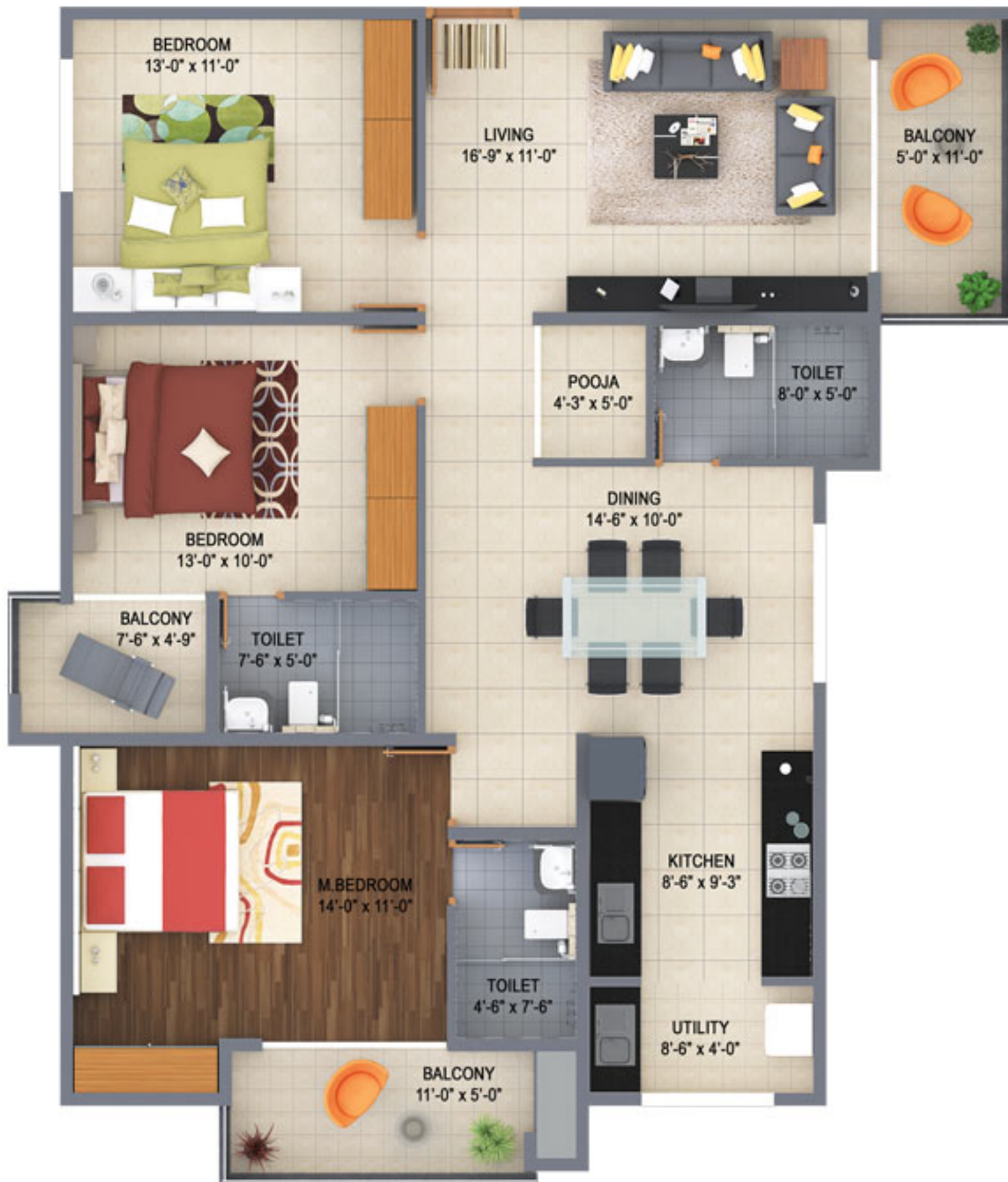
FLAT-5 GROUND FLOOR PLAN