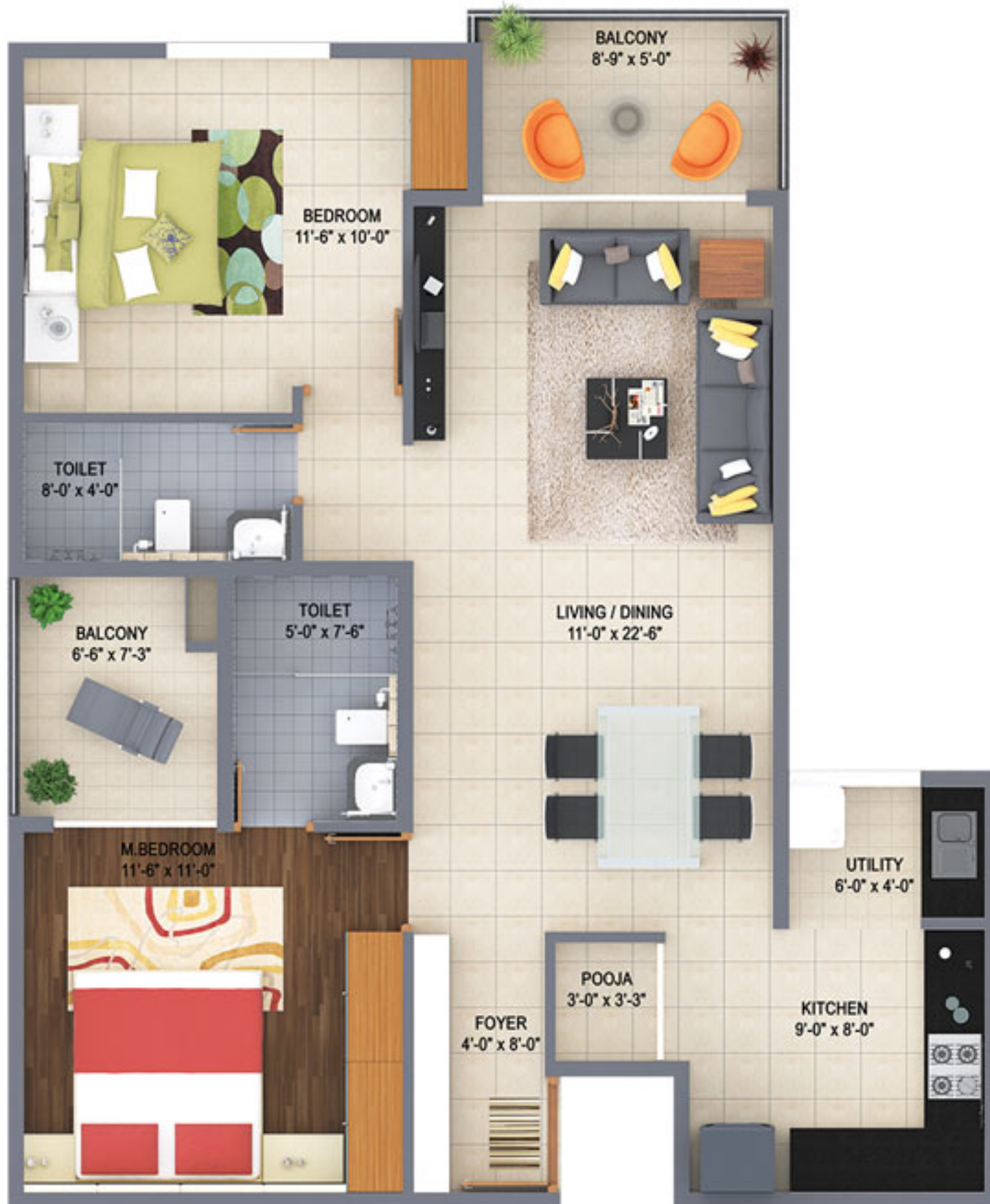
FLAT-3 FLOOR PLAN