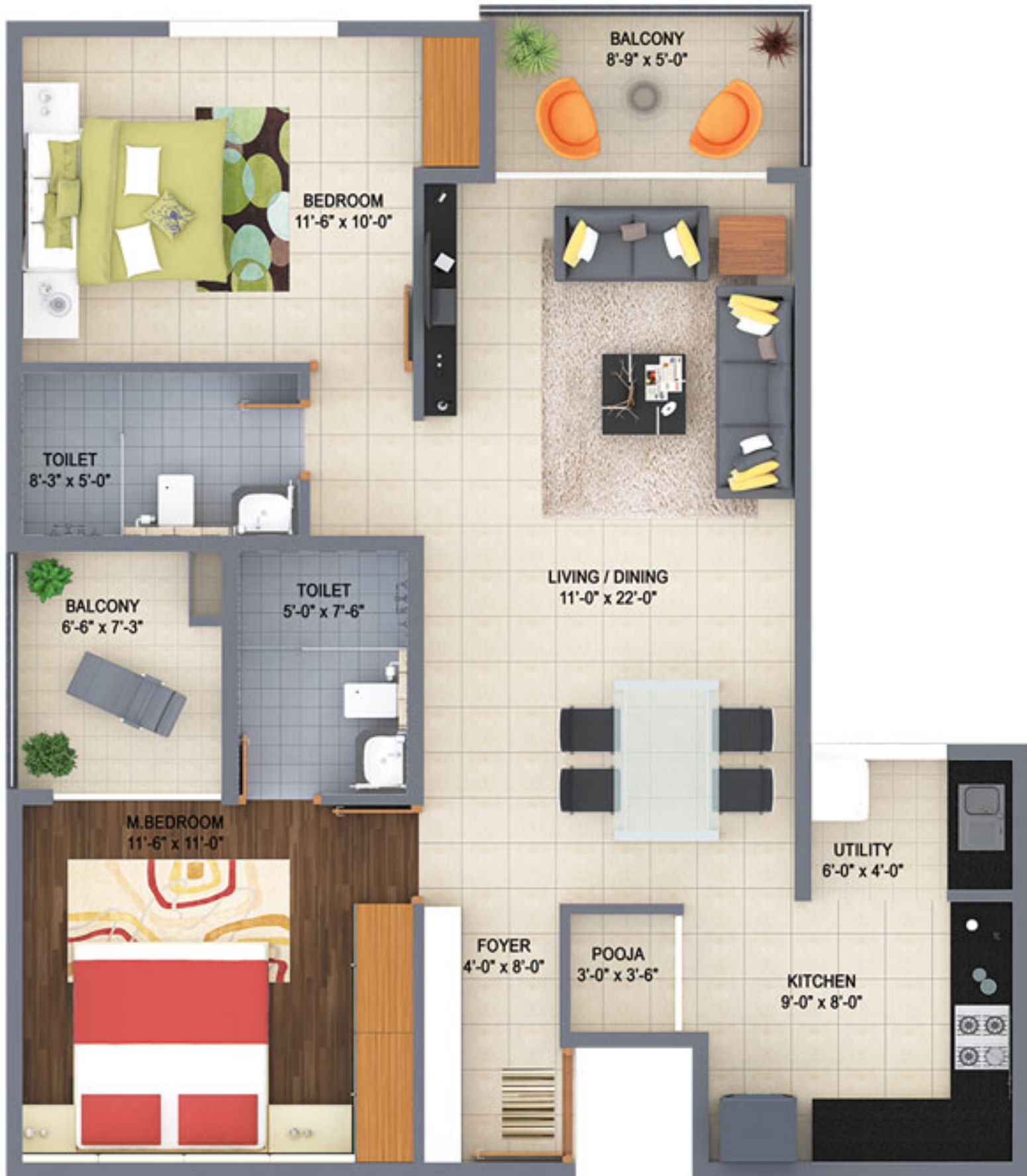
FLAT-2 FLOOR PLAN