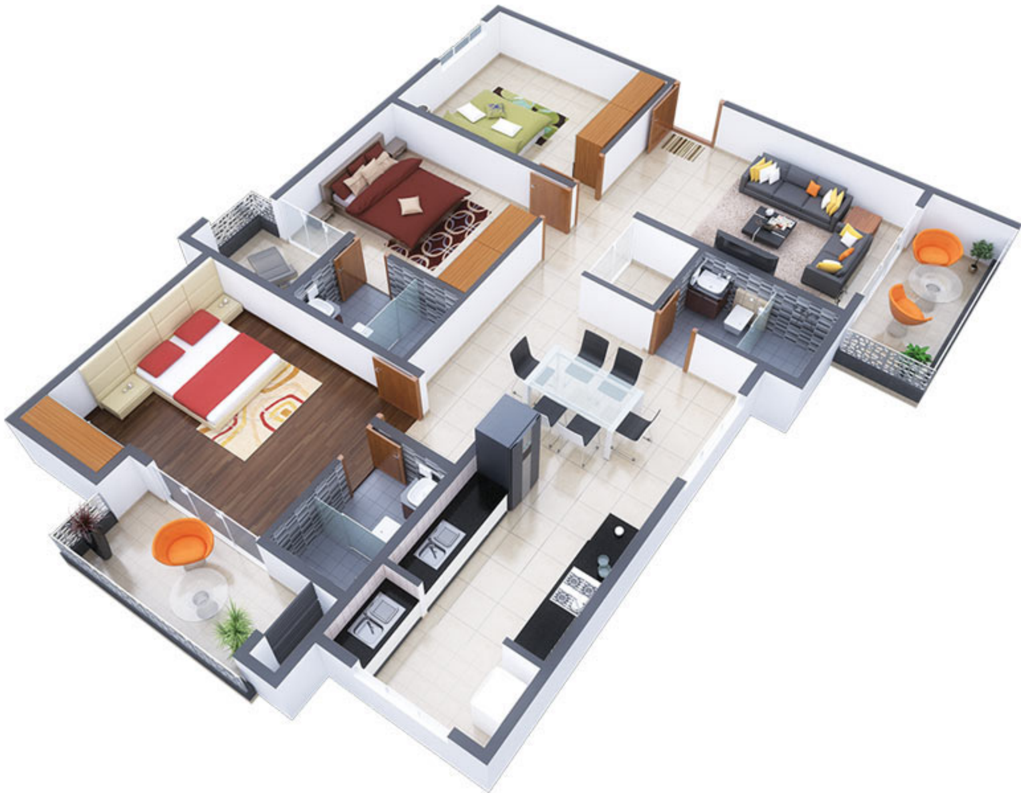
FLAT-5 ISOMETRIC VIEW