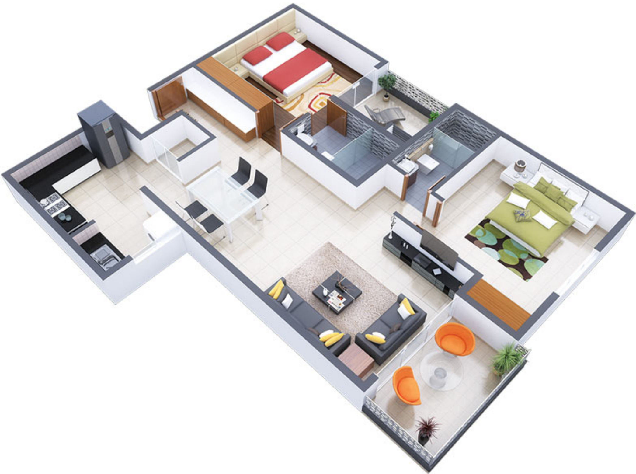
FLAT-3 ISOMETRIC VIEW