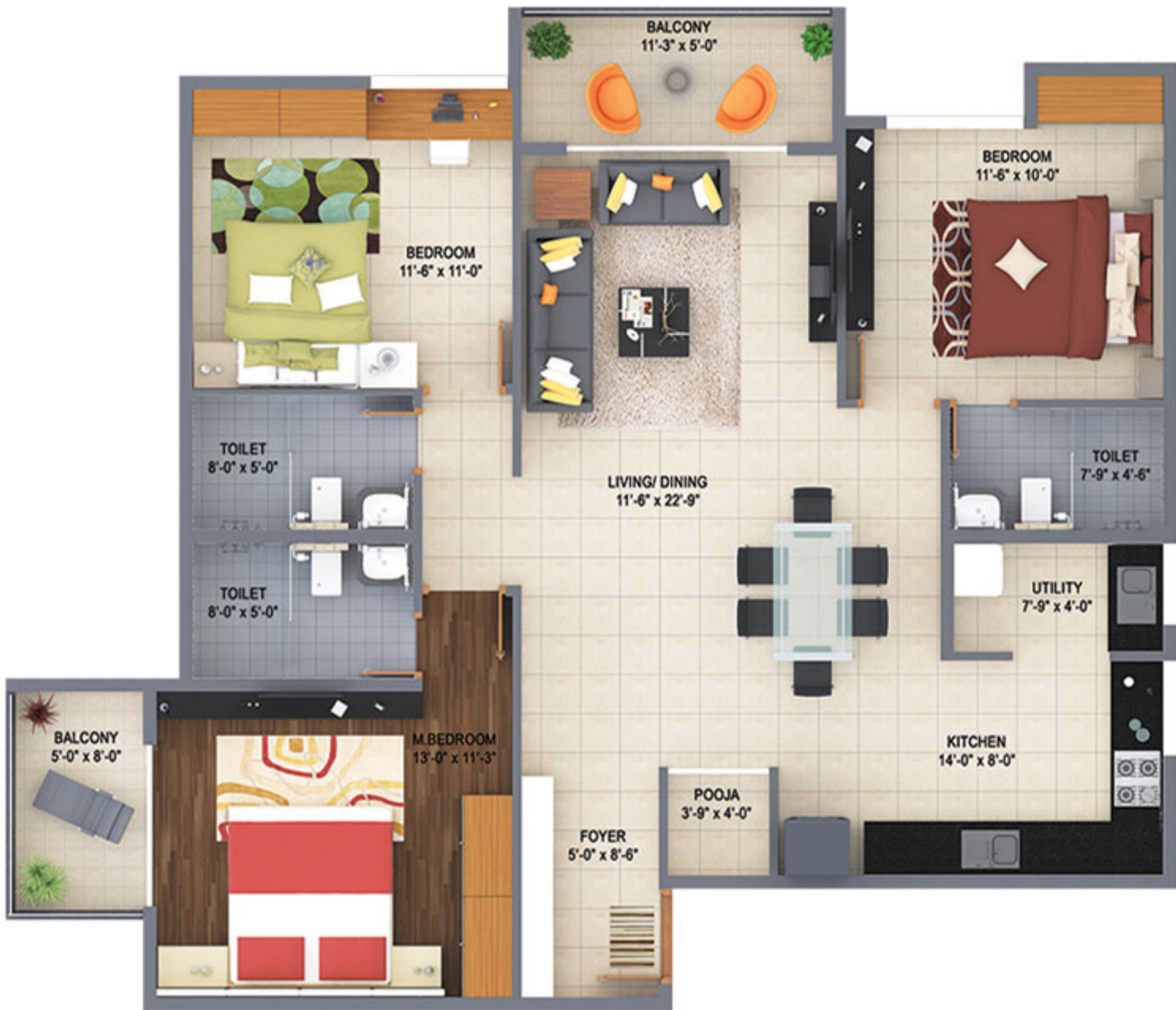
FLAT-1 FLOOR PLAN