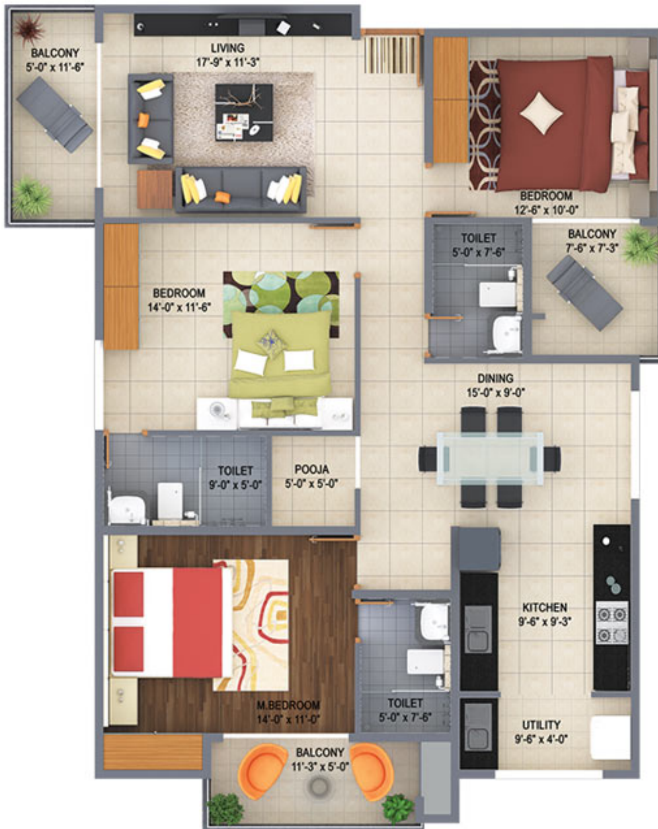
FLAT-8 FLOOR PLAN