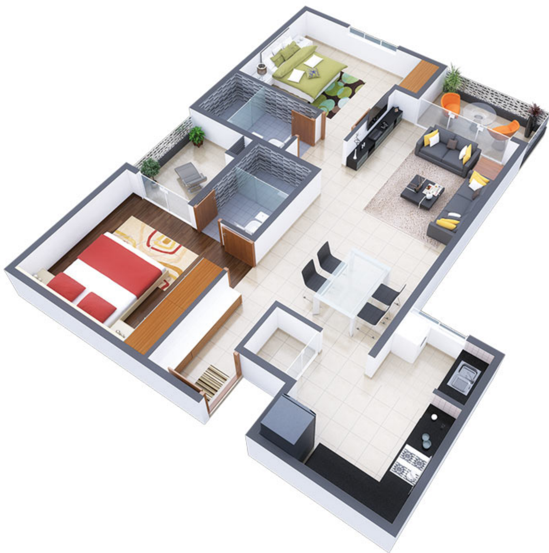
FLAT-2 ISOMETRIC VIEW