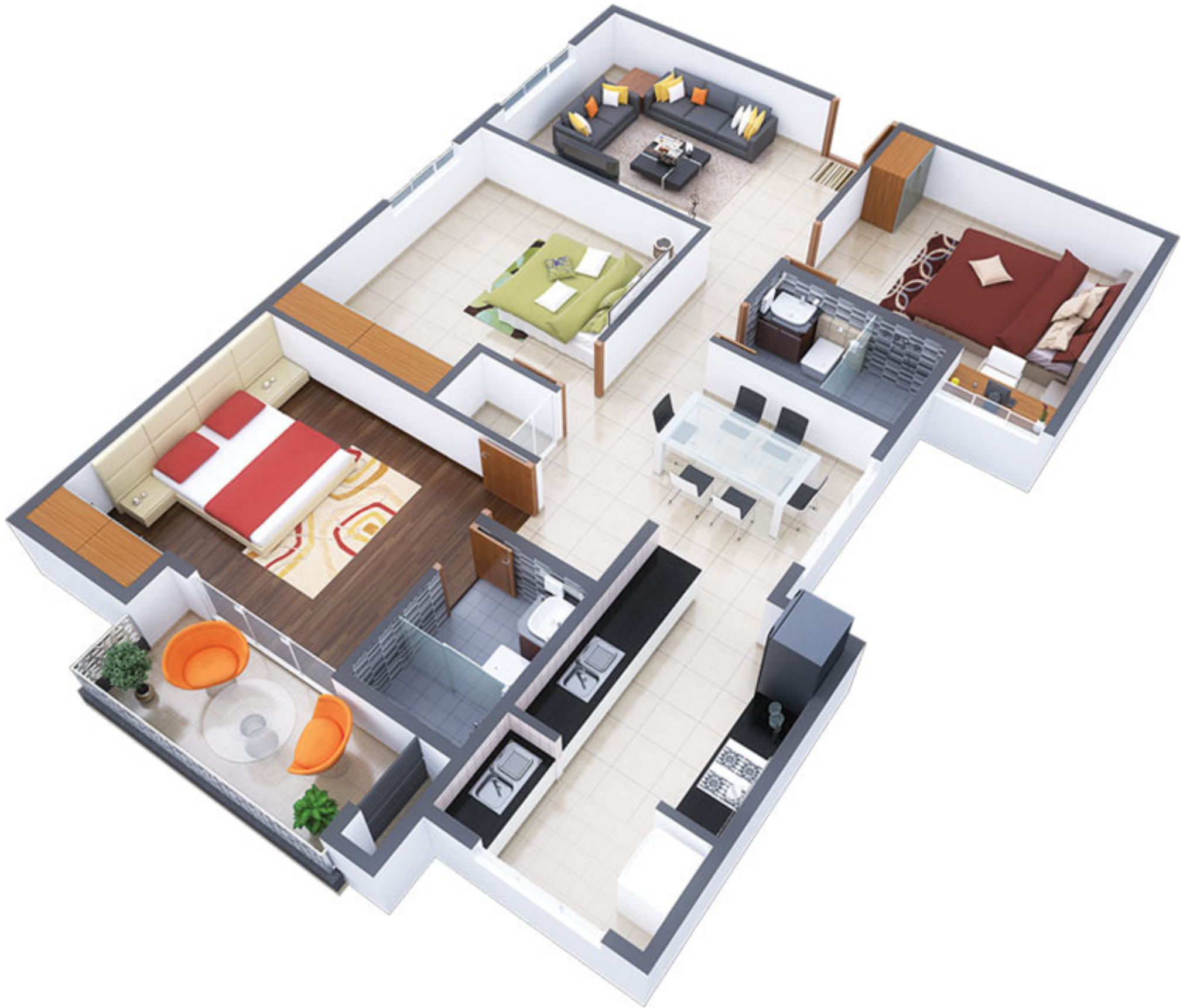
FLAT-6 ISOMETRIC VIEW