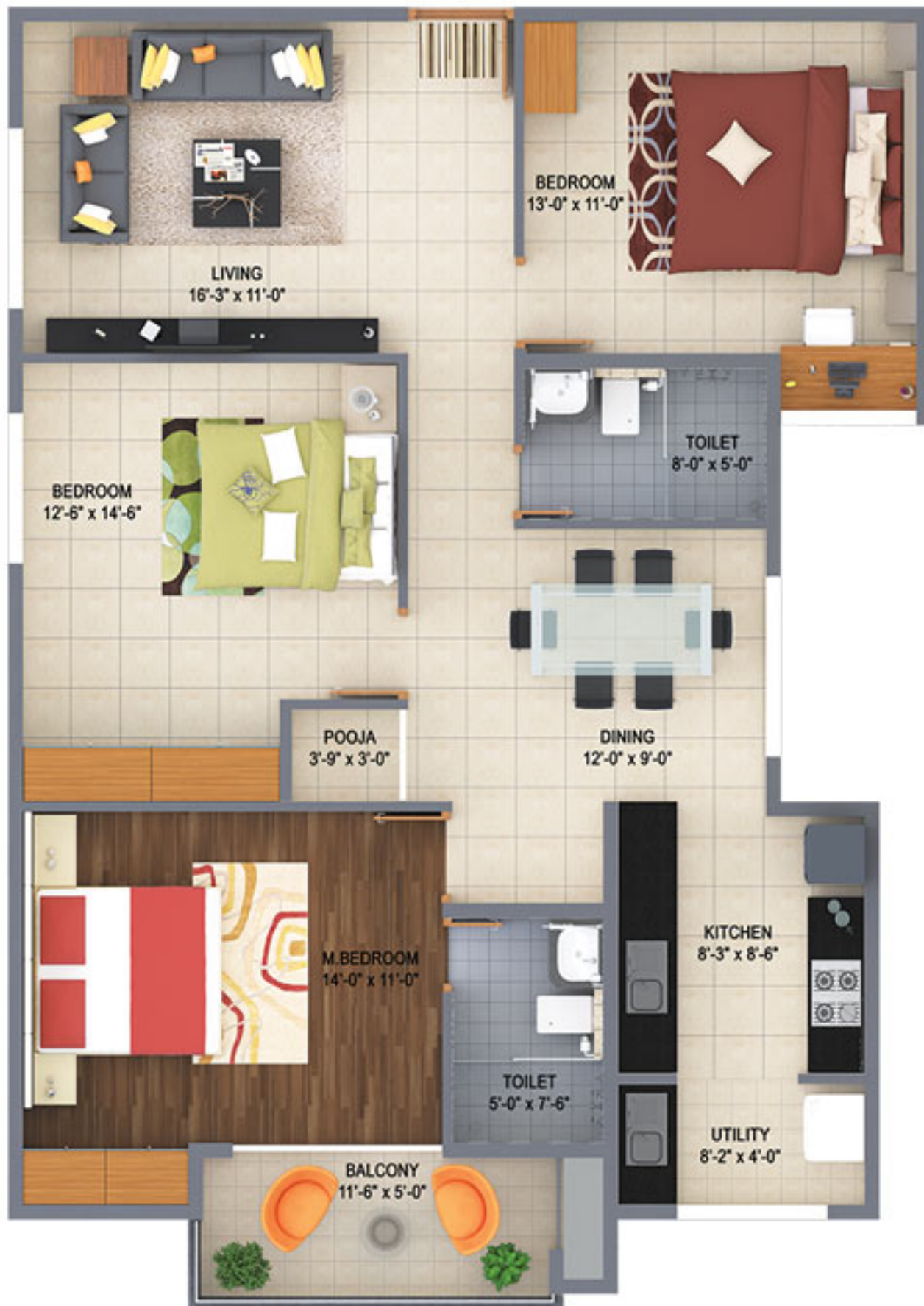
FLAT-6 FLOOR PLAN