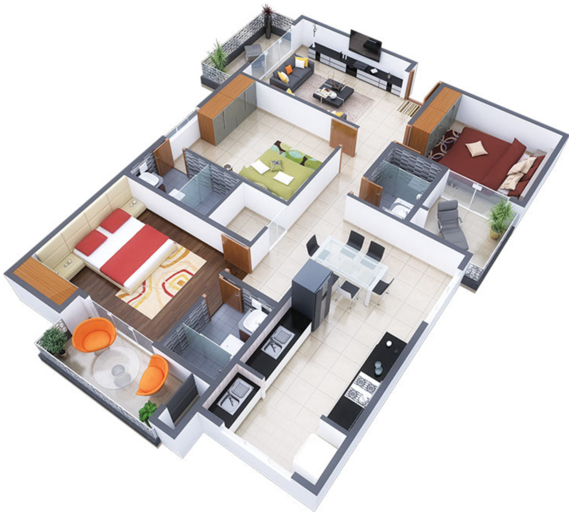
FLAT-8 ISOMETRIC VIEW