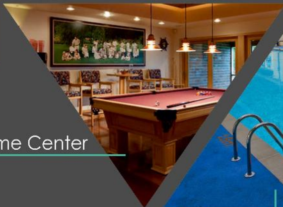
Indoor Game Center