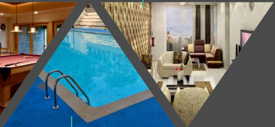
Efficient Apartment Layout