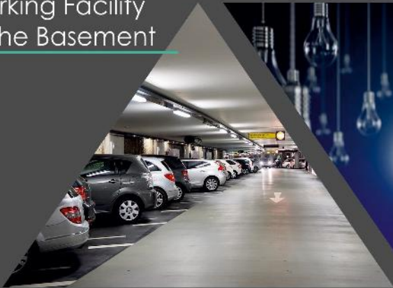
Parking Facility at the Basement