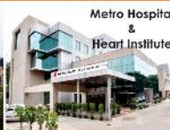
Metro Hospital & Heart Institute