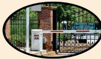
Gated Community with Security System