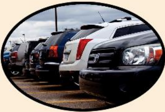
Designated Car Parking