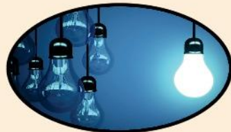
24x7 Power Backup