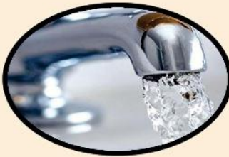
24X7 Water Supply