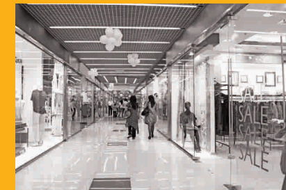
Shops & Stores