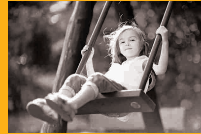
Kid's Play Area