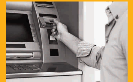
Banks & ATMs