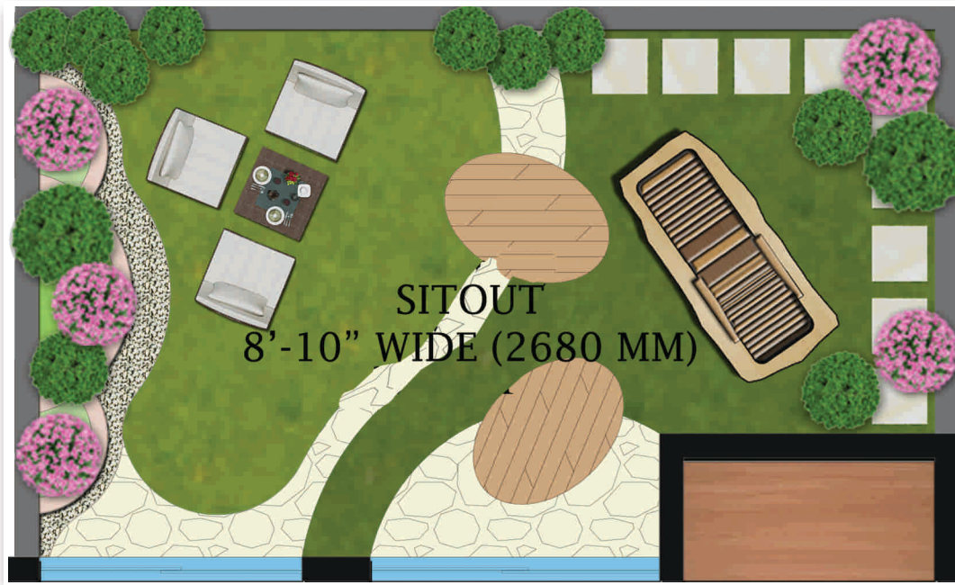
Garden Homes Area