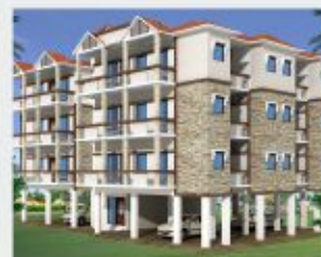
Auqa Grandiosa, Goa