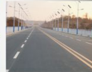
Vaishali Estate, Jaipur