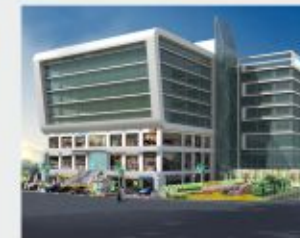
Jaipur Electronic Market, Jaipur