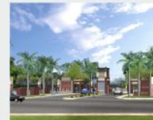
Manglam Greens, Jaipur