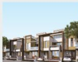
Aangan Prime, Jaipur