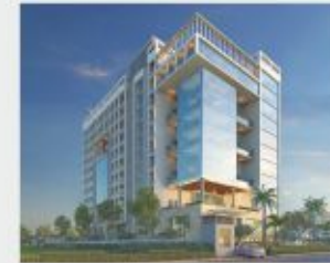
Signature Tower, Jaipur