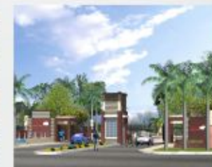
Manglam City, Alwar