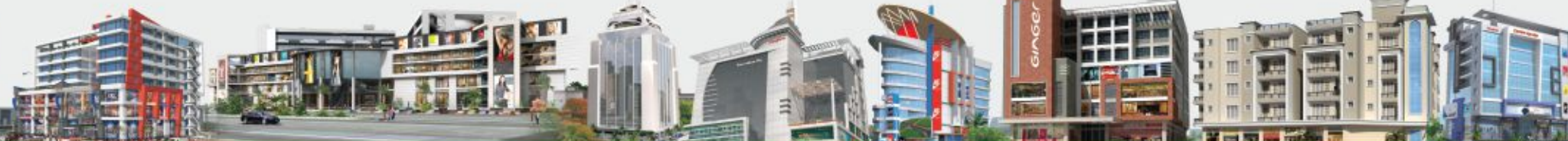
Finance Infrastructure | Shopping Malls | Corporate Offices | Residential Apartments