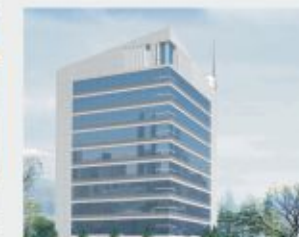
Okay Plus Tower, Jaipur