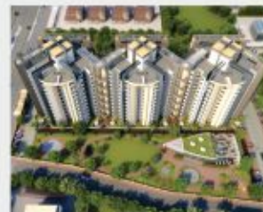
Grand Residency, Jaipur