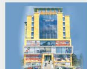
Anchor Mall, Jaipur