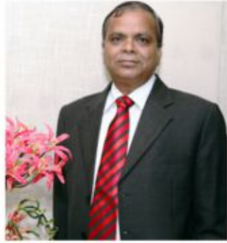
CHAIRMAN MANGLAM GROUP