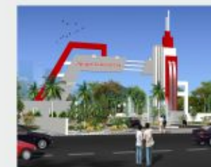
Manglam Industrial City, Chomu