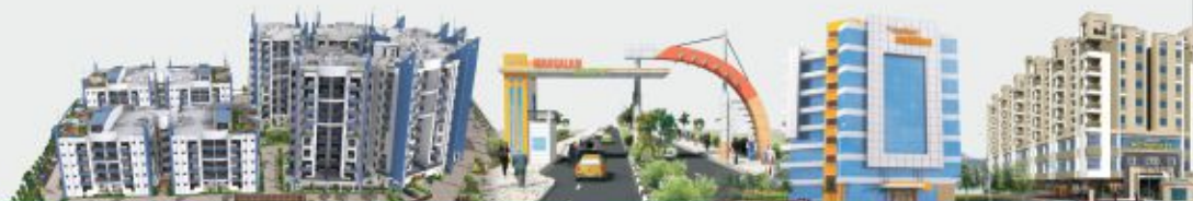
Townships | Hotels | Amusement Park