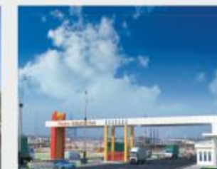
Industrial Park, Manoharpur