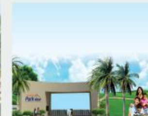
Manglam Park View, Jaipur