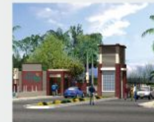
Shri Krishna Van, Jaipur