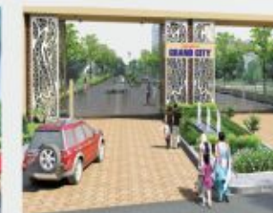
Grand City, Jaipur