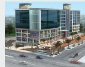
Fun Square, Udaipur