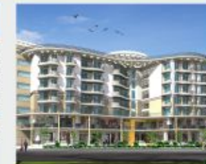
Manglam Plaza, Bhilwara