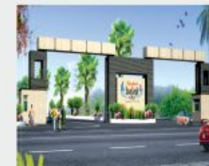
Balaji City, Jaipur