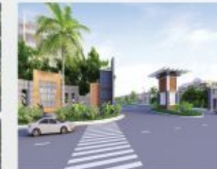
Manglam Greens, Bikaner