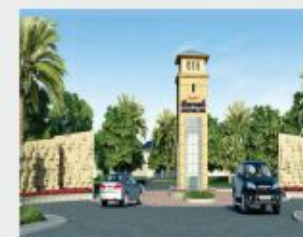
Kherwadi Industrial Area, Jaipur