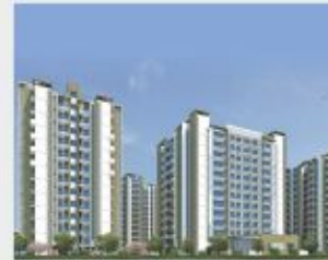
Rangoli Greens, Jaipur