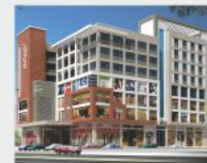
Geejgarh Tower, Jaipur