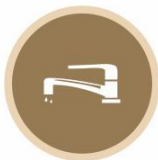
BRANDED SANITARY FITTINGS