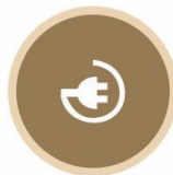
BRANDED ELECTRICAL FITTINGS