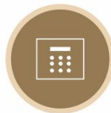
INTERCOM & VIDEO DOOR SECURITY