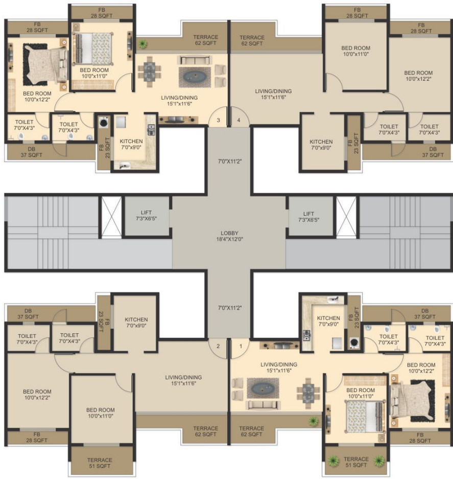
13TH FLOOR PLAN