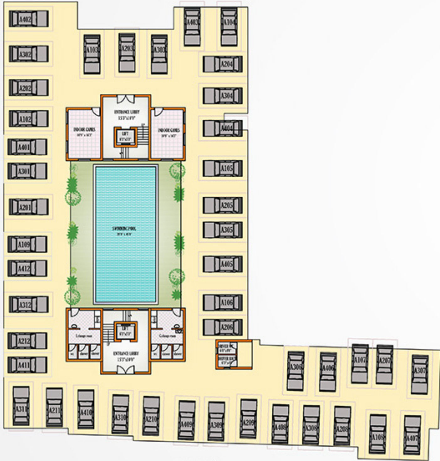
SITE FLOOR PLAN BLOCK - A