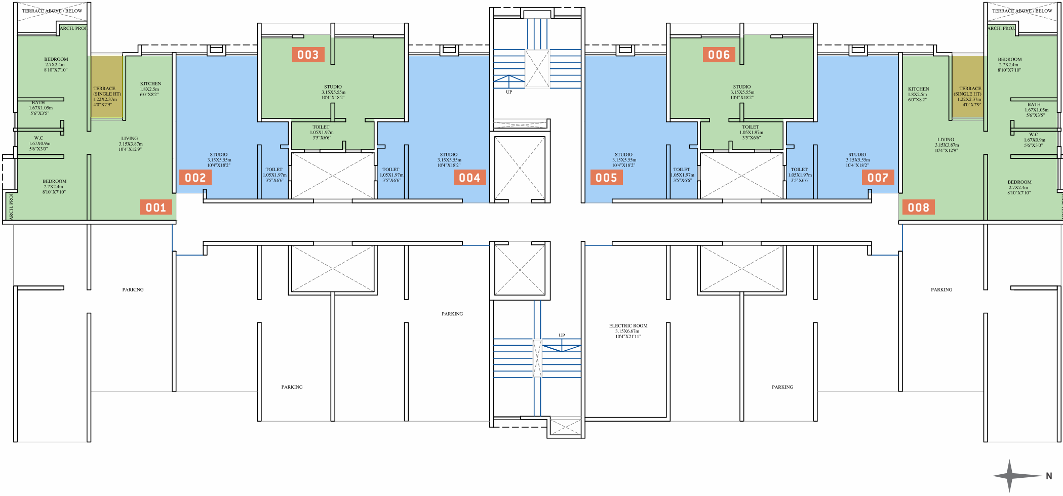
WING B | GROUND FLOOR PLAN