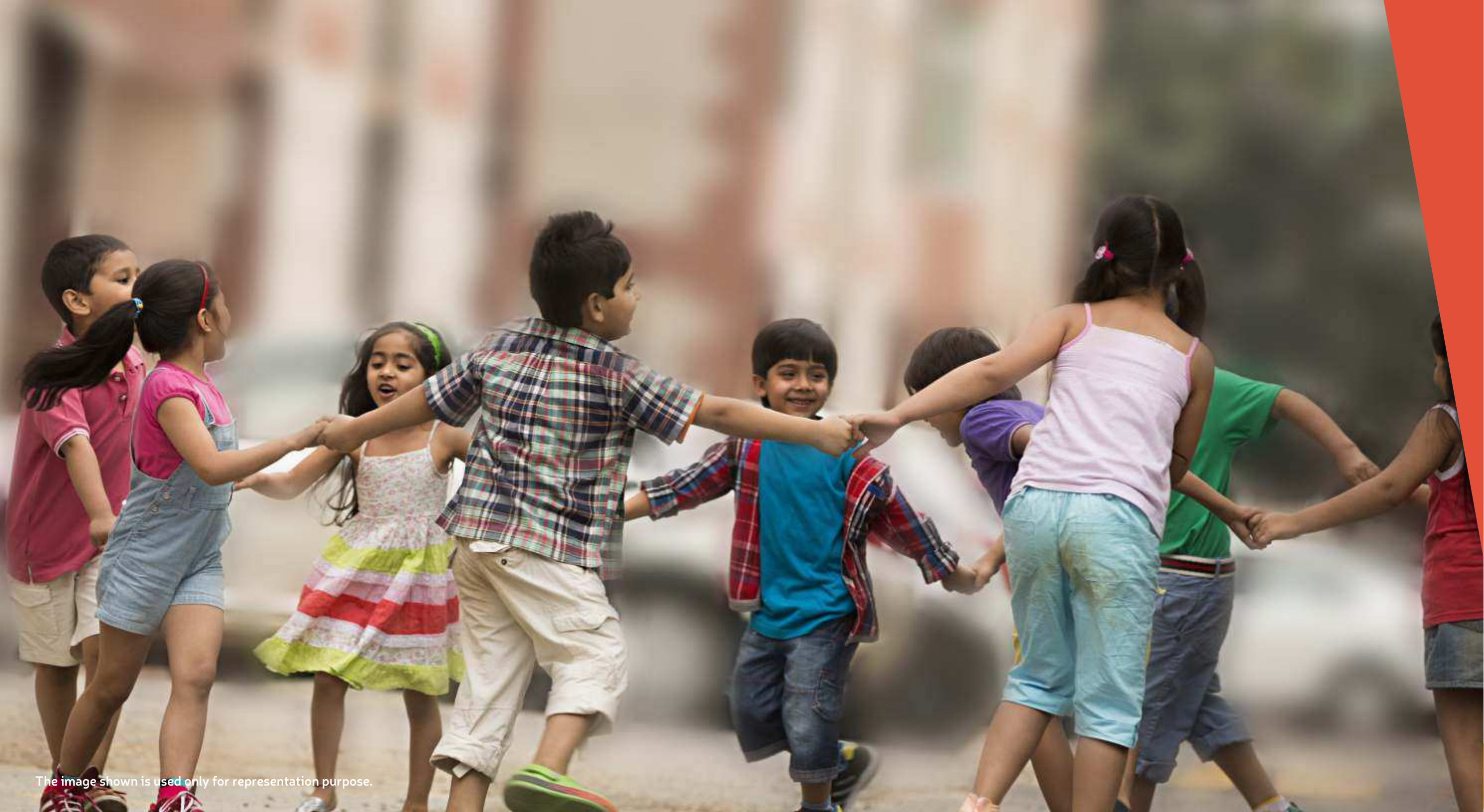
The image shown is used only for representation purpose.