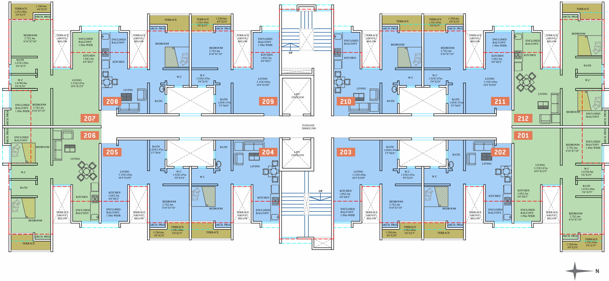
WING B, C & D | 2nd, 4th & 6th EVEN FLOOR PLAN