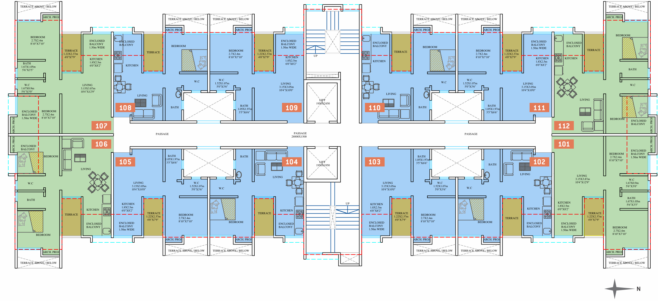
WING B, C & D | 1st, 3rd, 5th & 7th ODD FLOOR PLAN