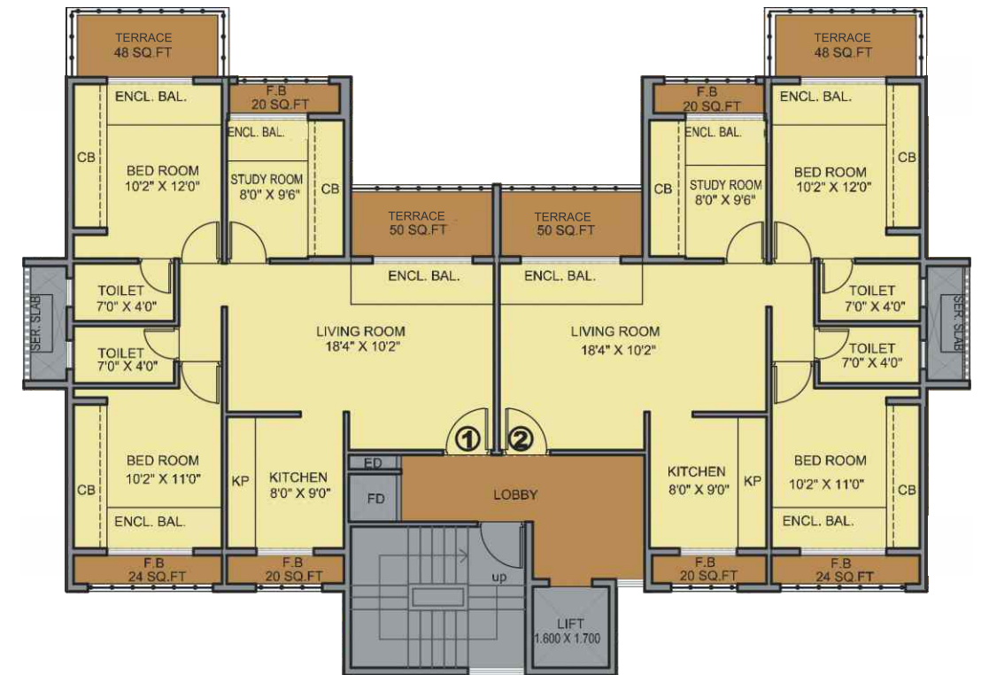
1ST, 3RD & 5TH FLOOR PLAN