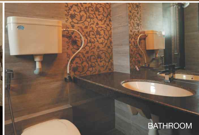
ACTUAL SHOW FLAT PHOTOGRAPHS