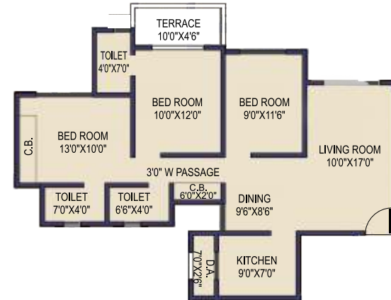
3 BHK Flat Plan