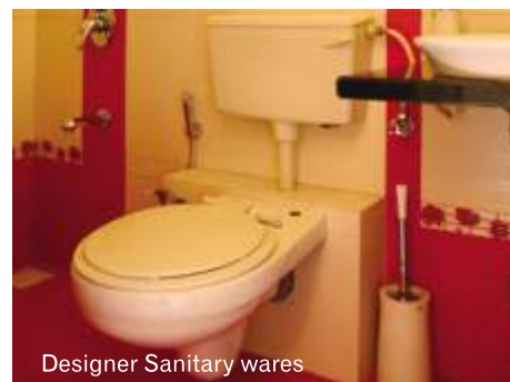
Designer Sanitary wares