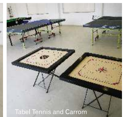
Tabel Tennis and Carrom