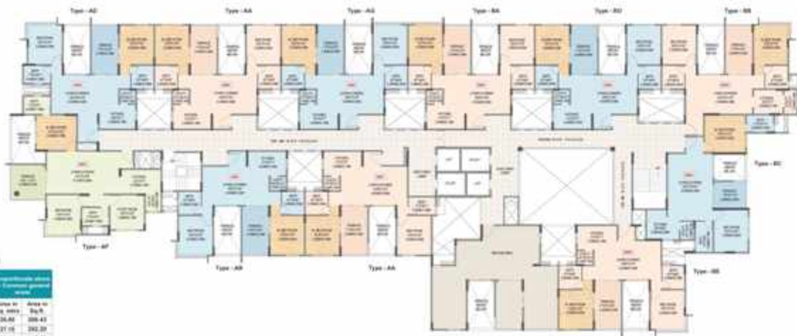
CARPET AREA STATEMENT - A WING