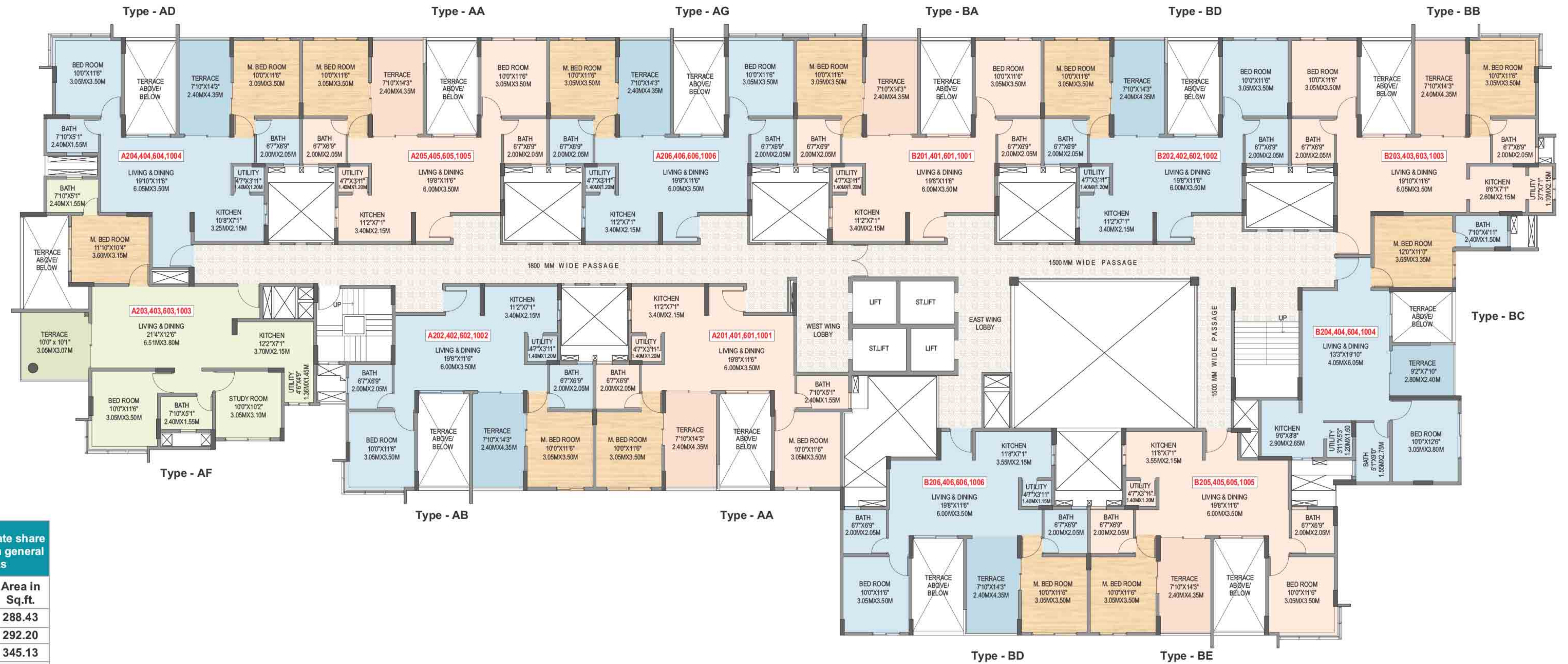
CARPET AREA STATEMENT - A WING