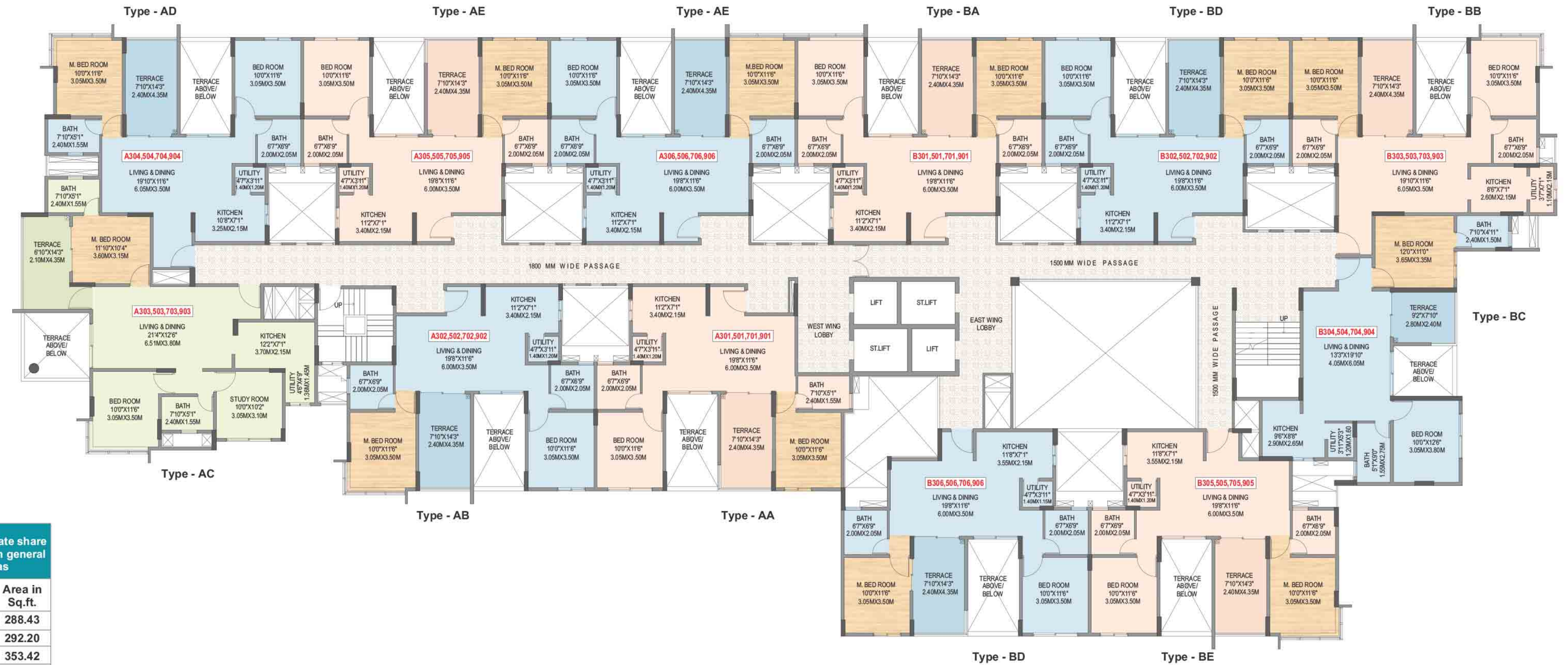
CARPET AREA STATEMENT - A WING