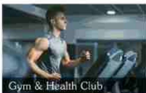
Gym & Health Club