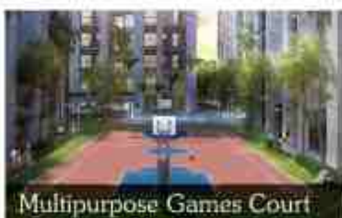
Multipurpose Games Court