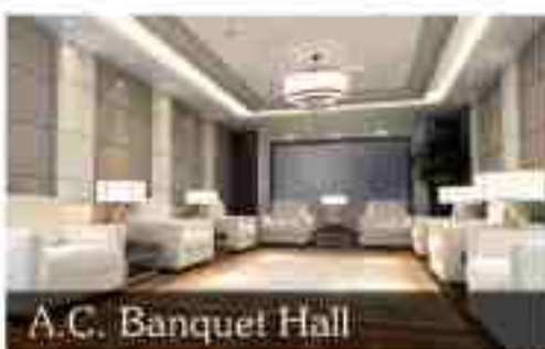
A.C. Banquet Hall