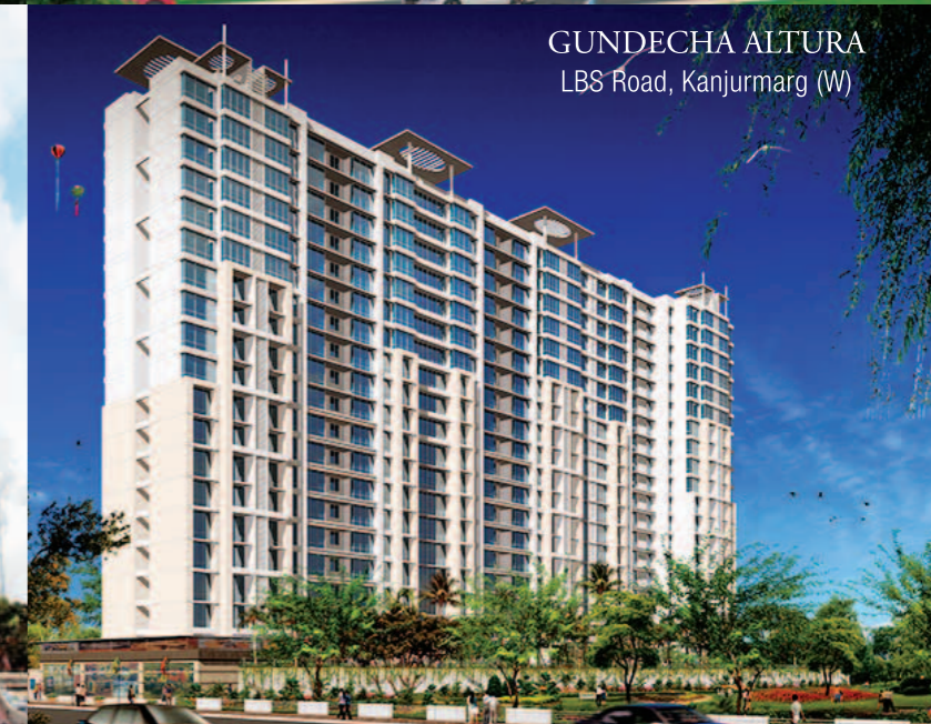
GUNDECHA ALTURA LBS Road, Kanjurmarg (W)