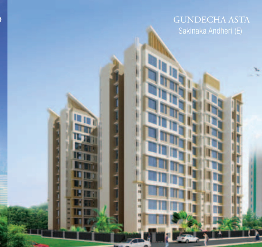
GUNDECHA ASTA Sakinaka Andheri (E)