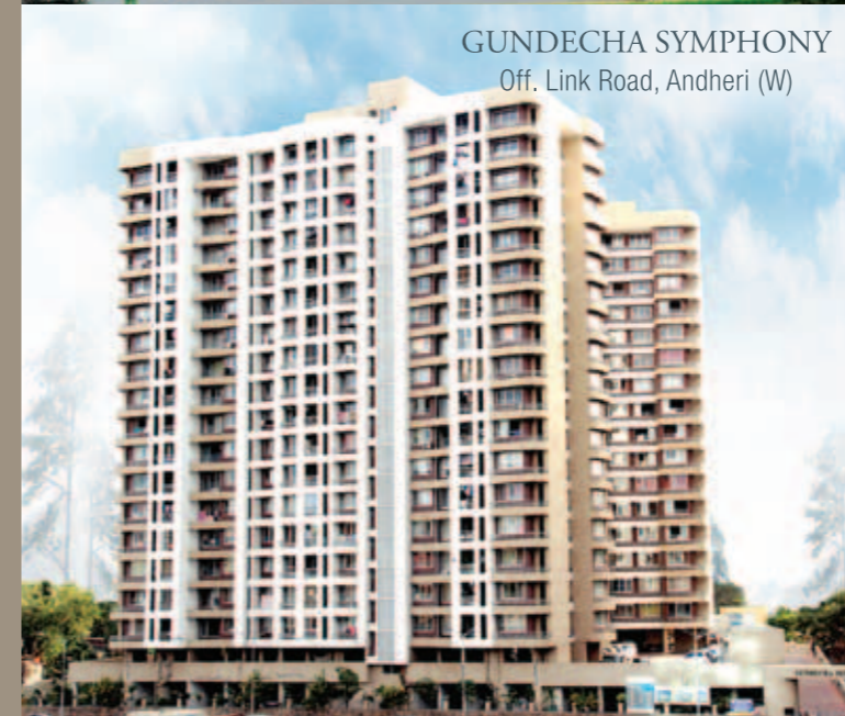
GUNDECHA SYMPHONY Off. Link Road, Andheri (W)