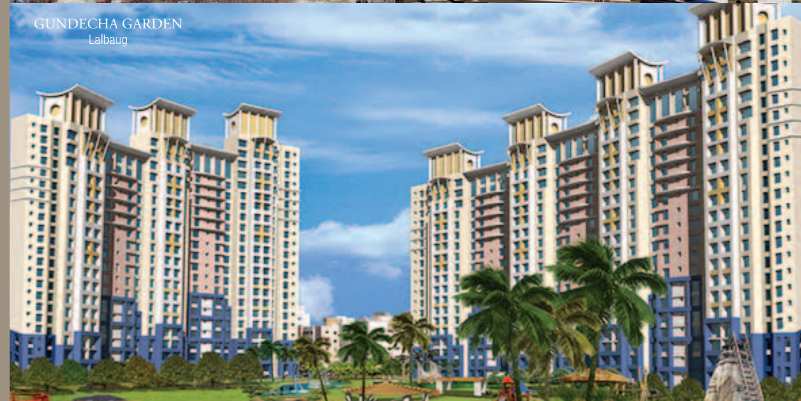
GUNDECHA GARDEN Lalbaug