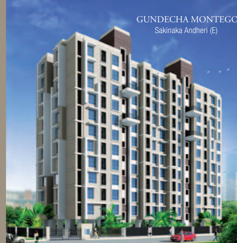
GUNDECHA MONTEGO Sakinaka Andheri (E)

Gundecha Builders are property developers and builders based in Mumbai, with more than 100 residential, commercial and industrial projects. They have been in existence for more than 47 years, steadily building Mumbai City's skyline and lifestyle over the years, and have over 18,000 satisfied customers. Many of their structures have become proud city landmarks as well. Customer delight is the Gundecha credo. The company aims to satisfy its customers by exceeding their expectations, and employing a corporate and transparent approach that gives customers immense faith and confidence in the company. The company has leveraged the services of internationally renowned architects and the latest construction techniques to ensure superlative standards of quality. This, along with timely deliveries, has gained the group consistent customer confidence.