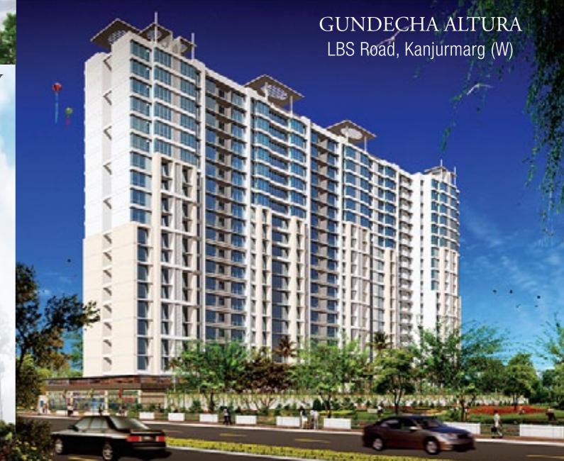
GUNDECHA ALTURA LBS Road, Kanjurmarg (W)