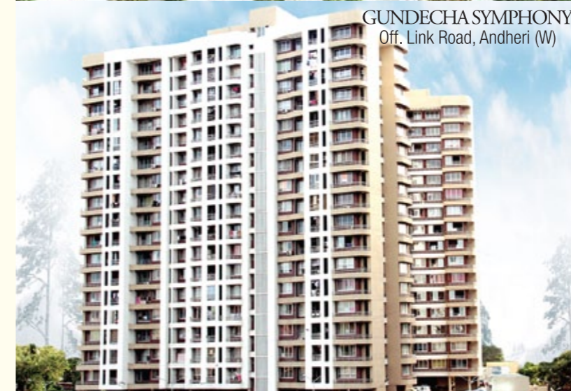
GUNDECHA SYMPHONY Off. Link Road, Andheri (W)