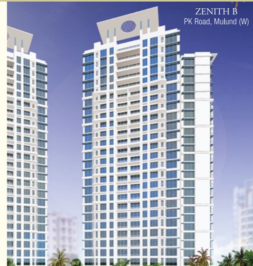
ZENITH B PK Road, Mulund (W)

Gundecha Builders are property developers and builders based in Mumbai, with more than 100 residential, commercial and industrial projects. They have been in existence for more than 47 years, steadily building Mumbai City's skyline and lifestyle over the years, and have over 18,000 satisfied customers. Many of their structures have become proud city landmarks as well. Customer delight is the Gundecha credo. The company aims to satisfy its customers by exceeding their expectations, and employing a corporate and transparent approach that gives customers immense faith and confidence in the company. The company has leveraged the services of internationally renowned architects and the latest construction techniques to ensure superlative standards of quality. This, along with timely deliveries, has gained the group consistent customer confidence.