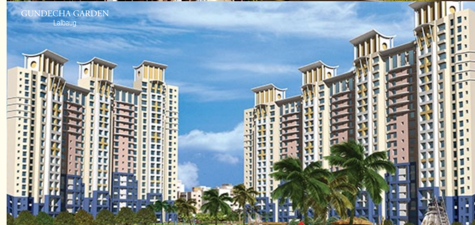
GUNDECHA GARDEN Lalbaug