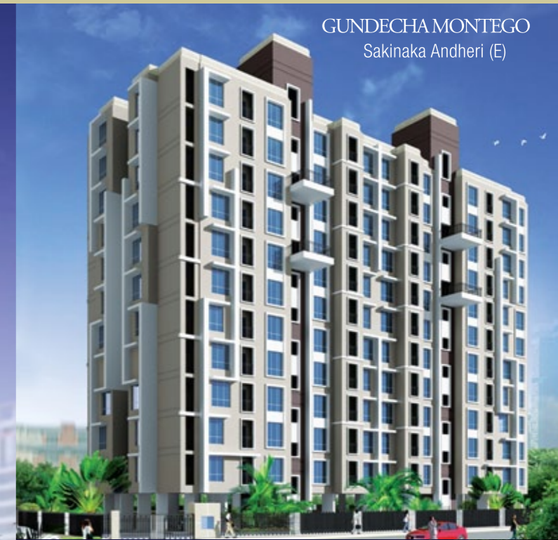
GUNDECHA MONTEGO Sakinaka Andheri (E)