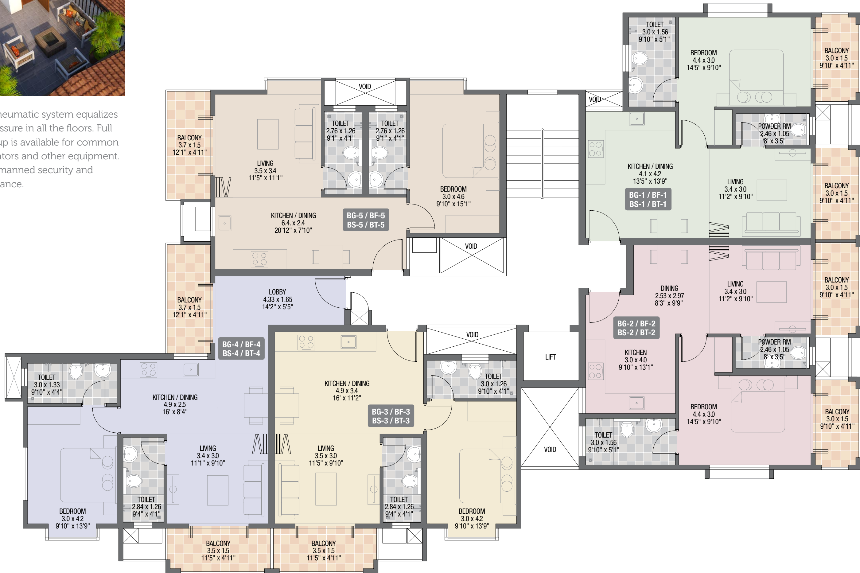
Typical Floor Plan Building B

The hydro-pneumatic system equalizes the water pressure in all the floors. Full power back-up is available for common lighting, elevators and other equipment. There's 24x7 manned security and CCTV surveillance.