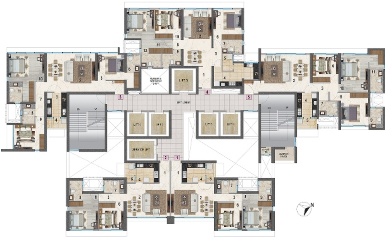
TOWER - A TYPICAL FLOOR PLAN