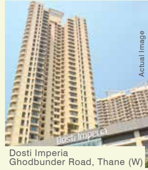
Dosti Imperia Ghodbunder Road, Thane (W)