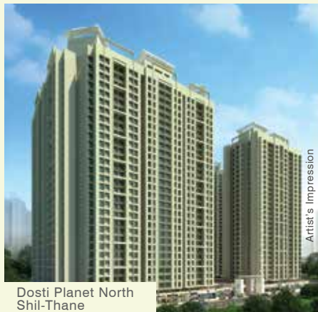
Dosti Planet North Shil-Thane