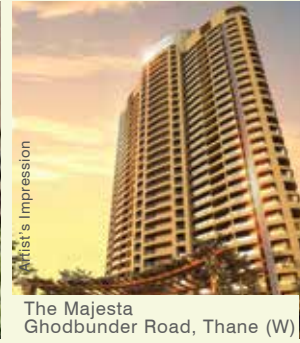
The Majesta Ghodbunder Road, Thane (W)