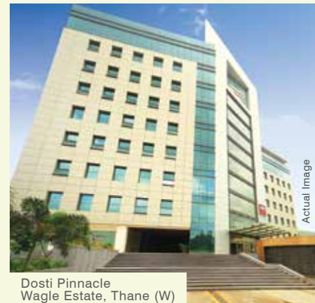
Dosti Pinnacle Wagle Estate, Thane (W)