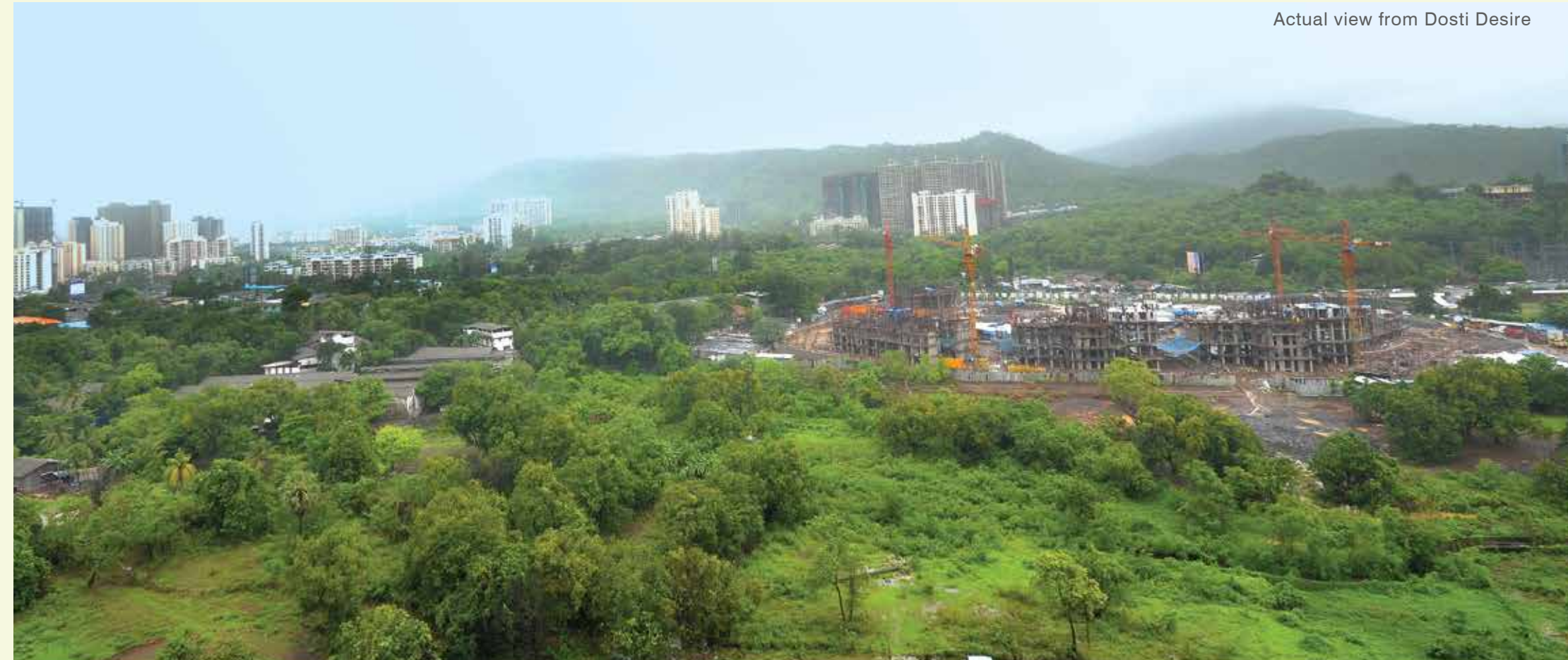
Actual view from Dosti Desire