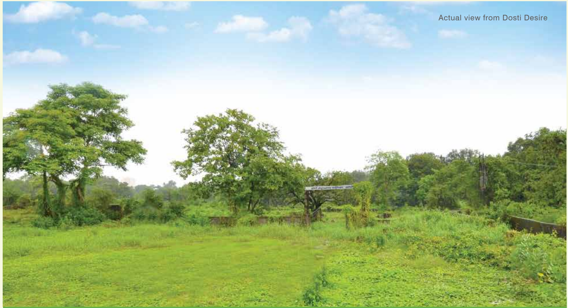
Actual view from Dosti Desire

Dosti Realty is about the spirit of friendship and strong tradition of trust. Ever since its inception in 1980, Dosti Realty is known as the hallmark of quality lifestyle and sculpture of friendship. Dosti Realty has been providing great value to customers in terms of design and aesthetics, contemporary architecture, innovations, construction quality and timely delivery. Dosti Realty has an impressive portfolio that houses 6,700 families with over 33,500 satisfied residents staying in a constructed area of over 7 million sq. ft. across Mumbai and Thane. Dosti Realty is now extending its footprint in cities like Pune and Ahmedabad.