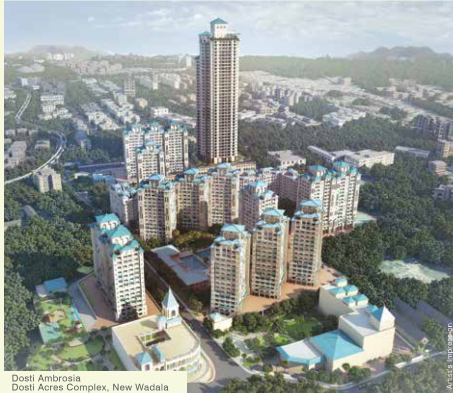
Dosti Ambrosia Dosti Acres Complex, New Wadala