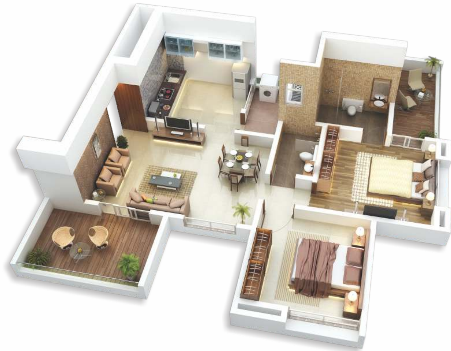
2 BHK - Flat 101