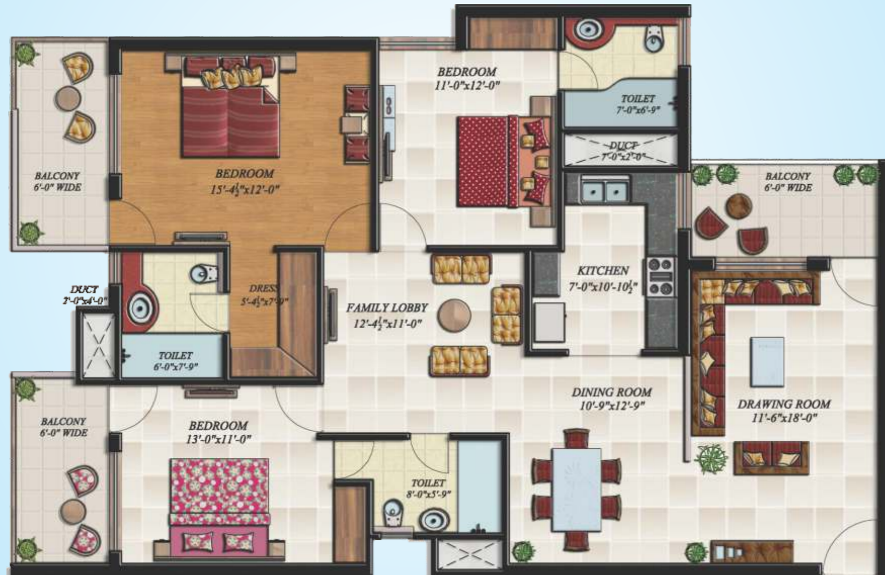
Three Bedroom Spacious Apartments Super Area : 2040 Sq. Ft. Including Parking Area